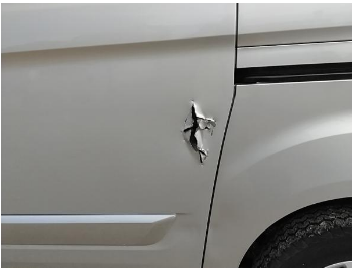
5: Door nsr Hole Over 10mm