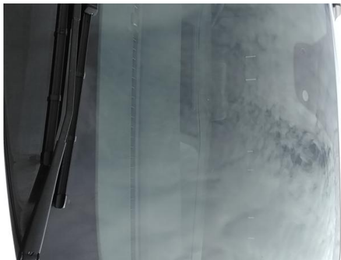
1: Screen Front Chipped UpTo 10mm