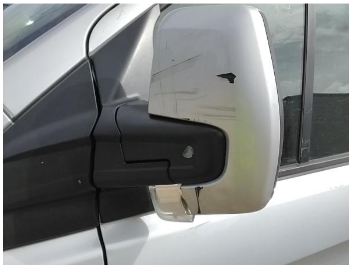
2: Door Mirror Assy nsf Broken Replace