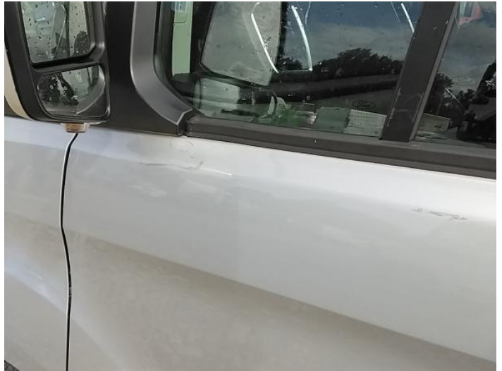
4: Door nsf Scratched Over 25mm Not Thru Paint