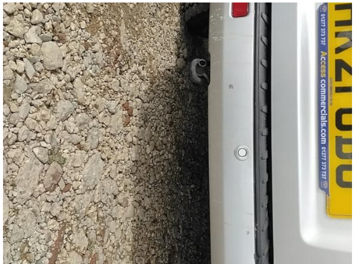
6: Bumper Rear Scratched 25 to 100mm Thru Paint