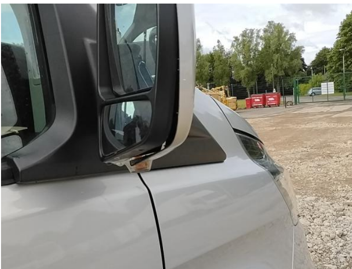
7: Door Mirror Assy osf Broken Replace