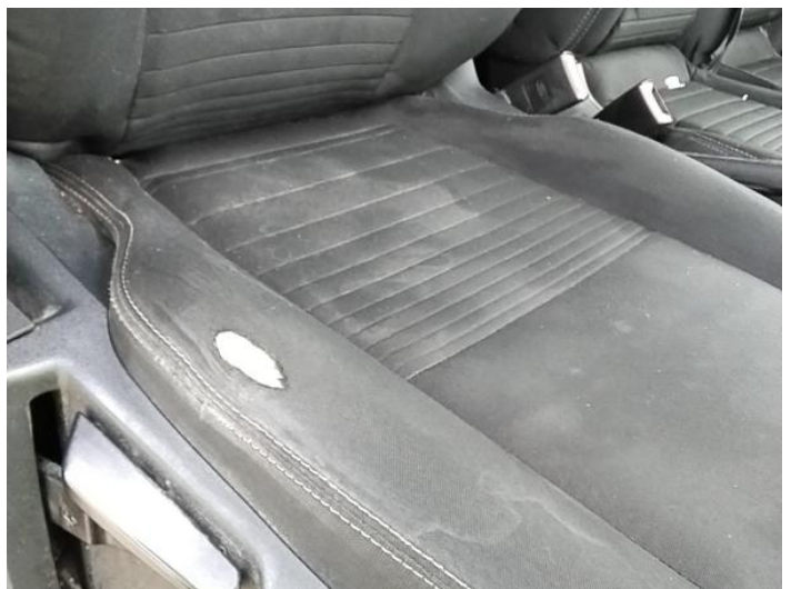
8: Seat Base Cover osf Holed Over 3mm