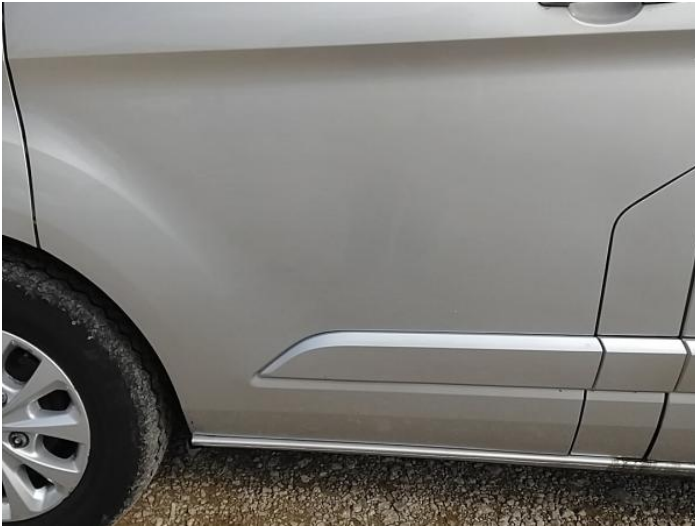
3: Door nsf Scratched Over 25mm Thru Paint