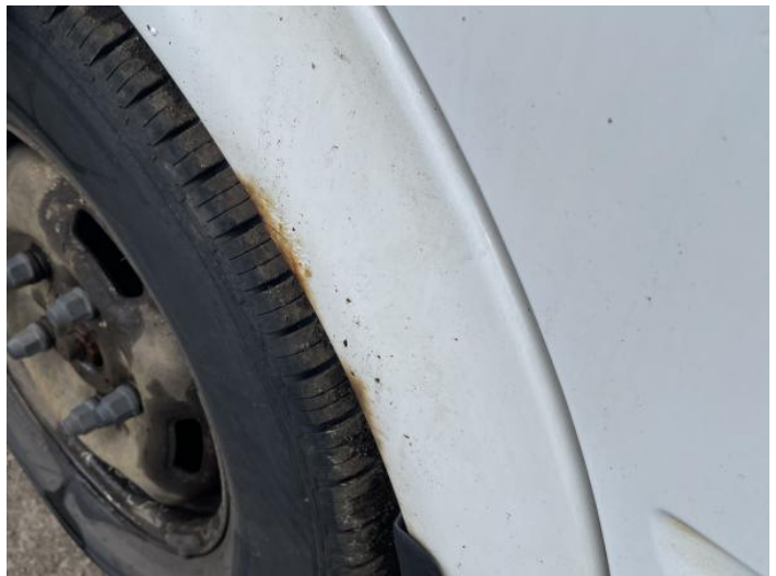
12: Door nsf Rusted Over 5mm