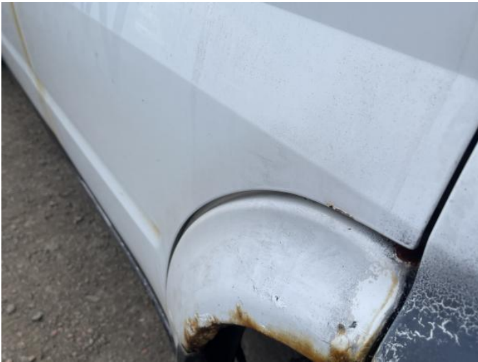
5: Door osf Rusted Over 5mm