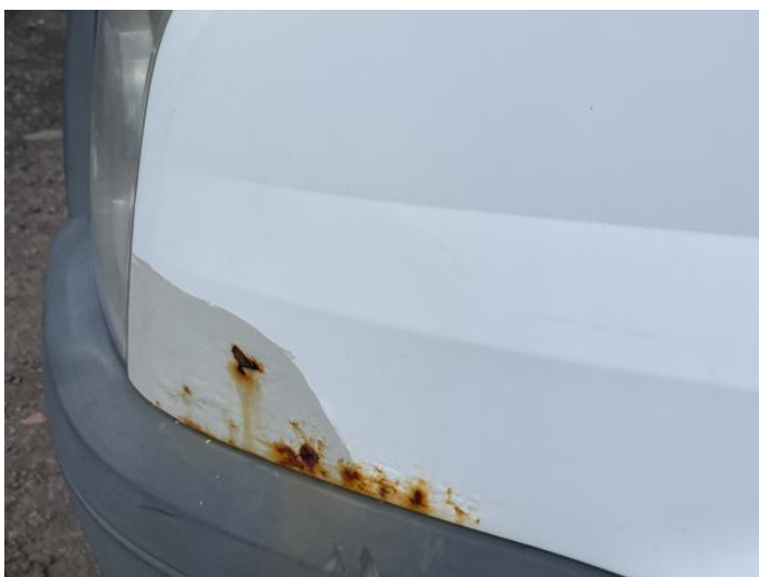
13: Wing nsf Rusted Over 5mm