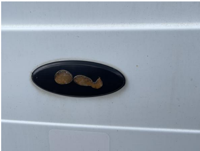
9: Badgedecal Rear Broken Replace