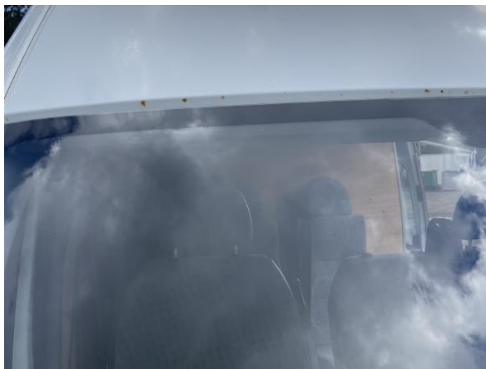
2: Roof Rusted Over 5mm