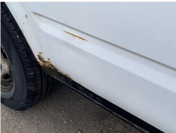
7: Qtr Panel osr Rusted Over 5mm