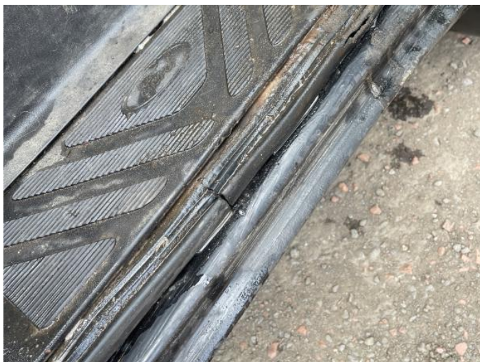
1: Sill os Rusted Over 5mm