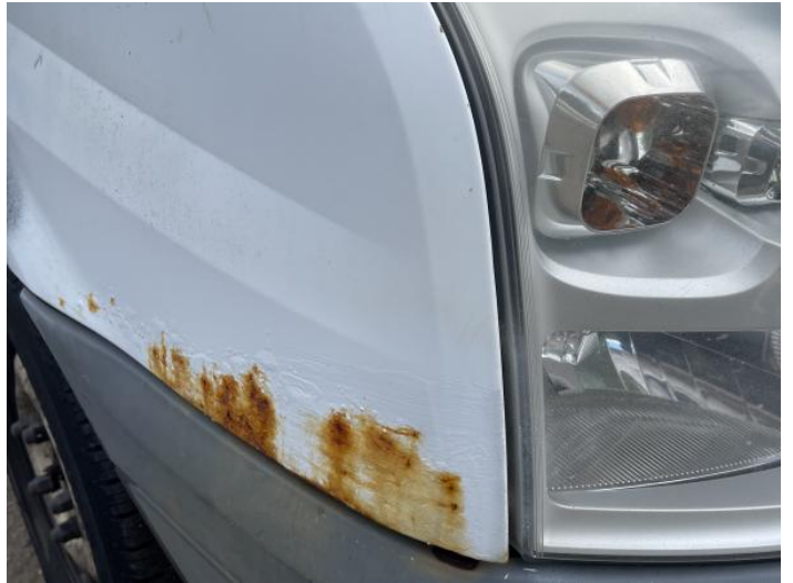
4: Wing osf Rusted Over 5mm