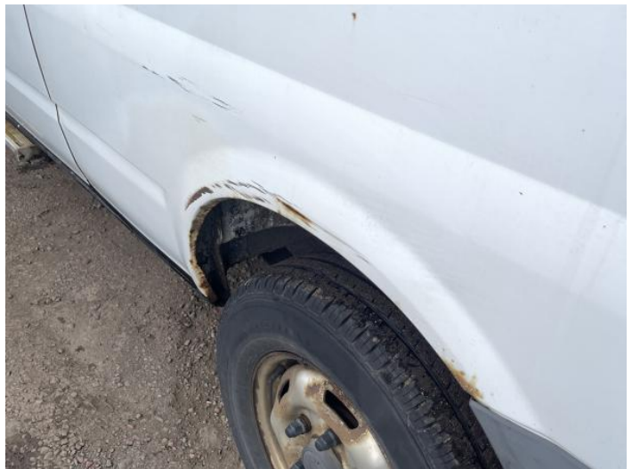
10: Qtr Panel nsr Dented Over 30mm