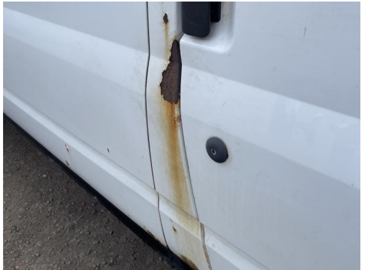
6: B Post os Rusted Over 5mm