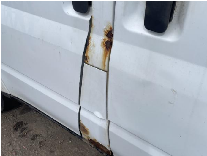
11: B Post ns Rusted Over 5mm