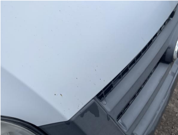
3: Bonnet Chipped Multiple Chips