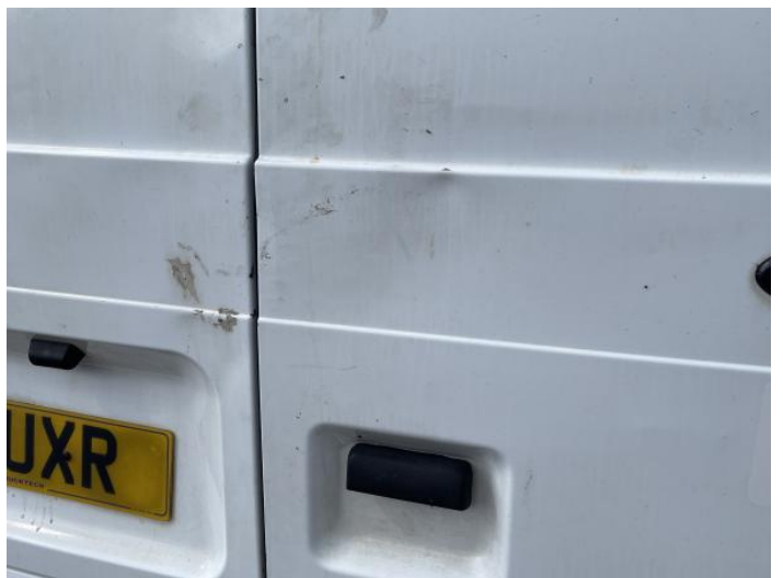
8: Tailgate Dented Over 30mm