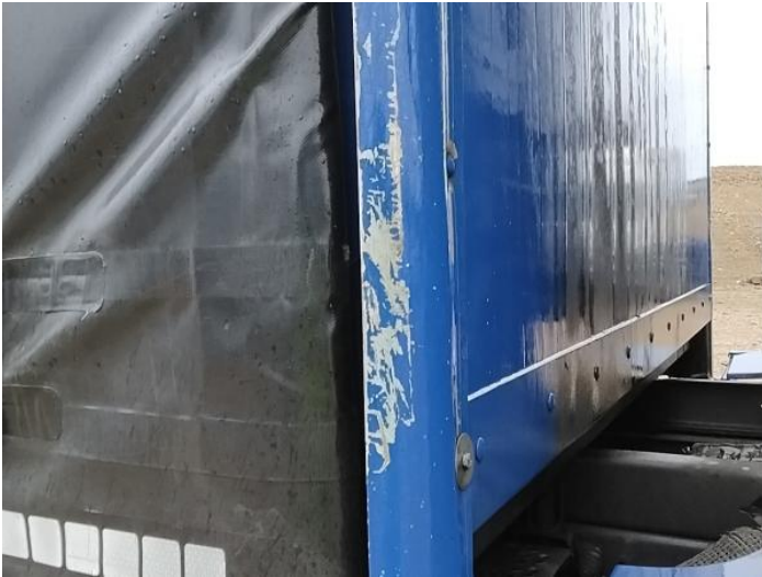
9: C Post os Scratched Over 25mm Thru Paint