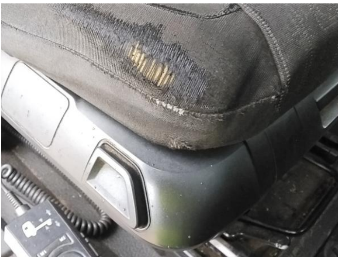
13: Seat Base Cover osf Holed Over 3mm