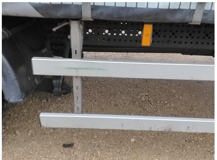
8: General Exterior Soiled Light