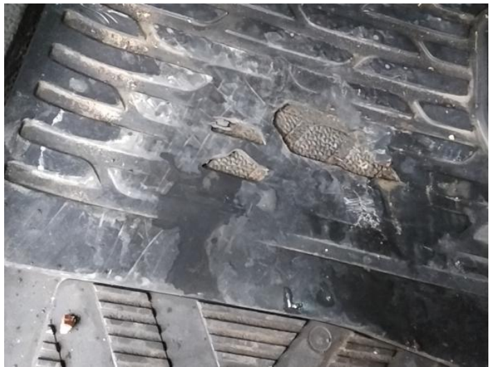
12: Carpets Front Holed Over 3mm