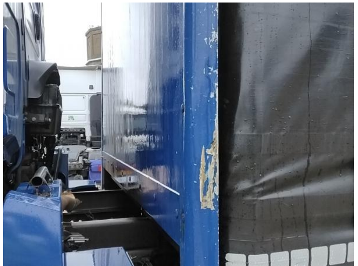
6: C Post ns Scratched Over 25mm Thru Paint