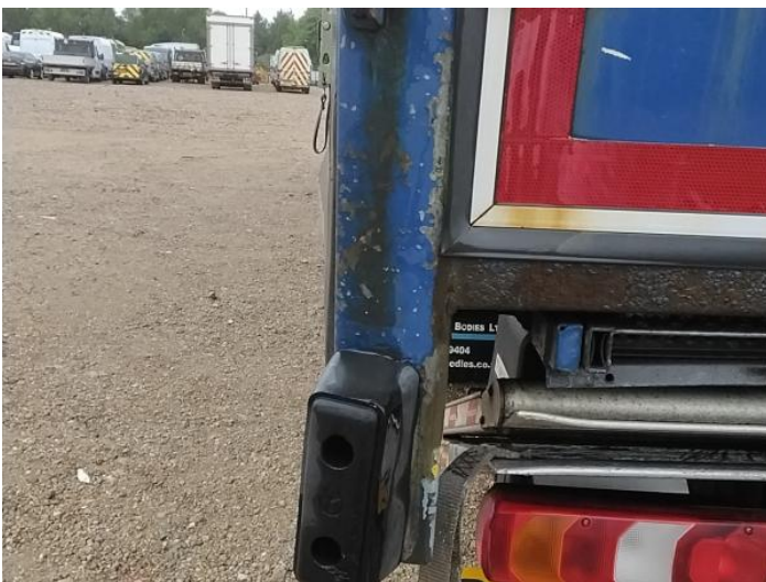
7: General Exterior Soiled Light