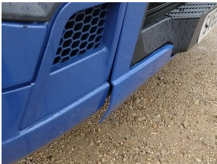
1: Bumper Front Insecure Action Required