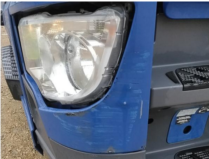
5: Fog Lamp Surrounds Scratched (Painted) Over 25mm Thru Paint