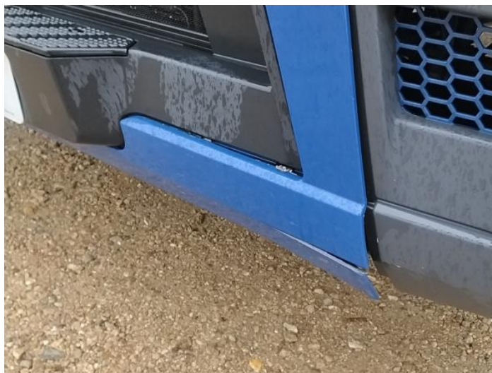
2: Bumper Front Insecure Action Required