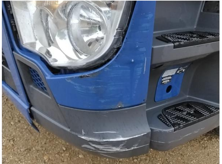
4: Bumper Front Scratched Over 100mm Thru Paint