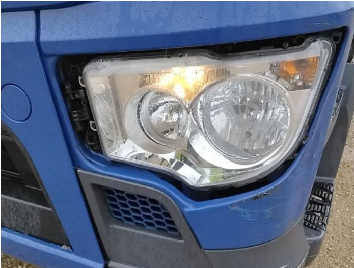
3: Headlamp ns Missing Replace