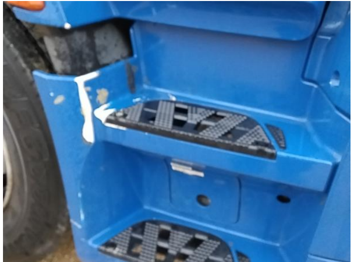
10: General Exterior Soiled Light