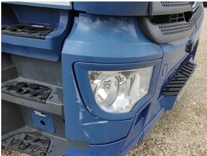
1: Wing nsf Scratched Over 25mm Thru Paint