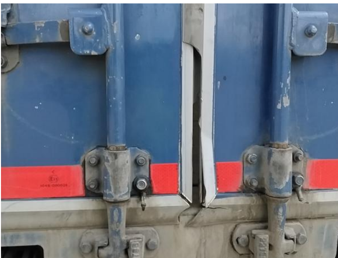
7: Door osr Hole Over 10mm