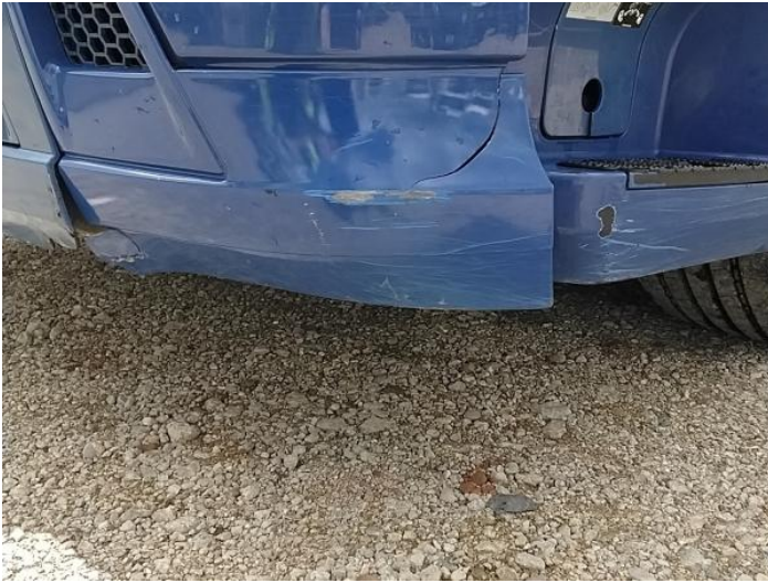
3: Bumper Front Cracked Over 25mm