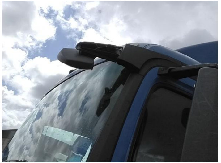
6: Door Mirror Assy nsf Missing Replace