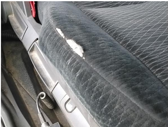
11: Seat Base Cover osf Torn Over 3mm