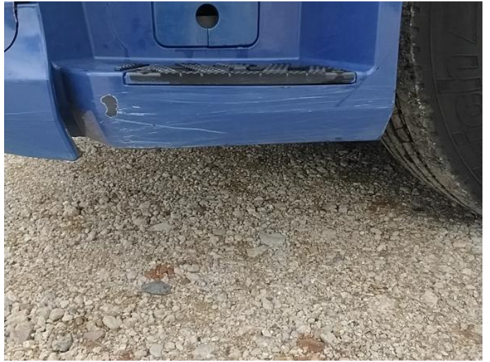
4: General Exterior Soiled Light