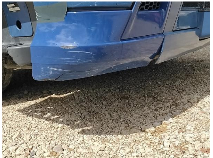
2: Bumper Front Cracked Over 25mm