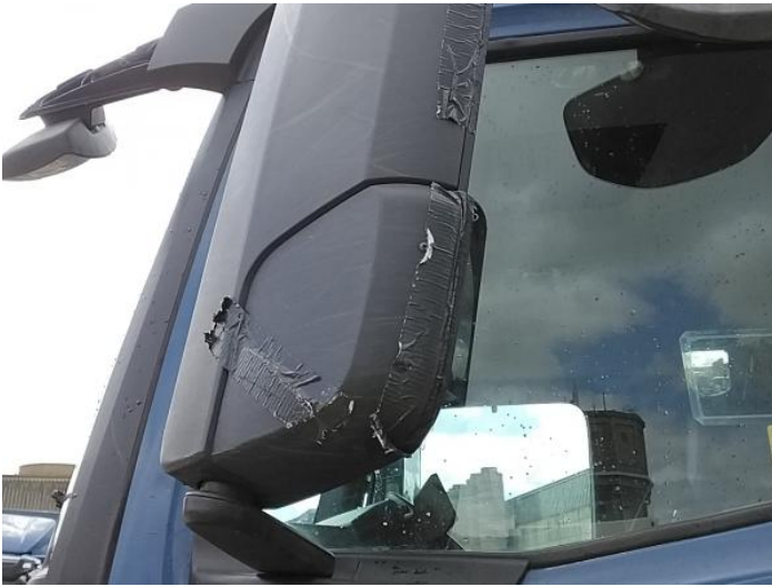
5: Door Mirror Assy nsf Broken Replace