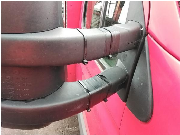
4: Door Mirror Assy osf Broken Replace