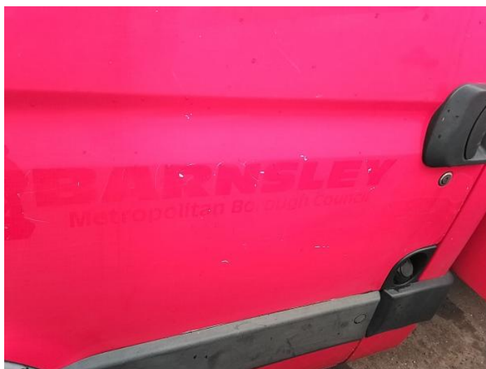
2: Door nsf Chipped Multiple Chips