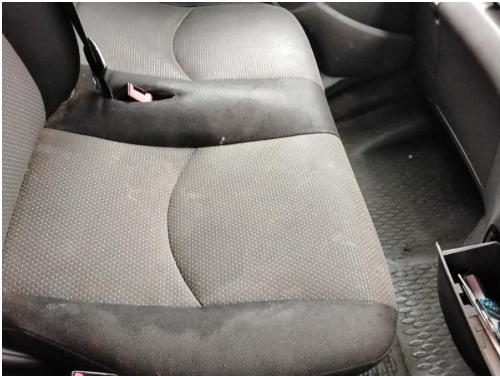
6: Seat Base Cover nsf Soiled Heavy