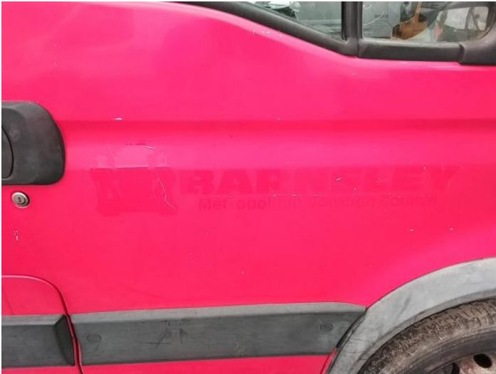
3: Door osf Chipped Multiple Chips