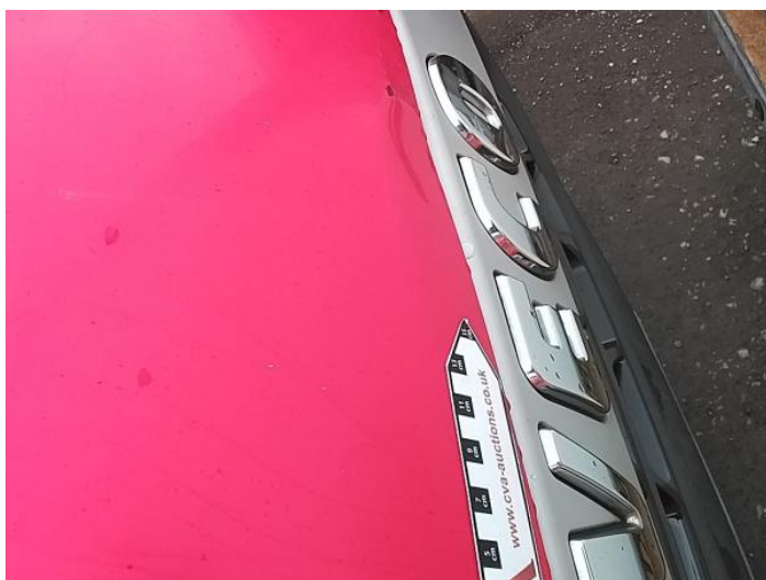
1: Bonnet Dented With Paint Damage