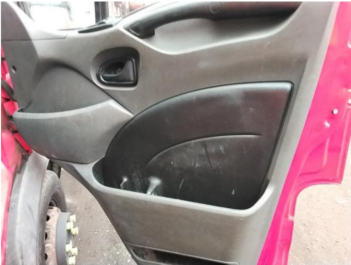
5: Door Pad osf Soiled Heavy