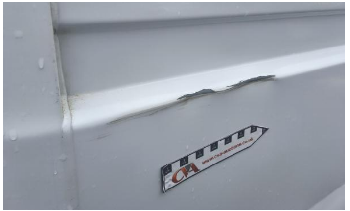
18: Qtr Panel osr Dented With Paint Damage