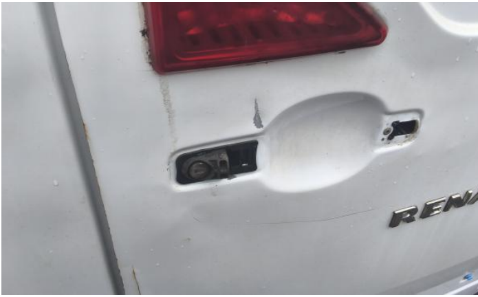
15: Handle Outer osr Missing Replace