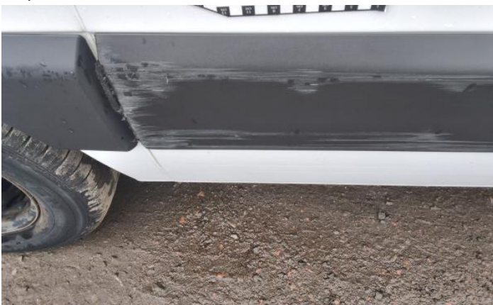
19: Qtr Panel Moulding os Scuffed (Unpainted) Over 100mm