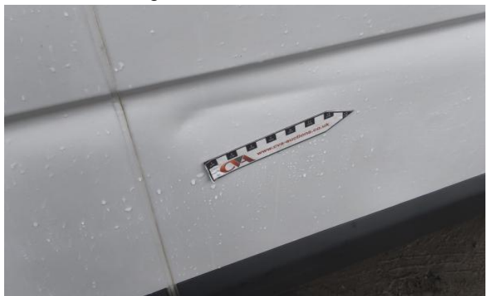
20: Qtr Panel osr Dented With Paint Damage