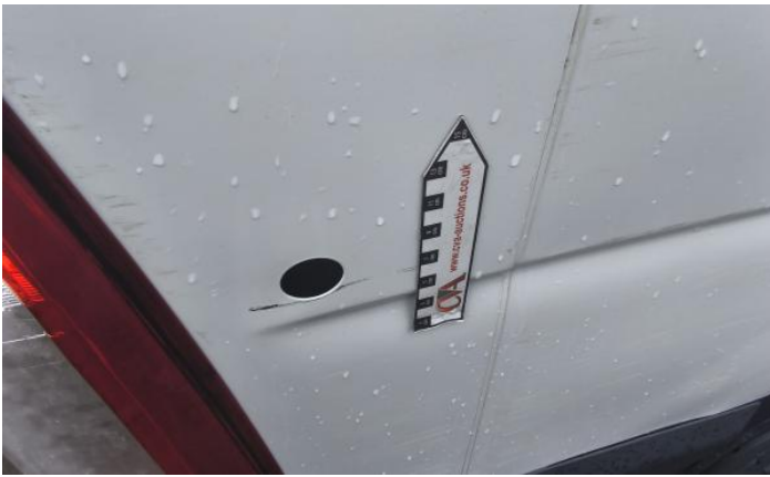
17: Aperture Seal osr Missing Replace