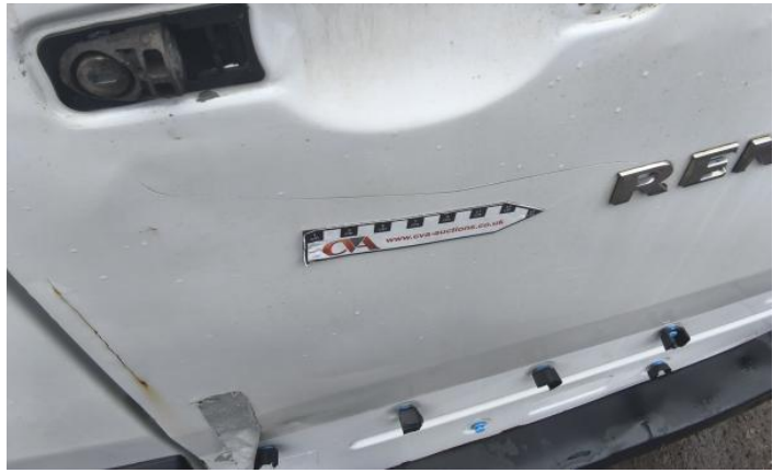
16: Door osr Scratched Over 25mm Thru Paint