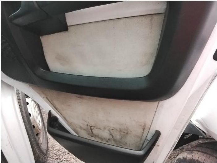
4: Door Pad osf Soiled Heavy