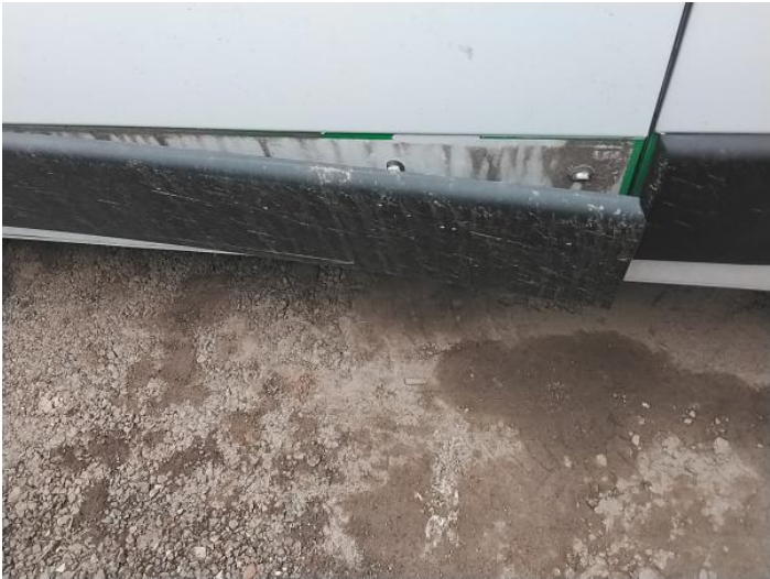
3: Qtr Panel Moulding ns Broken Replace