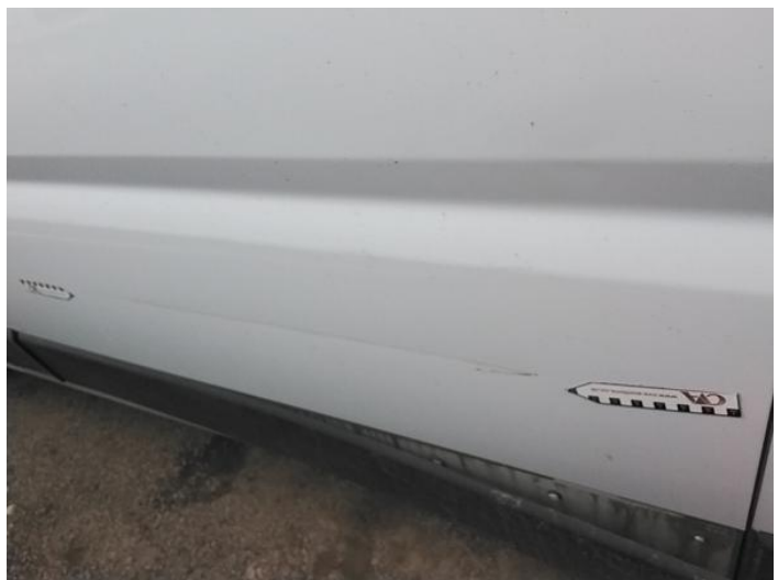
2: Qtr Panel nsr Dented With Paint Damage