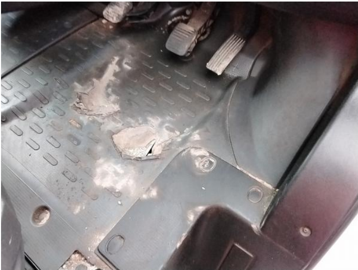
5: Carpets Front Torn Over 10mm