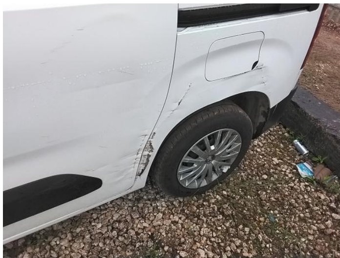
2: Unclassified Substantial Accident Damage Report Only