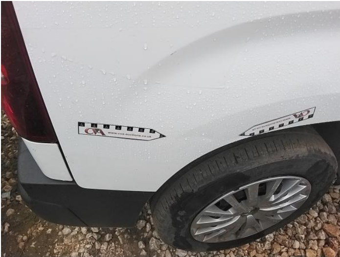
3: Qtr Panel osr Dented Over 30mm