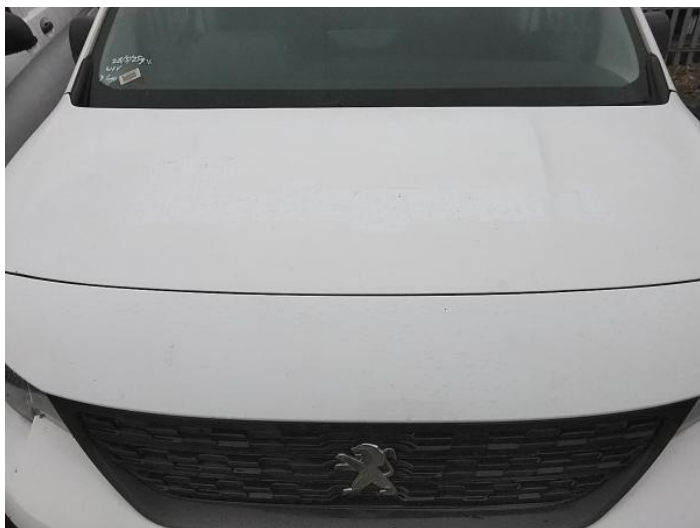
1: Bonnet Chipped Multiple Chips