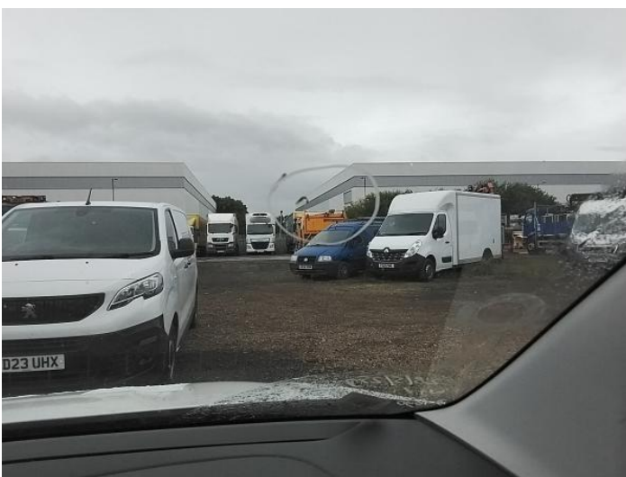
7: Screen Front Chipped Over 10mm