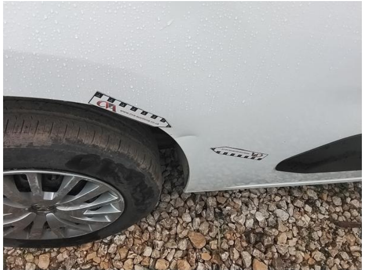
4: Qtr Panel osr Dented Over 30mm