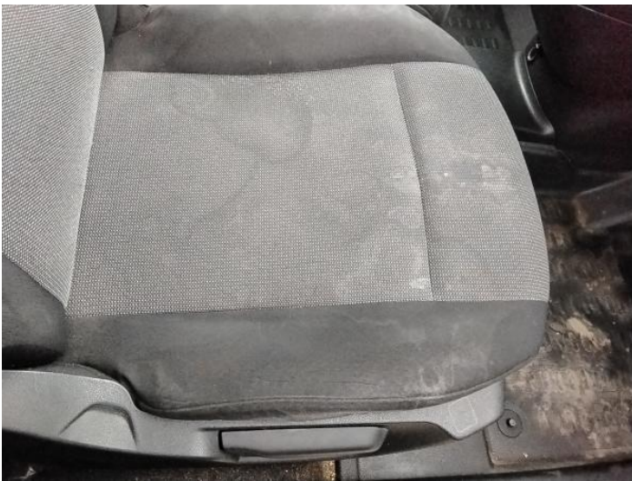
5: Seat Base Cover osf Soiled Heavy