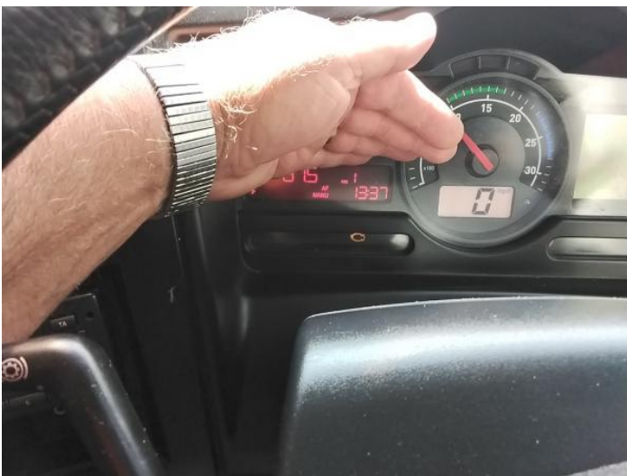
7: Dash Warning Lights Displayed No Action