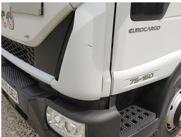
1: Moulding nsf Wing Scratched (Painted) Over 25mm Thru Paint