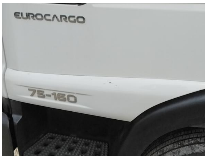
2: Door nsf Scratched Over 25mm Thru Paint