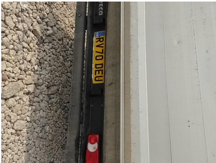
5: Bumper Rear Rusted Over 5mm