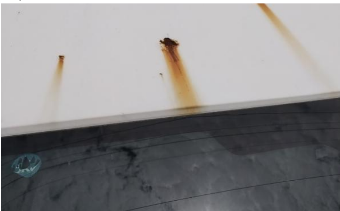
31: Roof Rusted Over 5mm