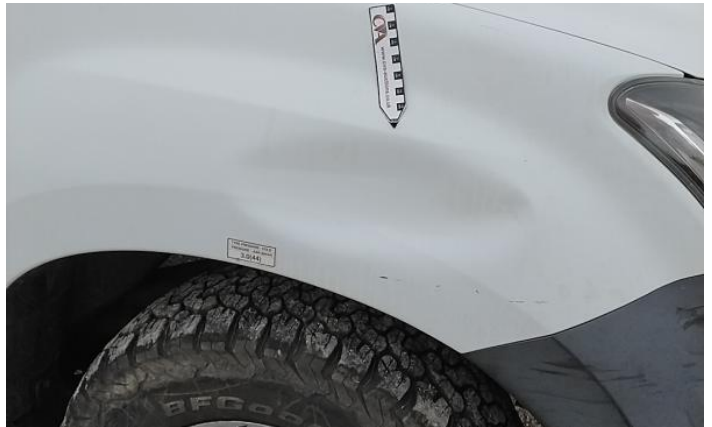
2: Wing of Dented Over 30mm