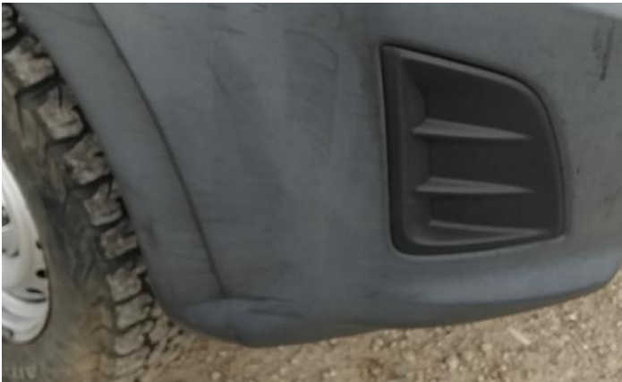
1: Bumper Front Dented Over 30mm