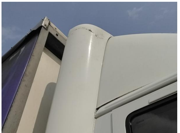
8: General Exterior Soiled Light