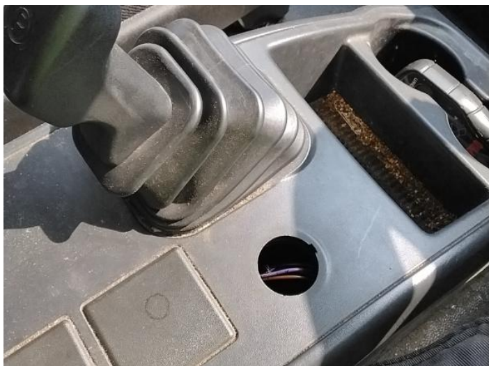
9: Fascia Panel Missing Replace