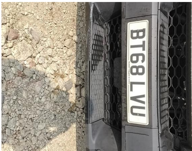
1: Bumper Front Poor Previous Repair Poor Paint