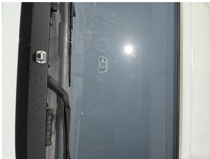
2: Screen Front Chipped UpTo 10mm