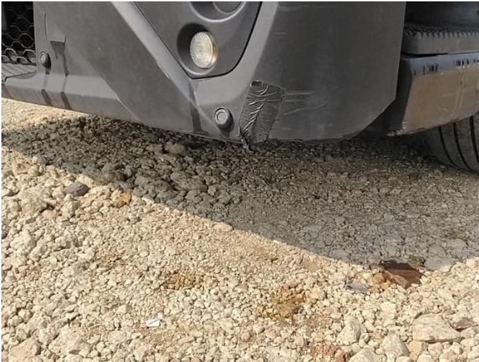
3: Bumper Front Poor Previous Repair Poor Paint