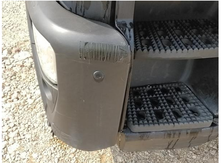
4: Bumper Front Poor Previous Repair Poor Paint