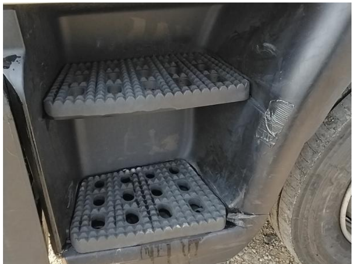
6: General Exterior Soiled Light