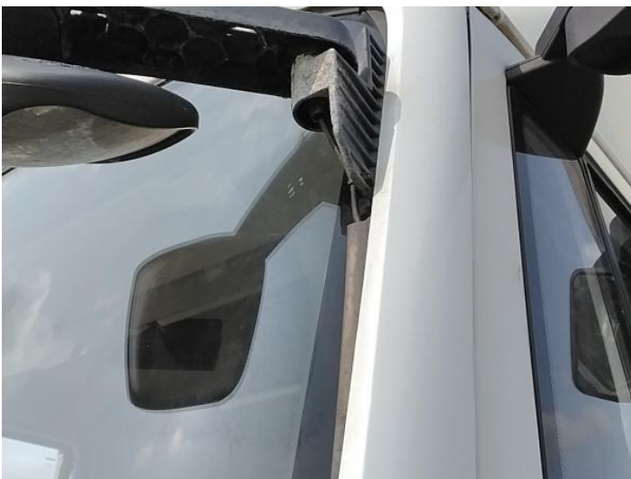
7: Door Mirror Assy nsf Missing Replace