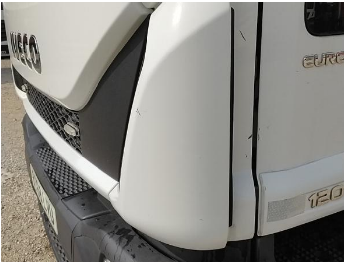
5: Moulding nsf Wing Scratched (Painted) Over 25mm Thru Paint