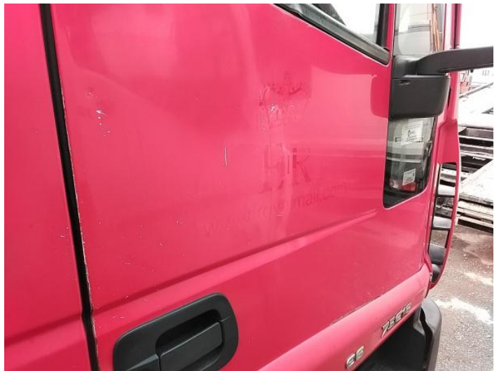
6: Door osf Chipped Multiple Chips