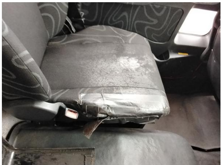
8: Seat Base Cover nsf Torn Over 3mm