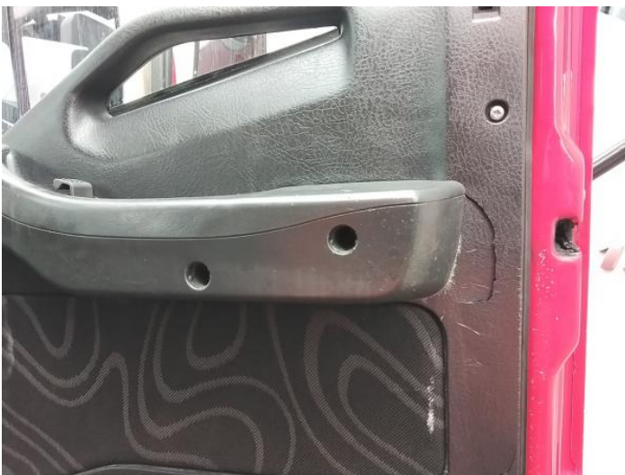
7: Door Pad osf Broken Replace