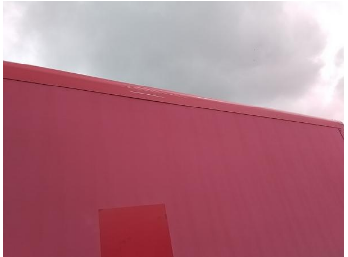
4: Qtr Panel Trim ns Scuffed Over 25mm