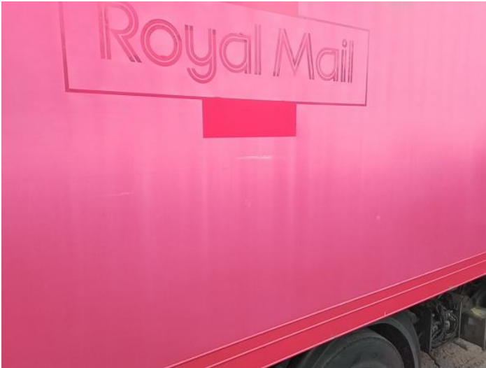
3: Qtr Panel nsr Scratched Over 25mm Thru Paint