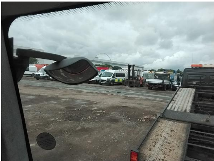
9: Screen Front Chipped Over 10mm