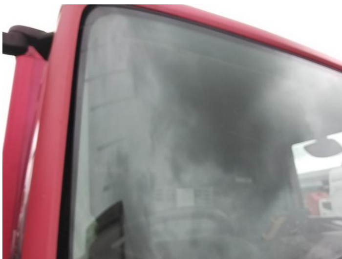
1: Screen Front Scratched Over 30mm