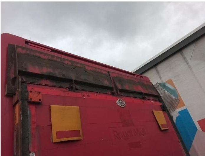
5: Tailgate Rusted Holed