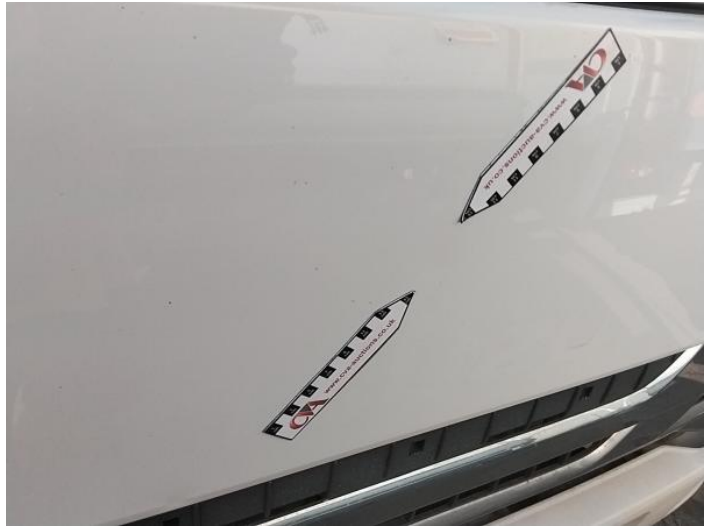
4: Bonnet Dented Over 30mm