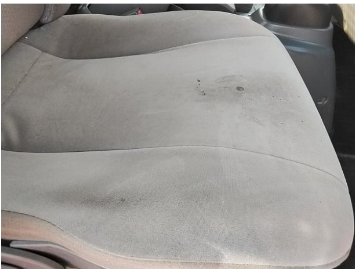
7: Seat Base Cover osf Soiled Heavy