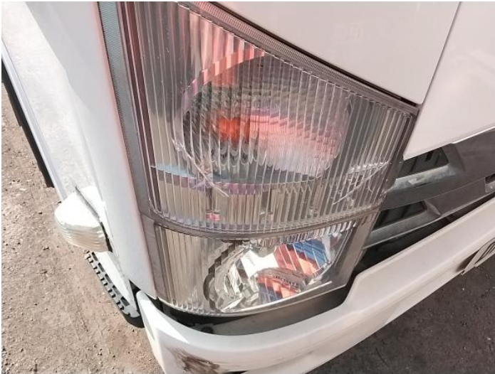
3: Headlamp os Broken Replace