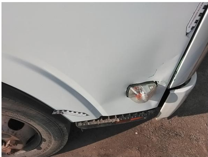
1: Door osf Dented Over 30mm