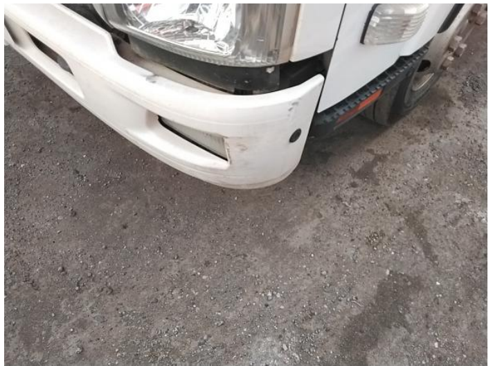
6: Bumper Front Scratched Over 100mm Thru Paint