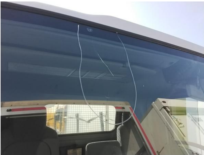
5: Screen Front Cracked Replace