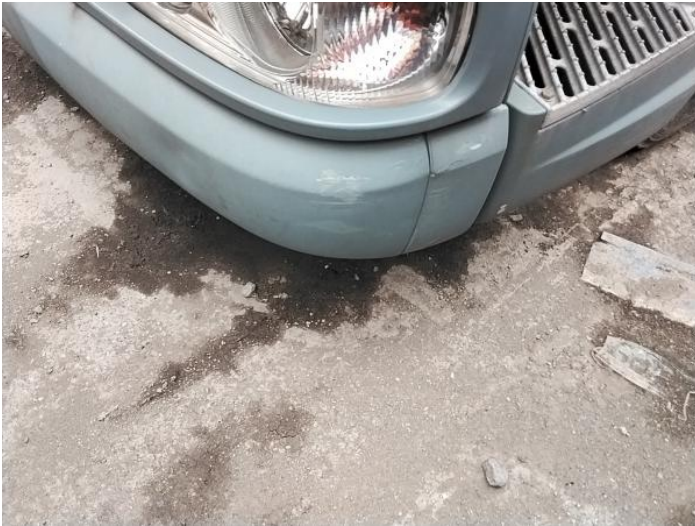
3: Bumper Front Scratched Over 100mm Thru Paint