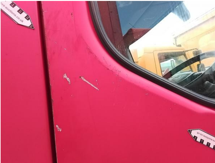
5: Door osf Scratched Over 25mm Thru Paint