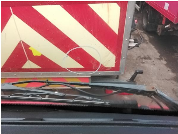
10: Screen Front Chipped Over 10mm