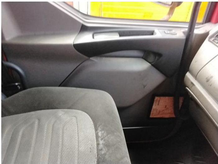
9: Door Pad nsf Soiled Heavy