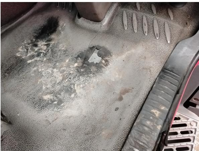
7: Carpets Front Torn Over 10mm