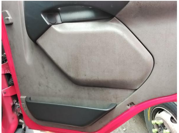
6: Door Pad osf Soiled Heavy