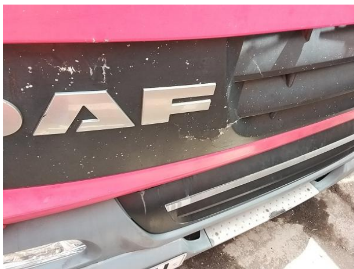
2: Bumper Front Grill Broken Replace