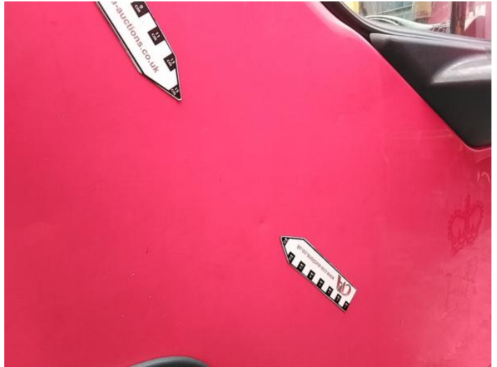
4: Door osf Dented Over 30mm