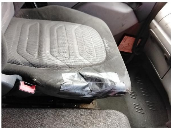
8: Seat Base Cover nsf Holed Over 3mm