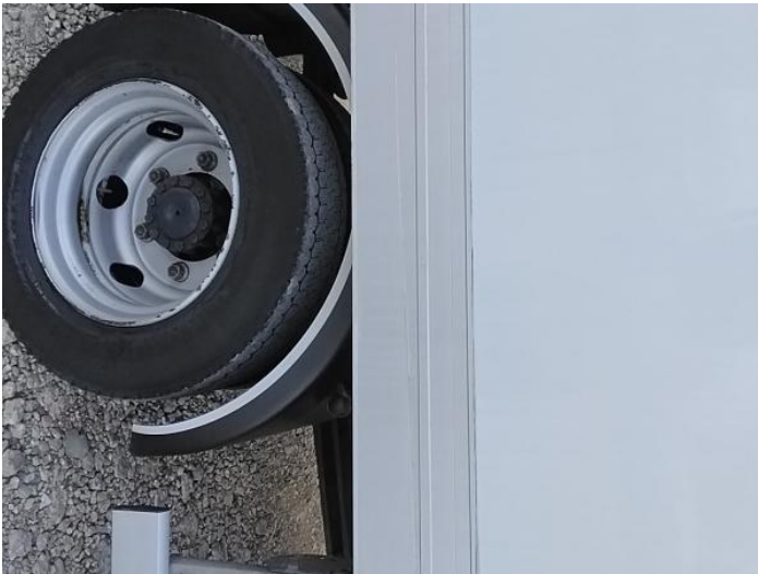
11: General Exterior Soiled Light