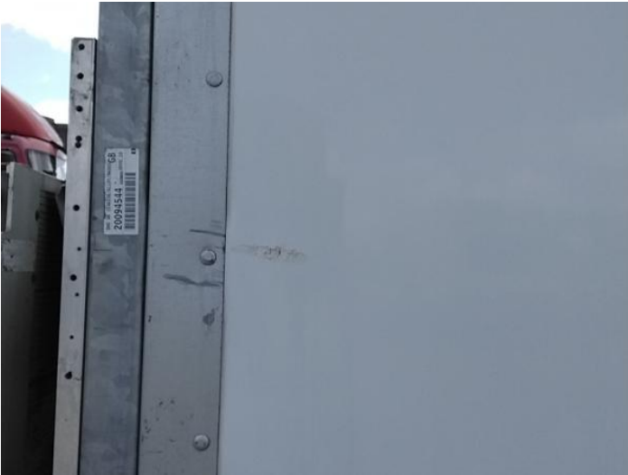
10: Qtr Panel osr Scratched Over 25mm Thru Paint