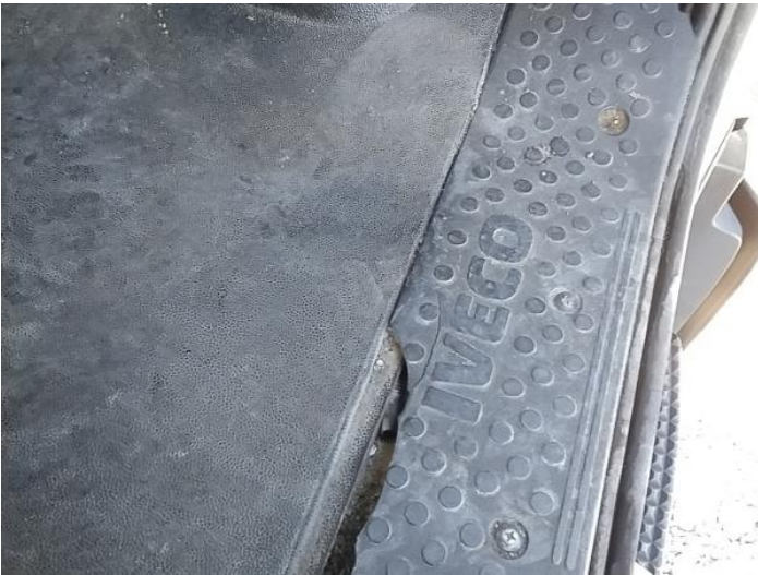
12: Carpets Front Holed Over 3mm