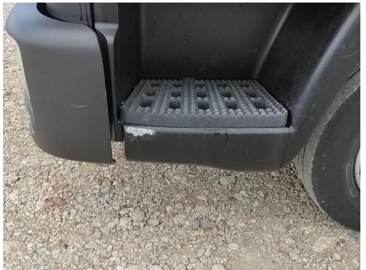
6: General Exterior Soiled Light