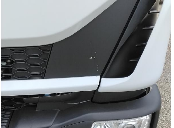
4: Bonnet Chipped Multiple Chips