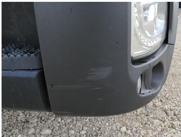
2: Bumper Front Scratched Over 25mm Not Thru Paint