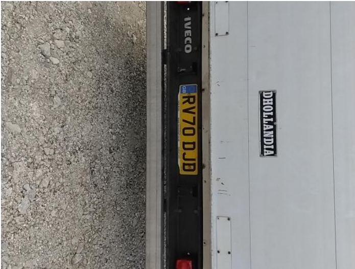
9: Bumper Rear Rusted Over 5mm