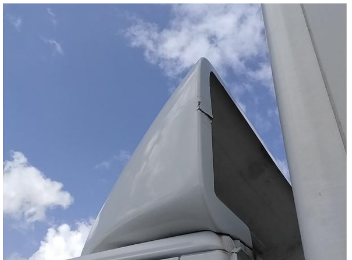
8: General Exterior Soiled Light