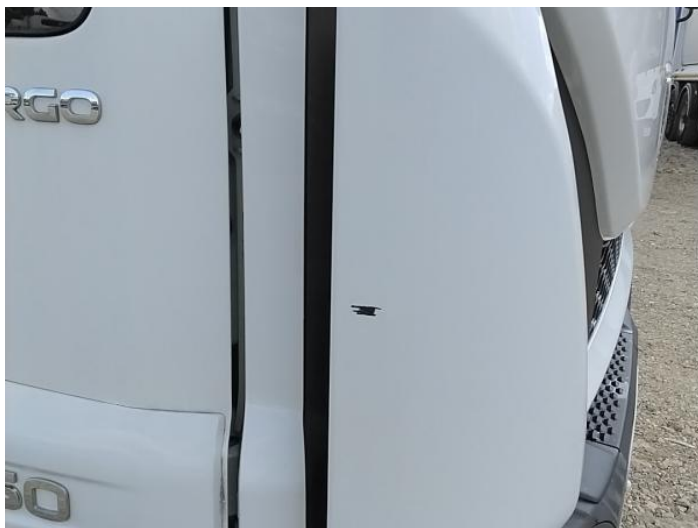
1: Wing osf Scratched Over 25mm Thru Paint