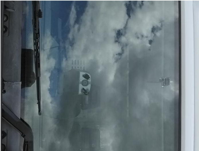
3: Screen Front Chipped UpTo 10mm