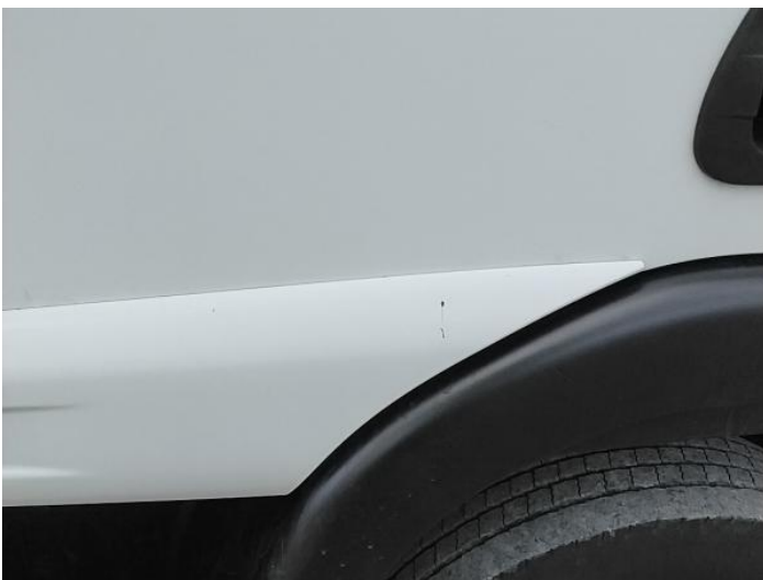
7: Door Moulding nsf Scratched (Painted) Over 25mm Thru Paint