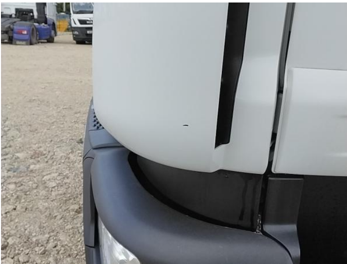
5: Wing nsf Scratched UpTo 25mm Thru Paint