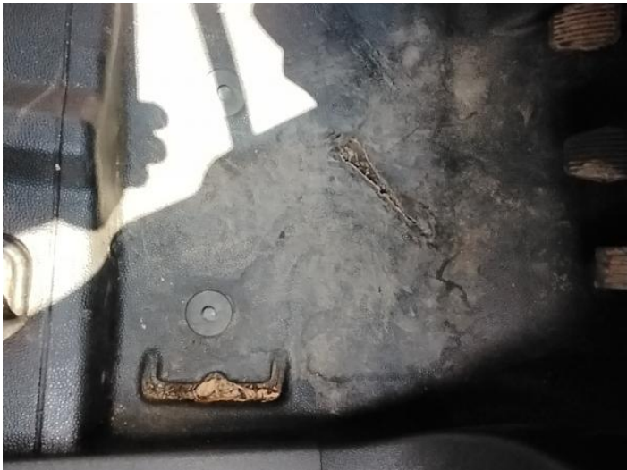
2: Carpets Front Torn Over 10mm