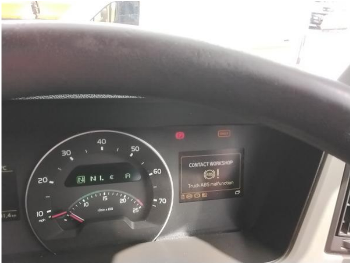
4: Dash Warning Lights Displayed No Action