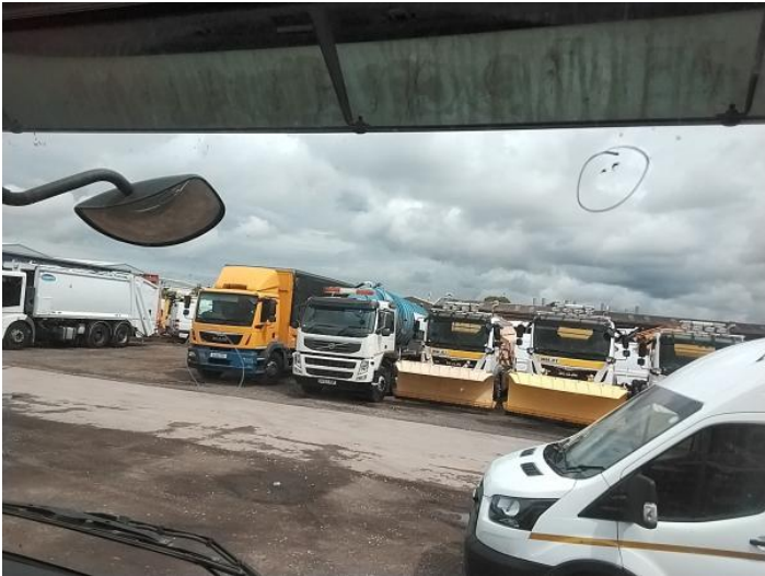
3: Screen Front Chipped Over 10mm