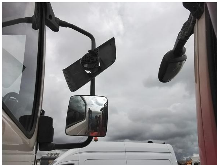
2: Door Mirror Assy osf Broken Replace