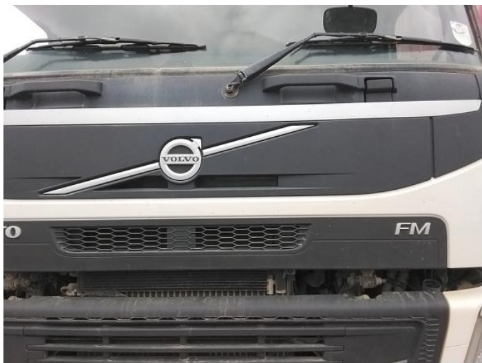
1: Bonnet Chipped Multiple Chips