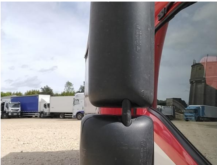
1: Door Mirror Assy of Scuffed (Unpainted) Over 100mm