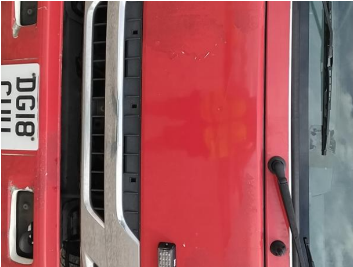
3: Bonnet Scratched Over 25mm Thru Paint