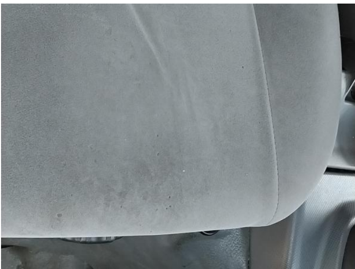
7: Seat Base Cover osf Burn Over 3mm