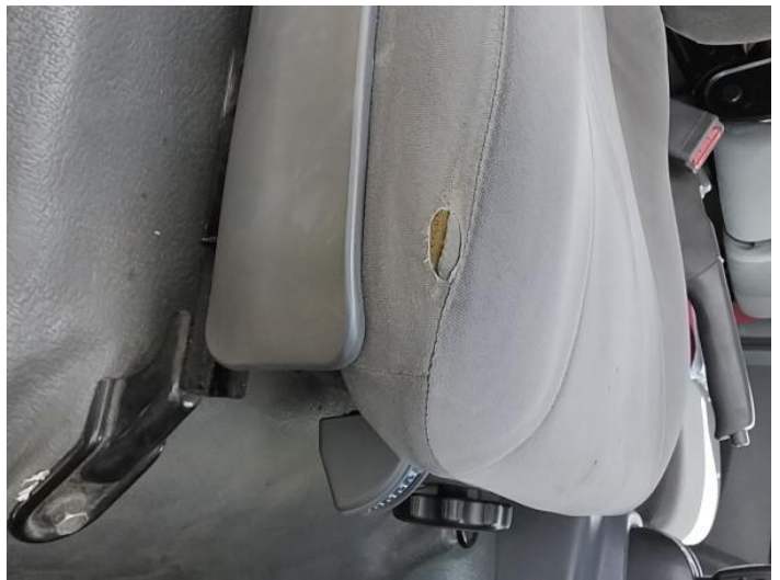
6: Seat Base Cover osf Holed Over 3mm