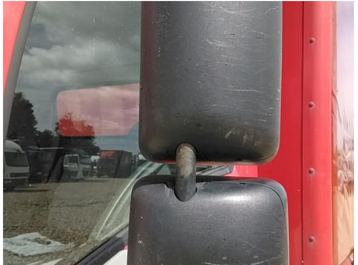
4: Door Mirror Assy nsf Scuffed (Unpainted) Over 100mm