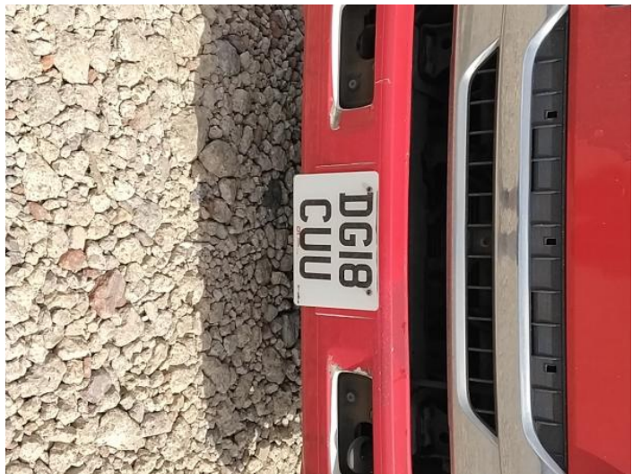
2: Bumper Front Scratched Over 100mm Thru Paint