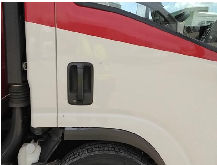
5: Door osf Scratched Over 25mm Thru Paint