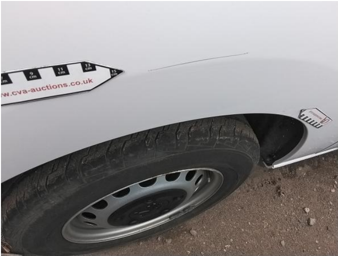
3: Qtr Panel osr Scratched Over 25mm Thru Paint