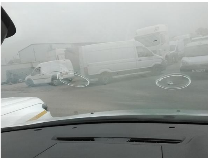
7: Screen Front Chipped Over 10mm