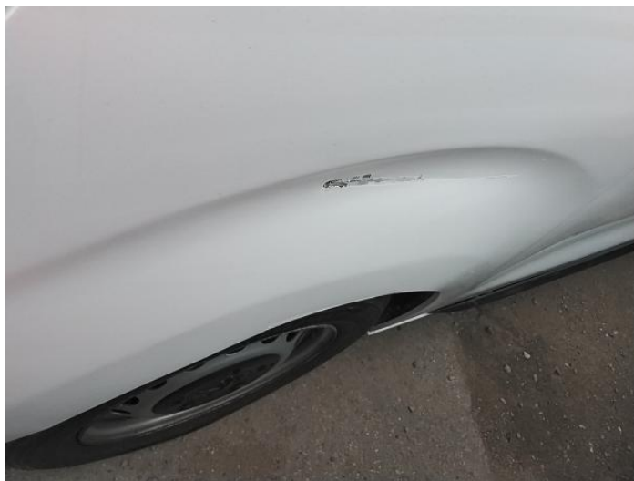
2: Wing nsf Dented With Paint Damage