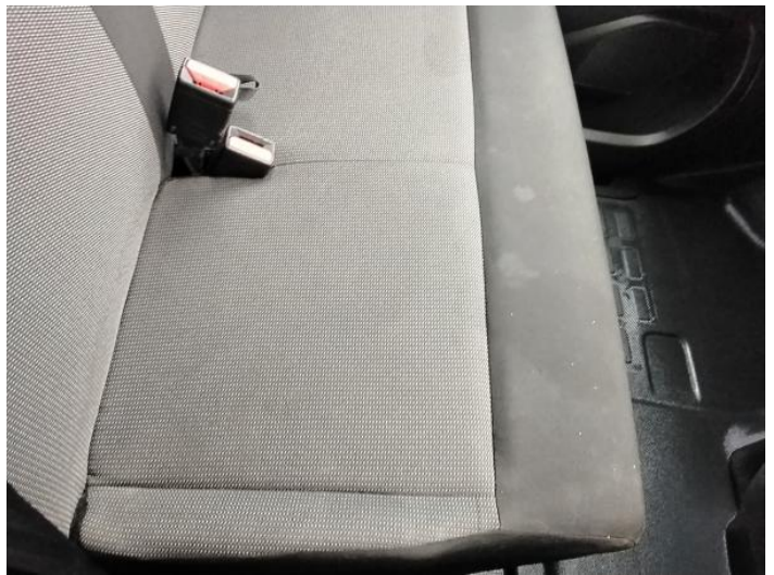
6: Seat Base Cover nsf Soiled Heavy