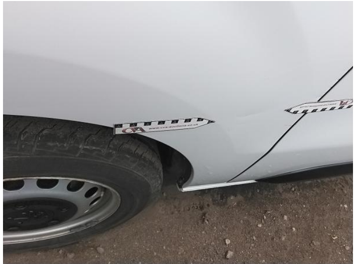
4: Qtr Panel osr Dented Over 30mm