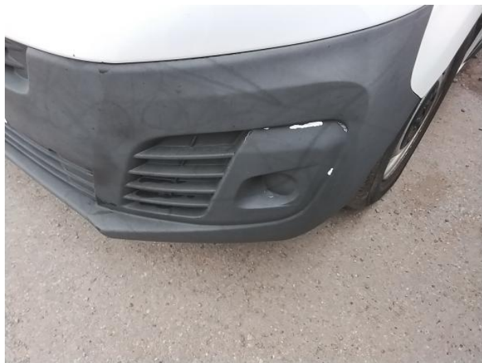
1: Bumper Front Scratched 25 to 100mm Thru Paint