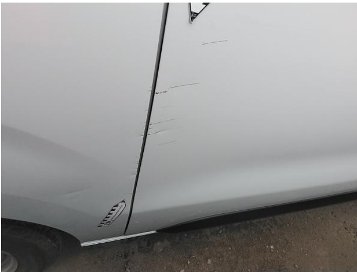
5: Qtr Panel osr Dented With Paint Damage