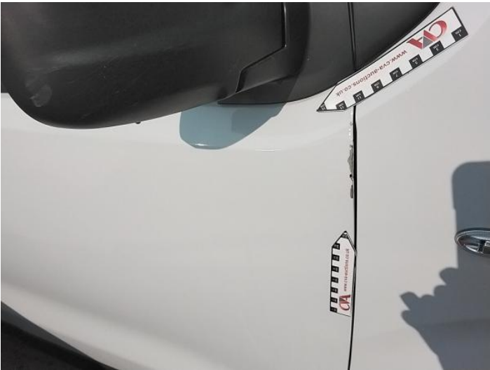
6: Door osf Dented With Paint Damage