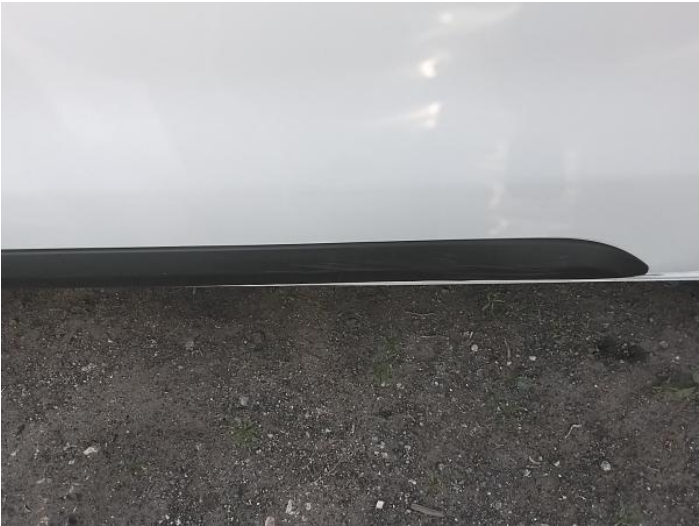
4: Qtr Panel Moulding ns Scuffed (Unpainted) Over 100mm