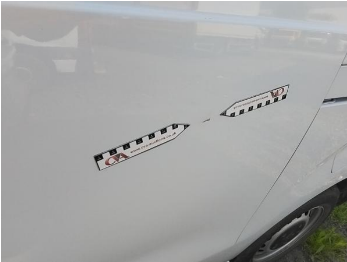
3: Qtr Panel nsr Dented With Paint Damage