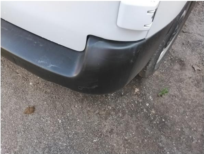
5: Bumper Rear Scratched Over 100mm Thru Paint