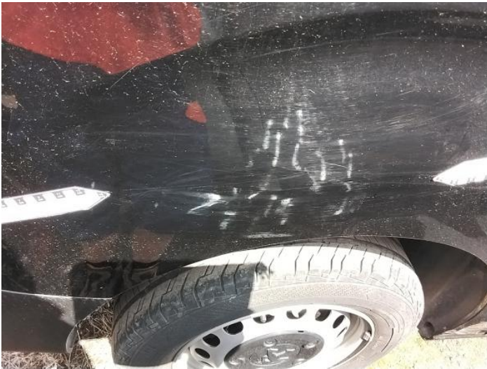
5: Qtr Panel osr Scratched Over 25mm Thru Paint