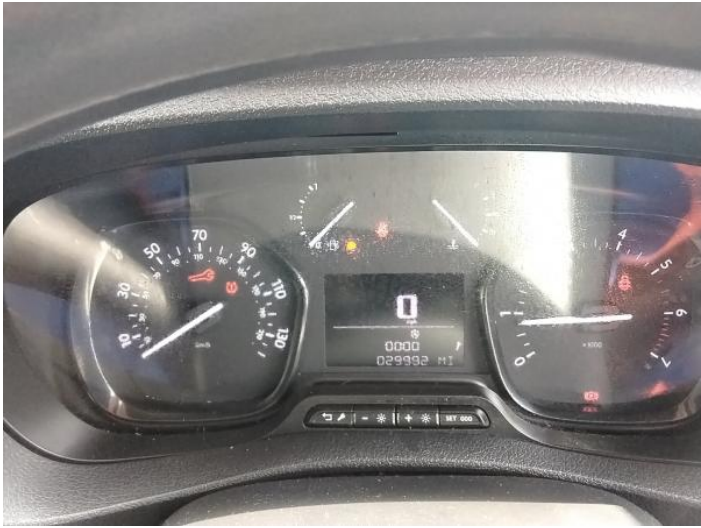
10: Dash Warning Lights Displayed No Action