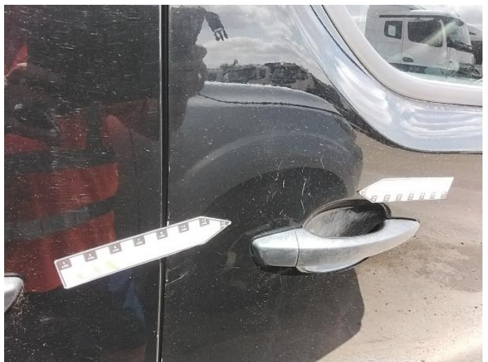
8: Door osf Scratched Over 25mm Thru Paint