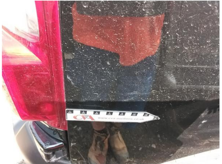
4: Qtr Panel osr Scratched Over 25mm Thru Paint