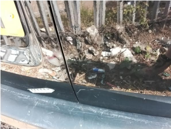
3: Door osr Scratched Over 25mm Thru Paint