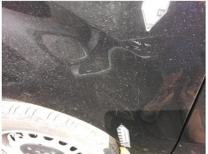
6: Qtr Panel osr Scratched Over 25mm Thru Paint