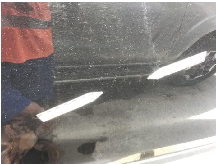
7: Qtr Panel osr Scratched Over 25mm Thru Paint