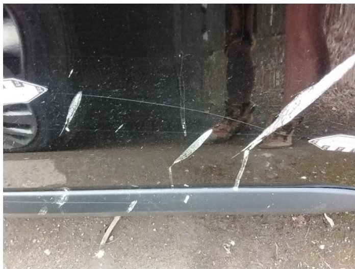
2: Qtr Panel nsr Scratched Over 25mm Thru Paint