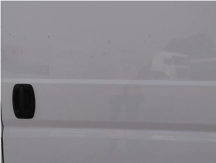
9: Door nsr Chipped Multiple Chips