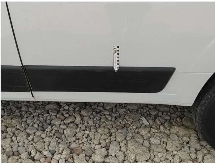
11: Qtr Panel Trim ns Scuffed Over 25mm