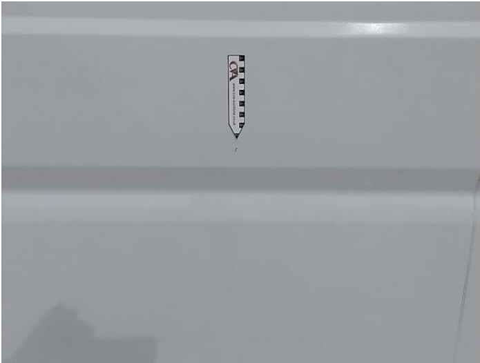
15: General Exterior Soiled Light