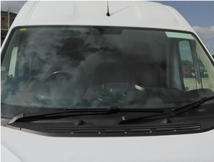
3: Screen Front Chipped UpTo 10mm