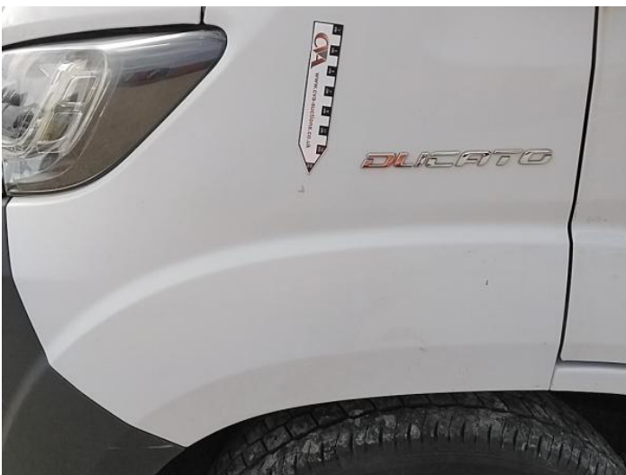
7: Wing nsf Chipped 1 To 5