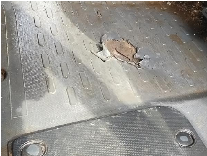
16: Carpets Front Holed Over 3mm