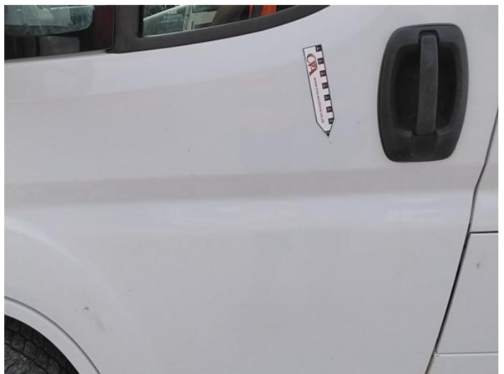
8: Door nsf Chipped Multiple Chips