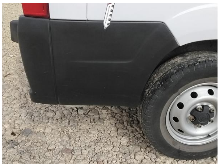
14: Qtr Panel Moulding os Scuffed (Unpainted) Over 100mm