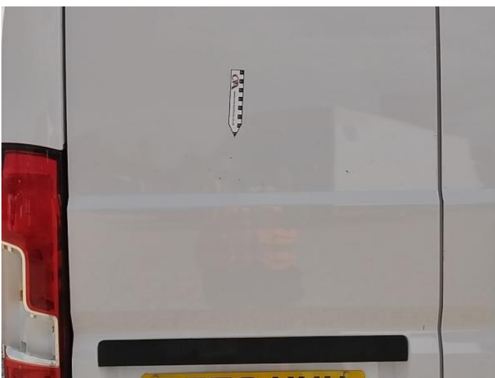
13: Door nsr Chipped Multiple Chips