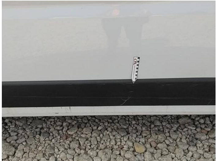
10: Door Moulding nsr Scuffed (Unpainted) Over 100mm