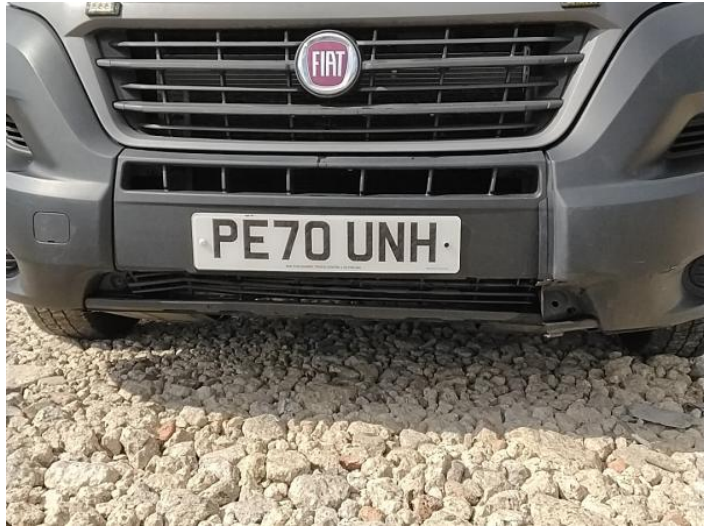
4: Bumper Front Cracked Over 25mm