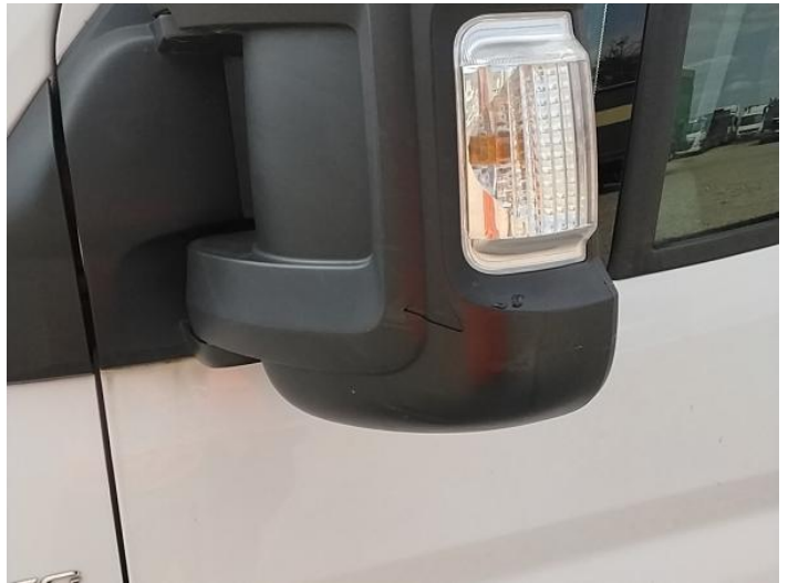
6: Door Mirror Assy nsf Broken Replace