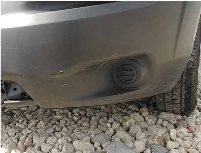
5: Bumper Front Scratched Over 25mm Not Thru Paint