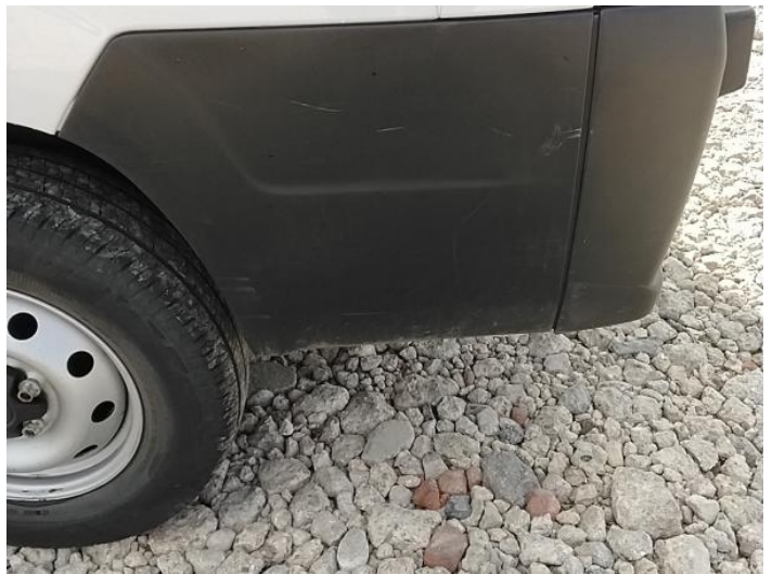
12: Qtr Panel Trim ns Scuffed Over 25mm