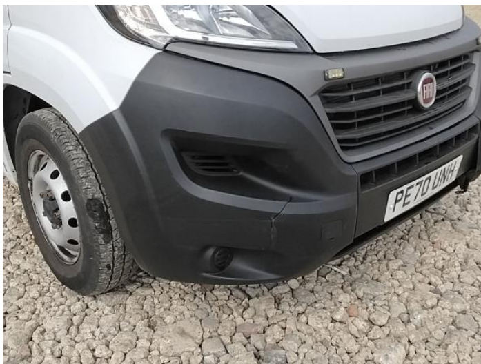
1: Bumper Front Cracked Over 25mm