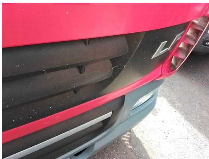
2: Bumper Front Grill Broken Replace