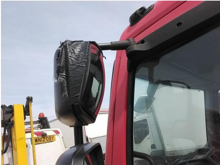
4: Door Mirror Assy nsf Broken Replace