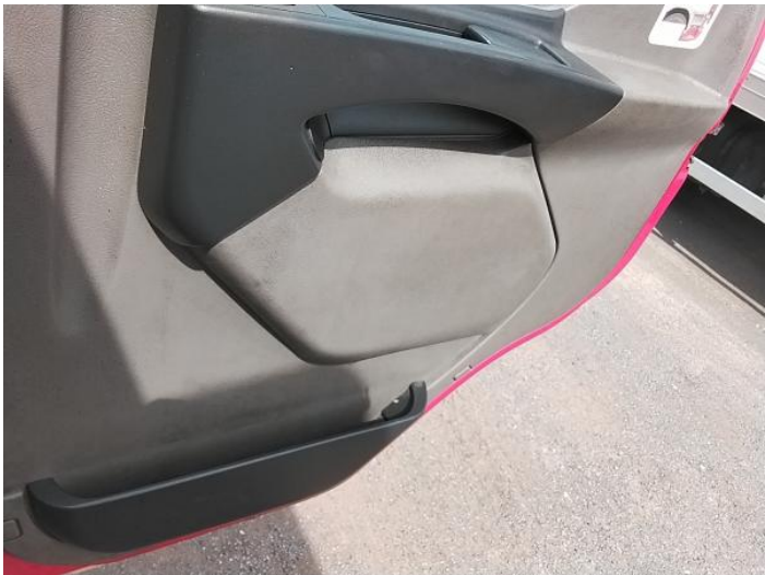
8: Door Pad osf Soiled Heavy