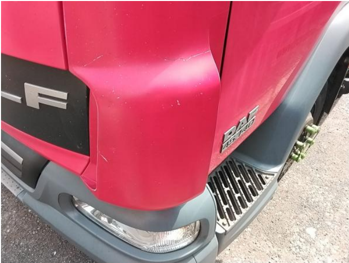
3: Panel Front Cracked Replace