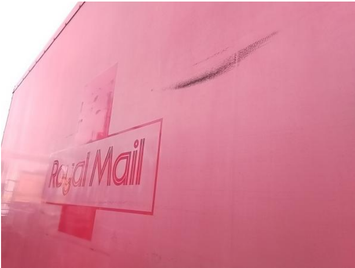
5: Qtr Panel nsr Scratched Over 25mm Not Thru Paint