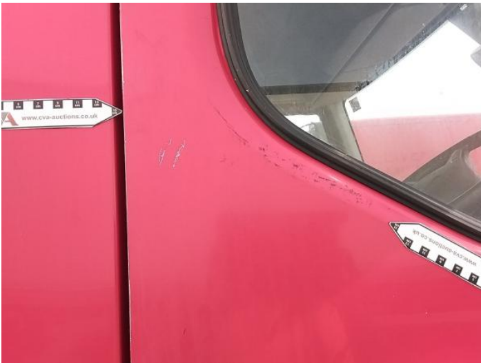
7: Door osf Scratched Over 25mm Thru Paint