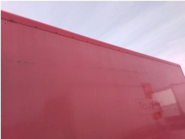
6: Qtr Panel osr Scratched Over 25mm Thru Paint