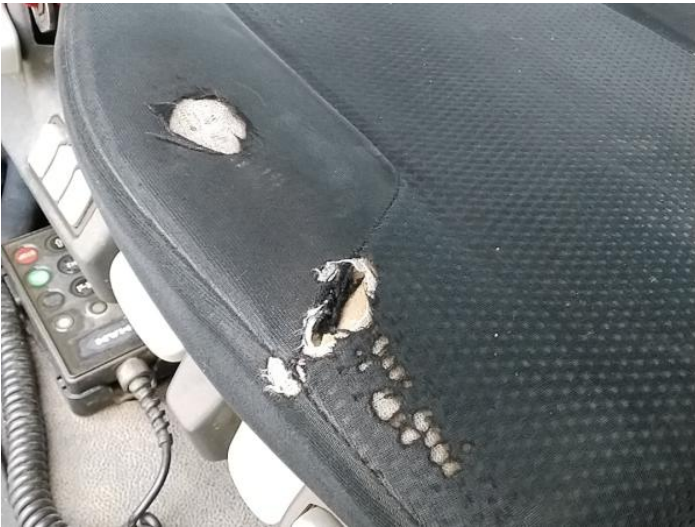
12: Seat Base Cover osf Holed Over 3mm