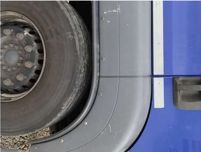
10: General Exterior Soiled Light