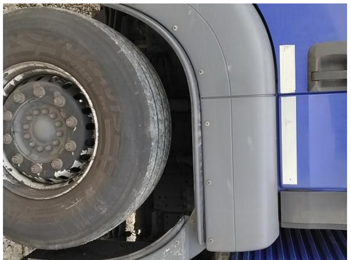
8: General Exterior Soiled Light