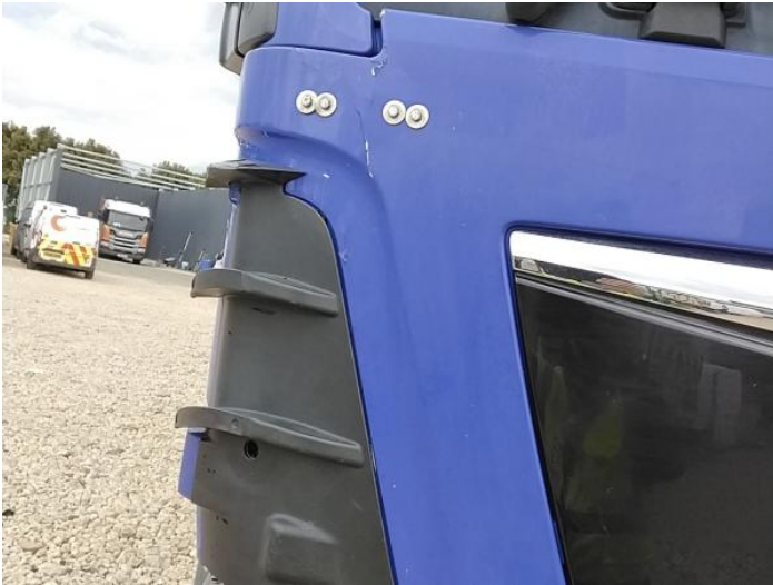
3: Bonnet Poor Previous Repair Poor Colour