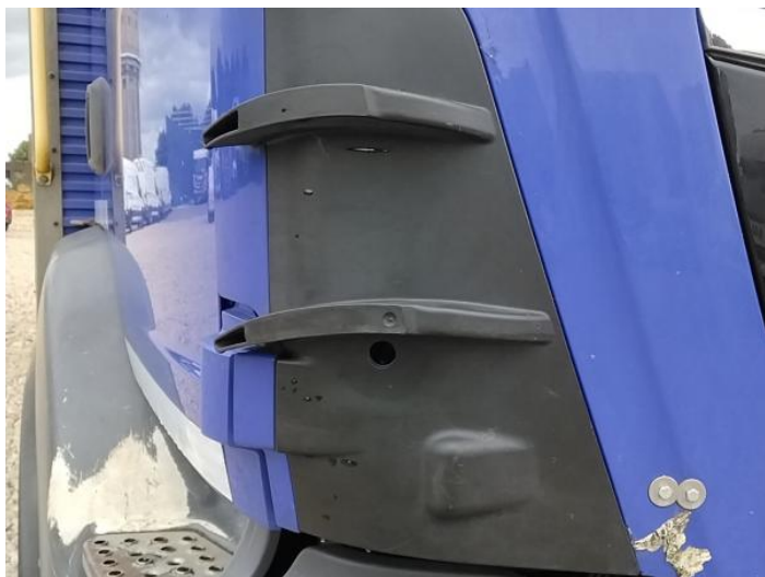
1: Moulding of Wing Missing Replace