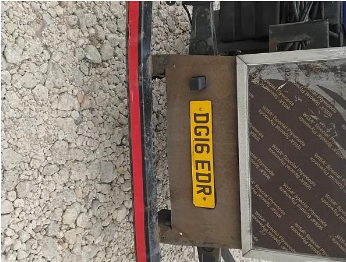
9: Bumper Rear Rusted Over 5mm