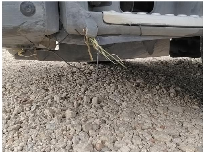
6: General Exterior Soiled Light