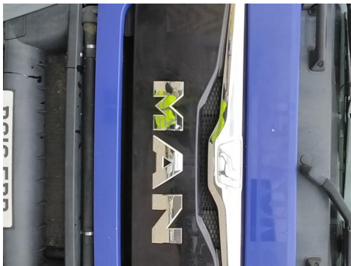
2: Bonnet Poor Previous Repair Poor Colour