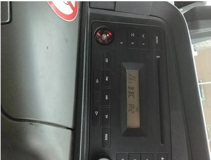
13: In Car Entertainment Broken Replace