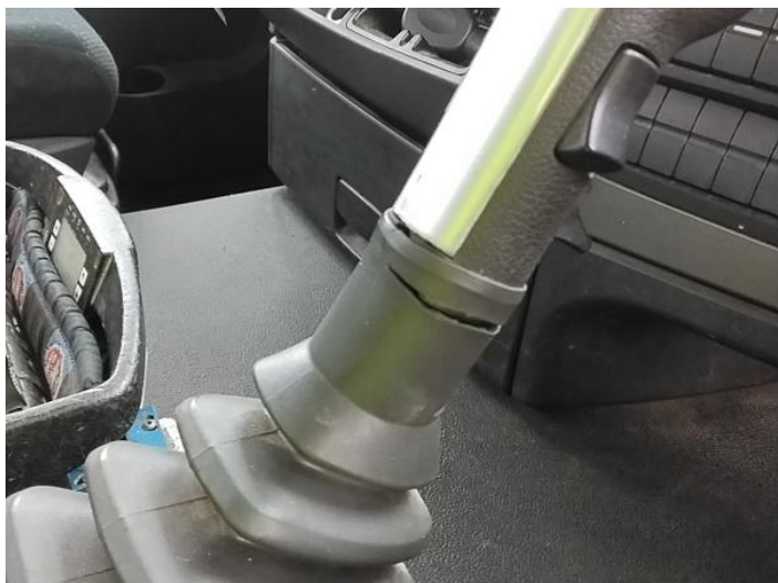
15: General Interior Soiled Light