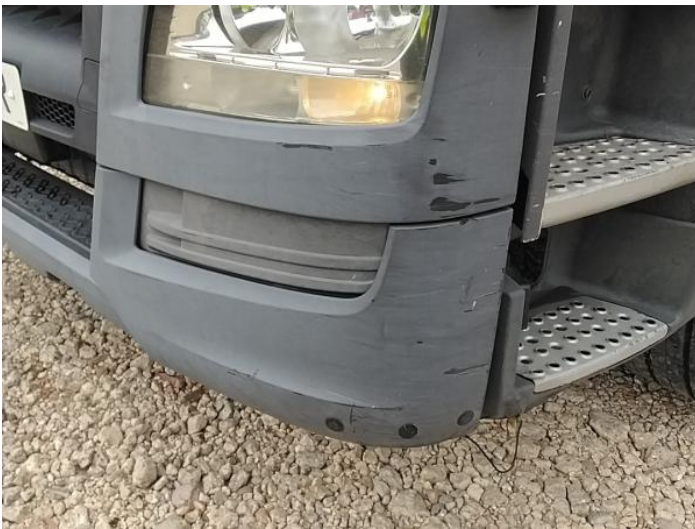
5: Bumper Front Scratched Over 25mm Not Thru Paint