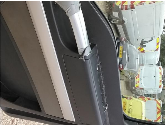
14: Handle Inner osf Damaged Replace