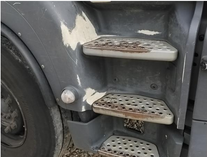
11: General Exterior Soiled Light