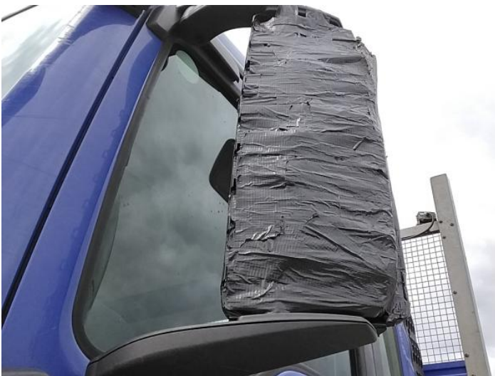
7: Door Mirror Assy nsf Missing Replace