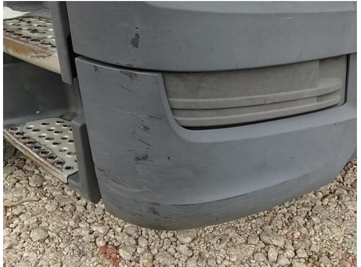
4: Bumper Front Scratched Over 25mm Not Thru Paint