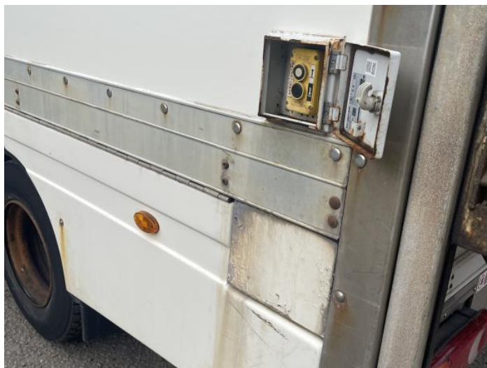
10: Qtr Panel nsr Rusted Over 5mm