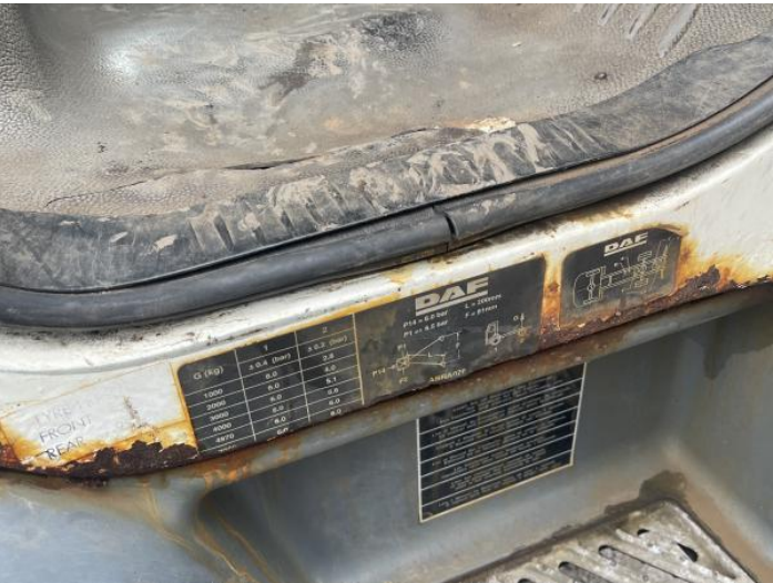
1: Sill os Rusted Over 5mm