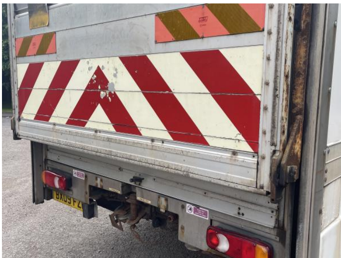
9: Tailgate Rusted Over 5mm