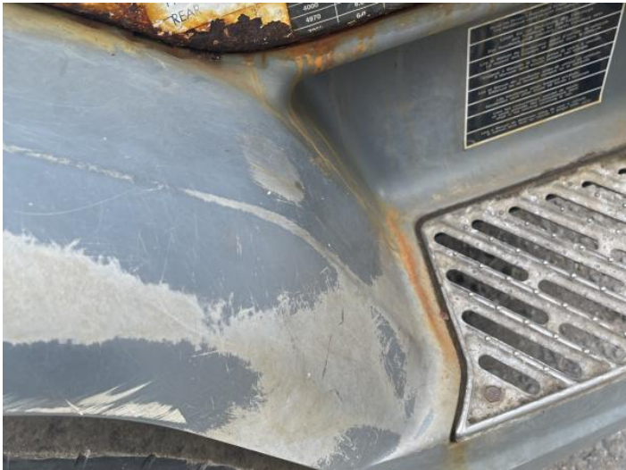
2: Door Moulding osf Scuffed (Unpainted) Over 100mm