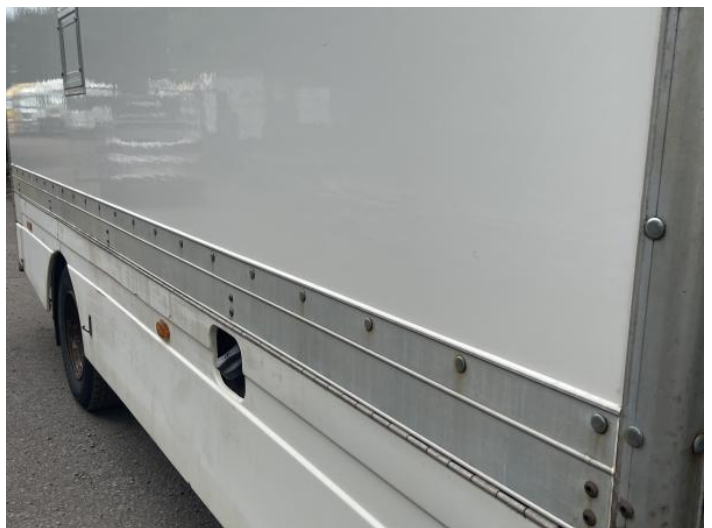
8: Qtr Panel osr Rusted Over 5mm