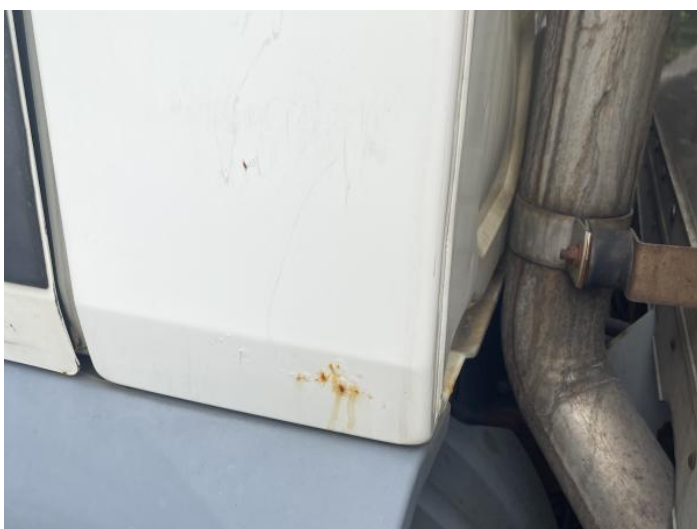
11: B Post ns Rusted Over 5mm