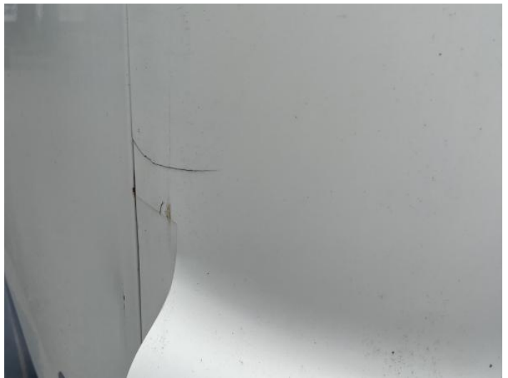
6: Wing osf Cracked Replace