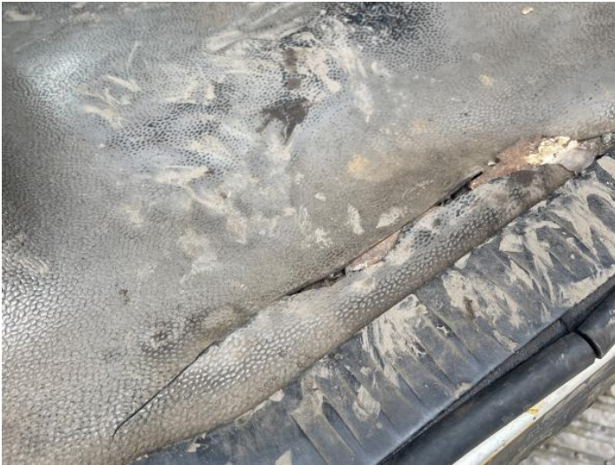
3: Carpets Front Torn Over 10mm