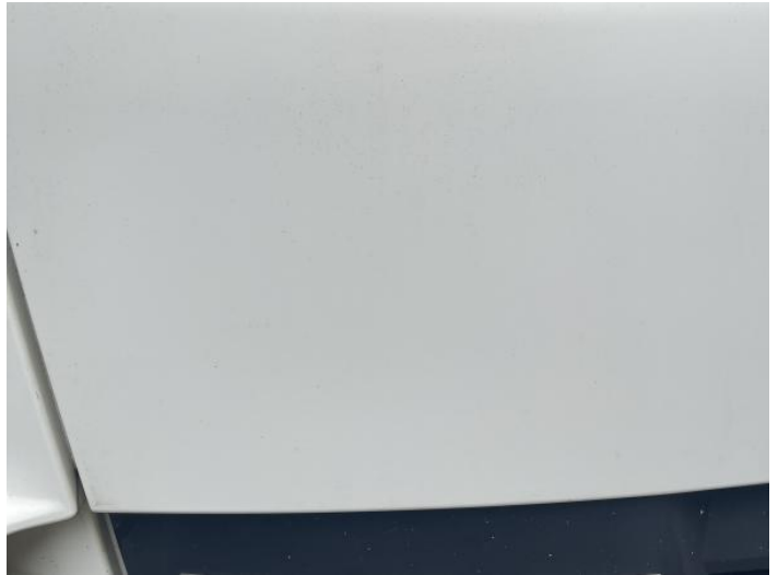
4: Bonnet Chipped 1 To 5