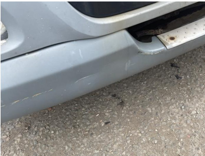
5: Bumper Front Dented With Paint Damage