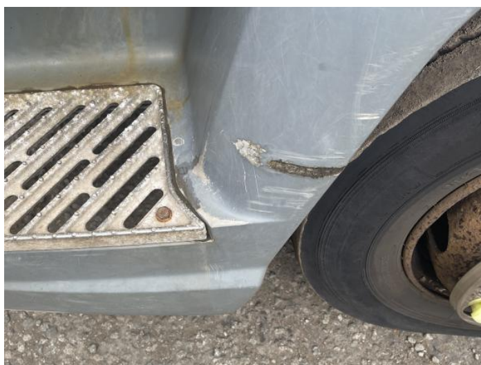
12: Door Moulding nsf Scuffed (Unpainted) Over 100mm