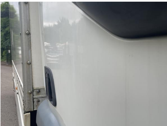
7: Door osf Dented Over 30mm