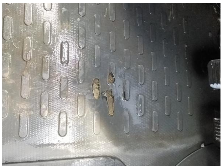
8: Carpets Front Holed Over 3mm