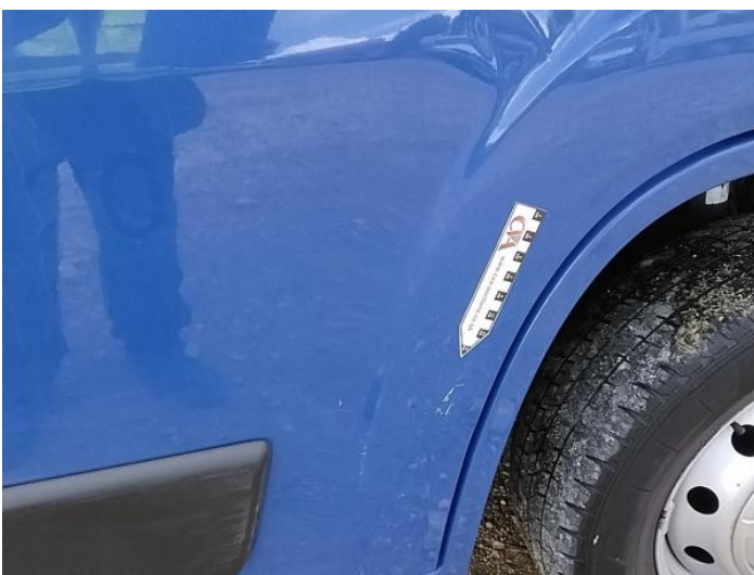
7: Door osf Scratched Over 25mm Thru Paint