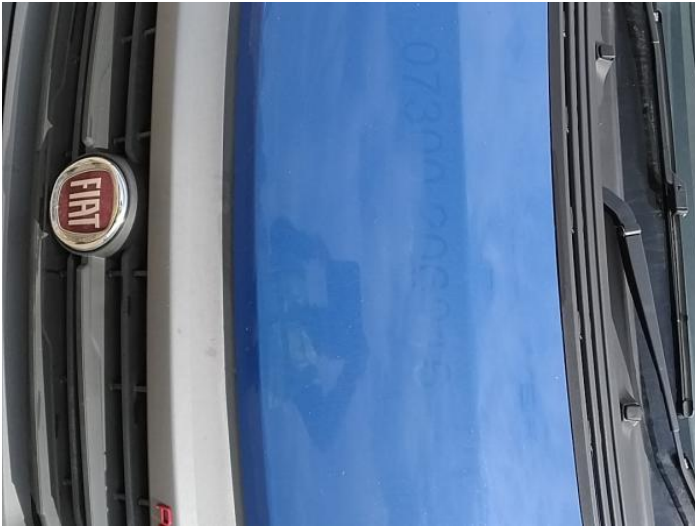
3: Bonnet Chipped Multiple Chips