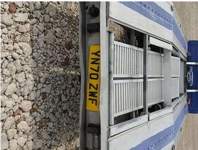
5: Bumper Rear Dented Over 30mm