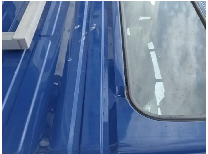
6: General Exterior Soiled Light