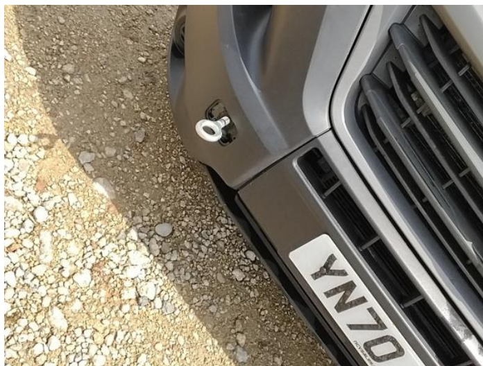
2: Front TowEye Cvr Missing Replace