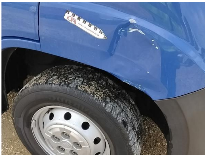
1: Wing osf Dented With Paint Damage