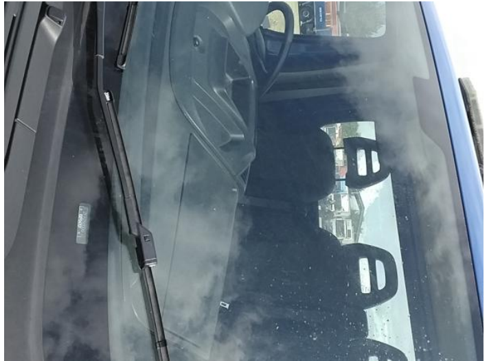
4: Screen Front Chipped Over 10mm