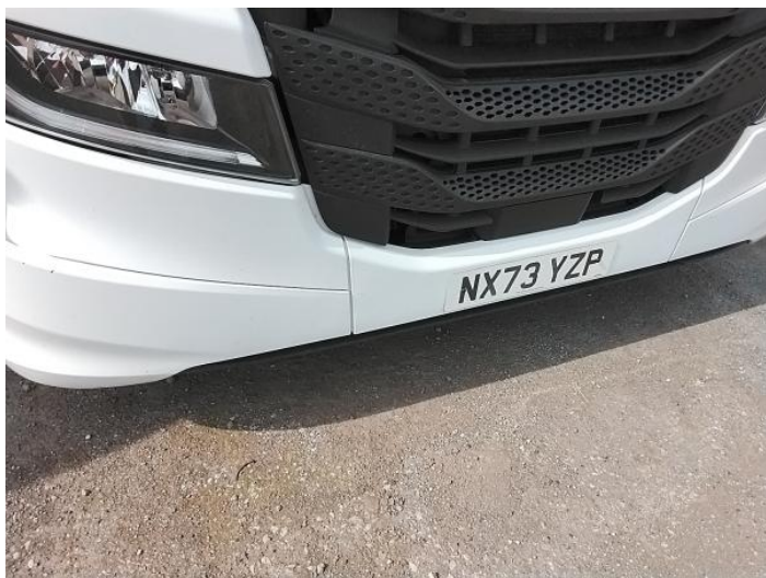
1: Bumper Front Chipped Multiple Chips