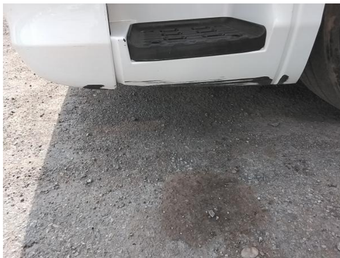
2: Bumper Front Moulding Scratched (Painted) Over 25mm Thru Paint