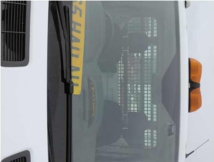
3: Screen Front Chipped Over 10mm