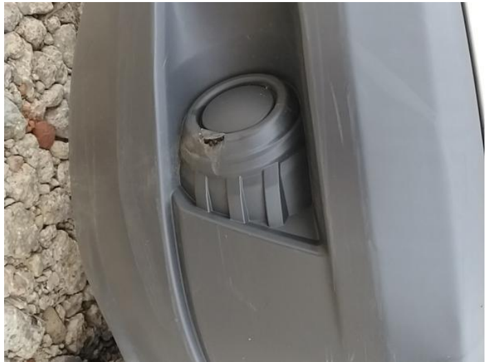
6: Fog Lamp Surrounds Broken Replace