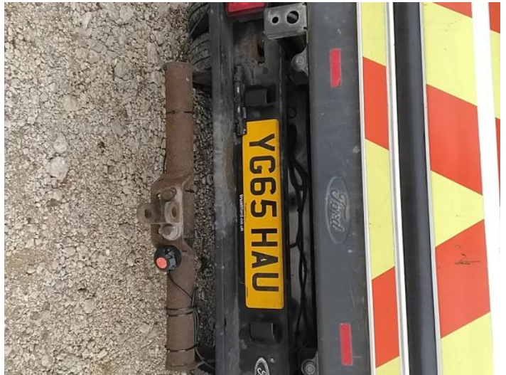
12: Bumper Rear Rusted Over 5mm