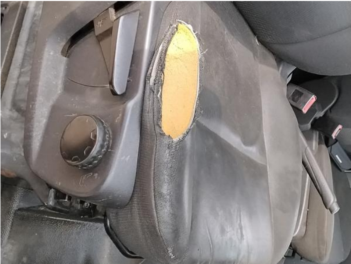
16: Seat Base Cover osf Torn Over 3mm