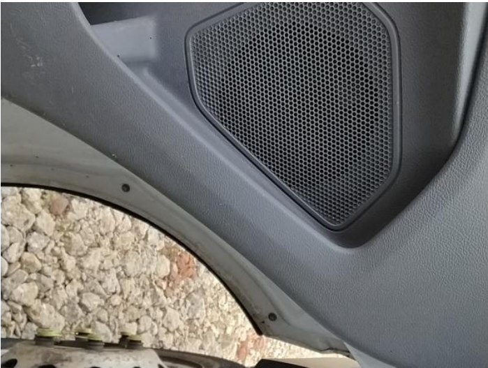
18: Other N/A N/A