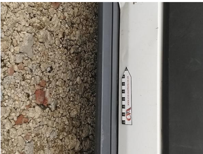
13: Door osf Dented With Paint Damage