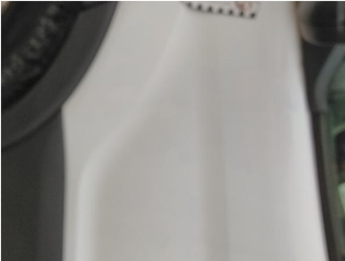
9: Door nsf Dented With Paint Damage