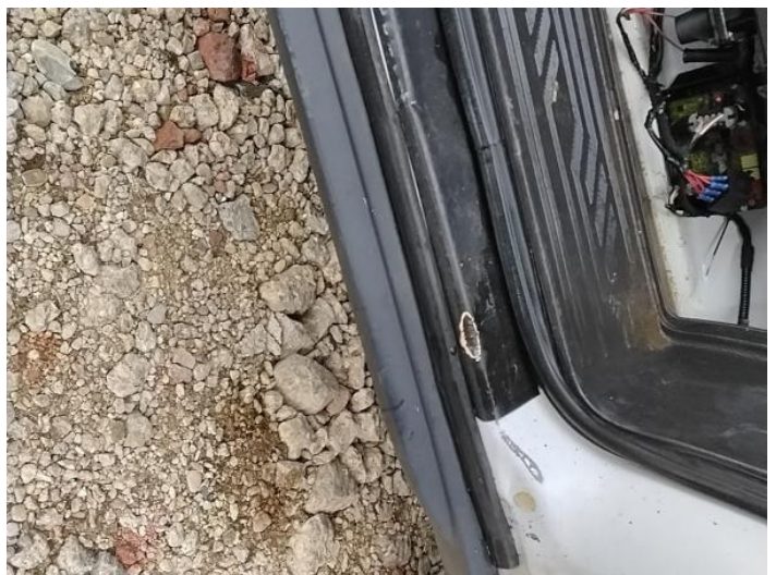
14: Sill os Rusted Over 5mm