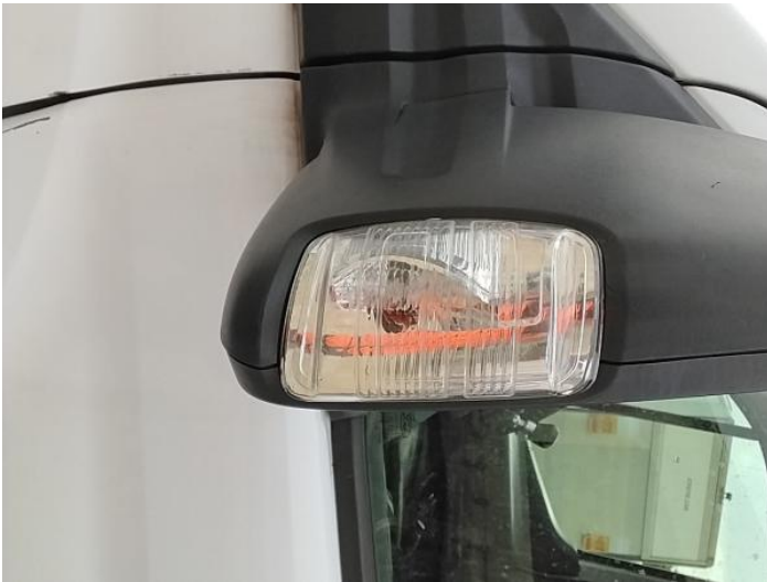
11: Door Mirror Assy nsf Scuffed (Unpainted) Over 100mm