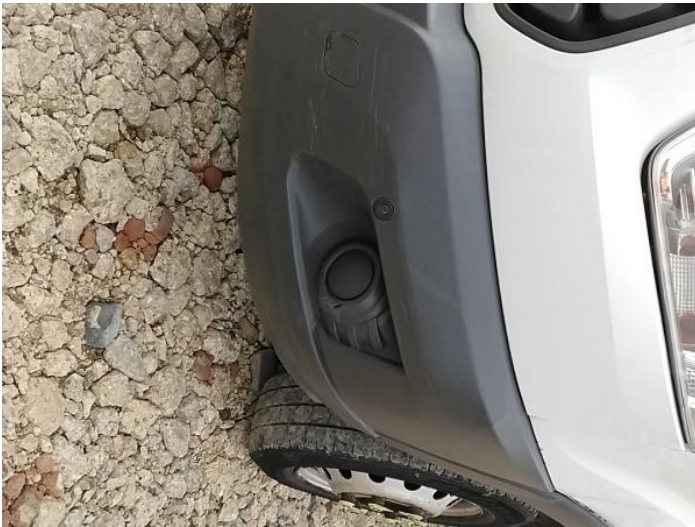
5: Bumper Front Scratched Over 25mm Not Thru Paint