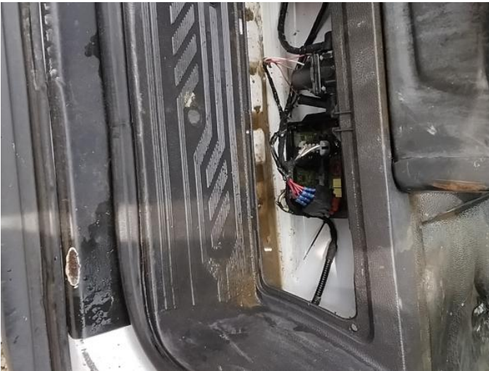
17: Other N/A N/A