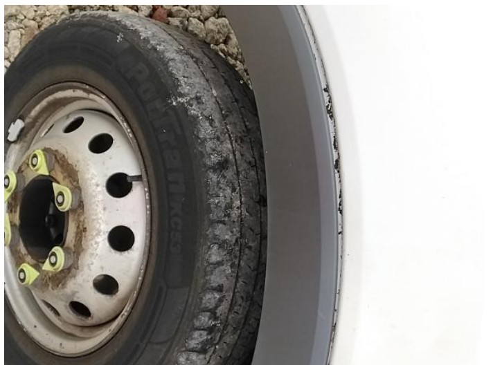
8: Moulding nsf Wing Broken Replace