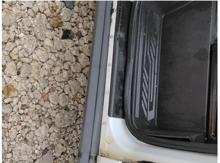
10: General Exterior Soiled Light