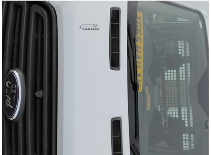
4: Bonnet Chipped Multiple Chips