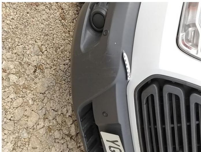
2: Bumper Front Scratched Over 25mm Not Thru Paint