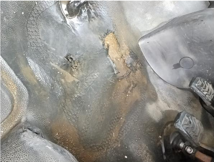
15: Carpets Front Holed Over 3mm