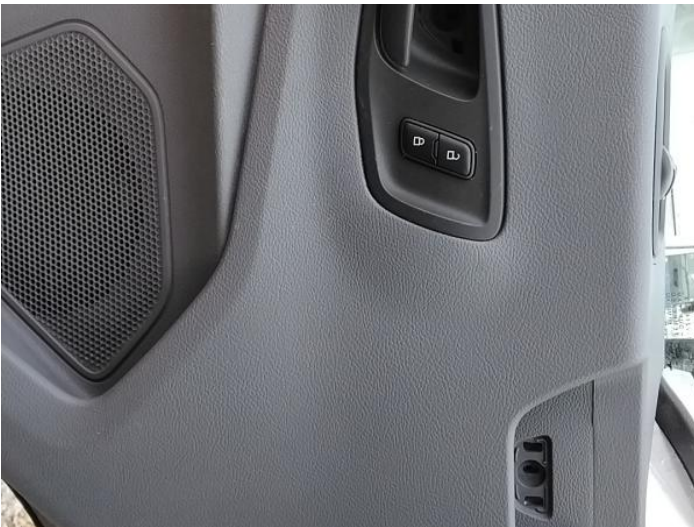
19: Other N/A N/A