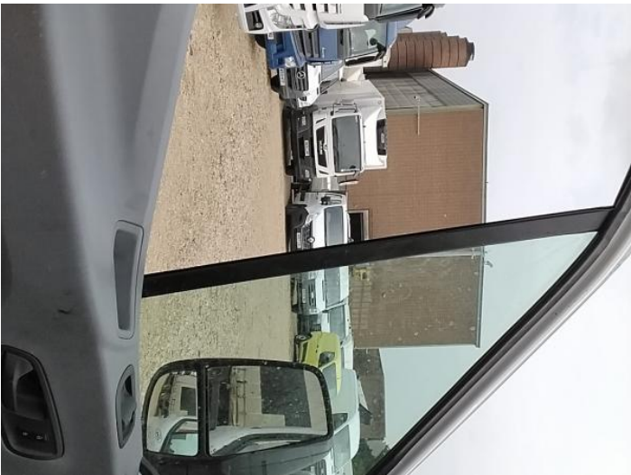
20: Other N/A N/A