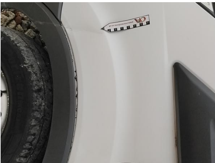
7: Wing nsf Dented Over 30% Of Panel