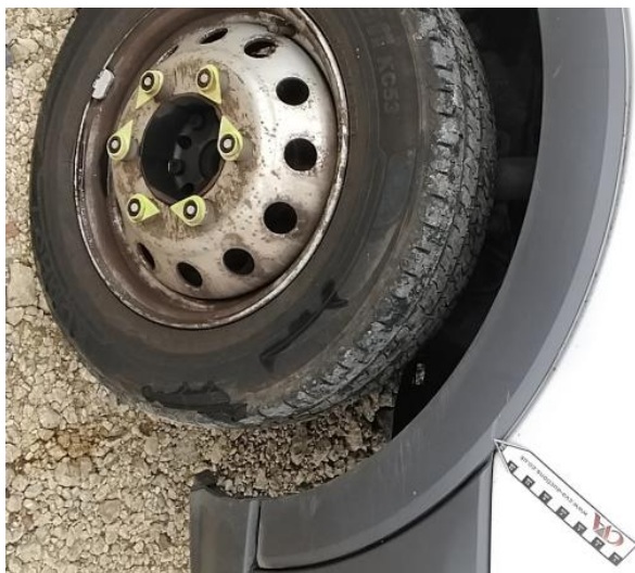
1: Moulding on Wing Scuffed (Unpainted) Over 100mm