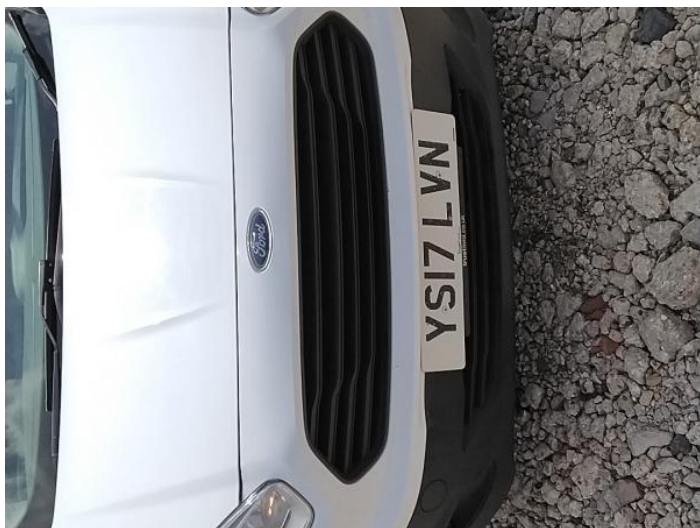
1: General Exterior Soiled Light