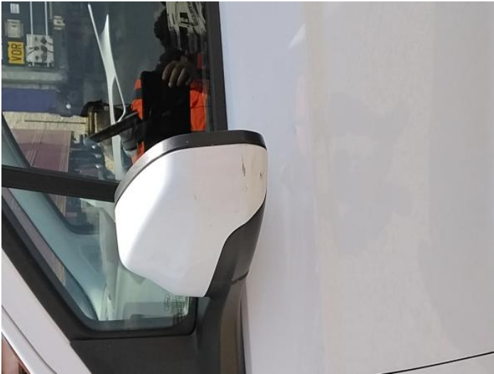
3: Door Mirror Assy nsf Scratched (Painted) Over 25mm Not Thru Paint