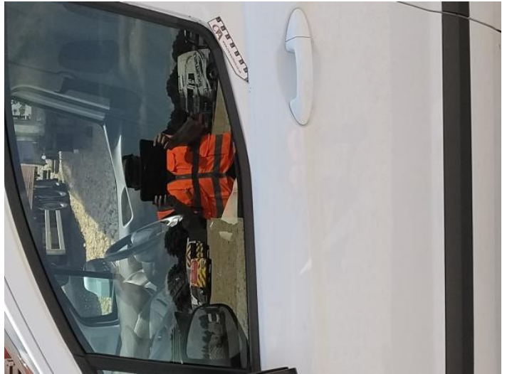
4: Door nsf Chipped Multiple Chips