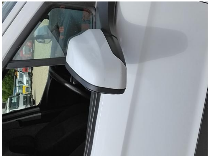
6: Door Mirror Assy osf Scratched (Painted) UpTo 25mm Not Thru Paint