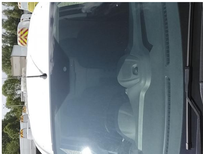
2: Screen Front Chipped UpTo 10mm