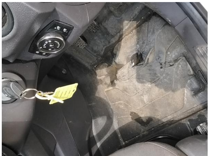
8: Carpets Front Holed Over 3mm