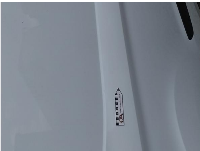
7: Qtr Panel osr Scratched Over 25mm Thru Paint