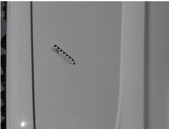
5: Qtr Panel osr Dented 2 Or Less UpTo 10mm