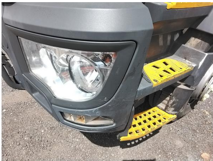
1: Bumper Front Scratched Over 100mm Thru Paint