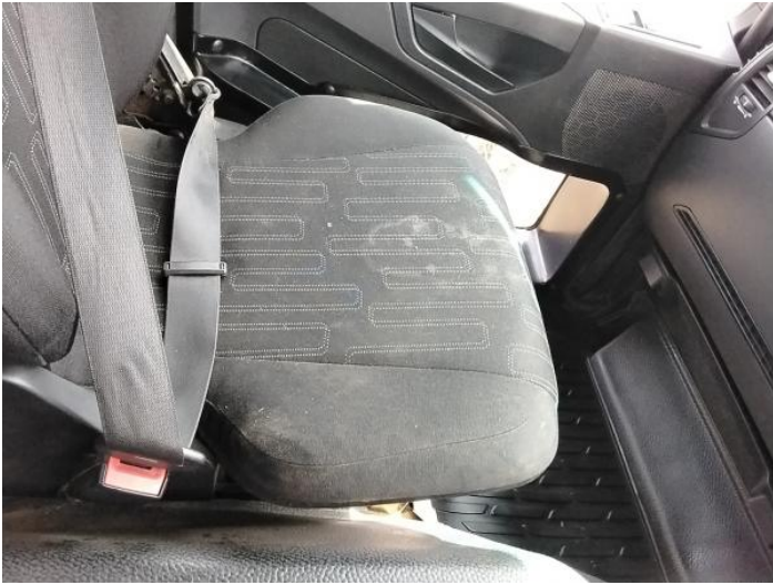
3: Seat Base Cover nsf Soiled Heavy