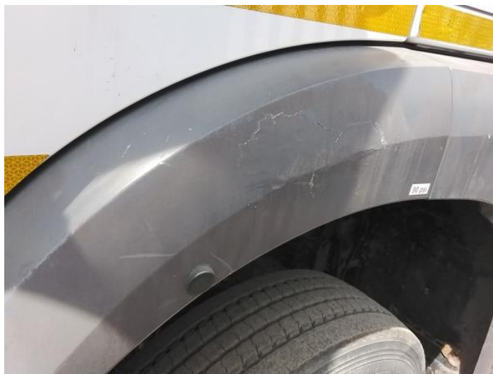
2: Wing nsf Poor Previous Repair Rippled UpTo 30%