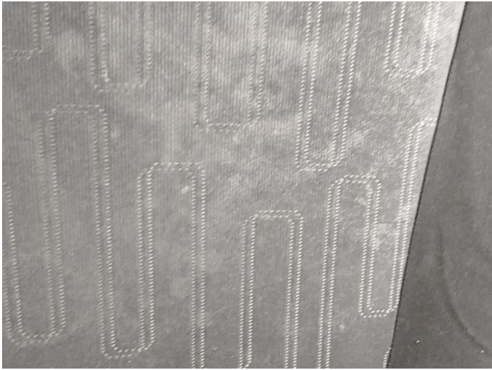
4: Seat Base Cover osf Soiled Heavy