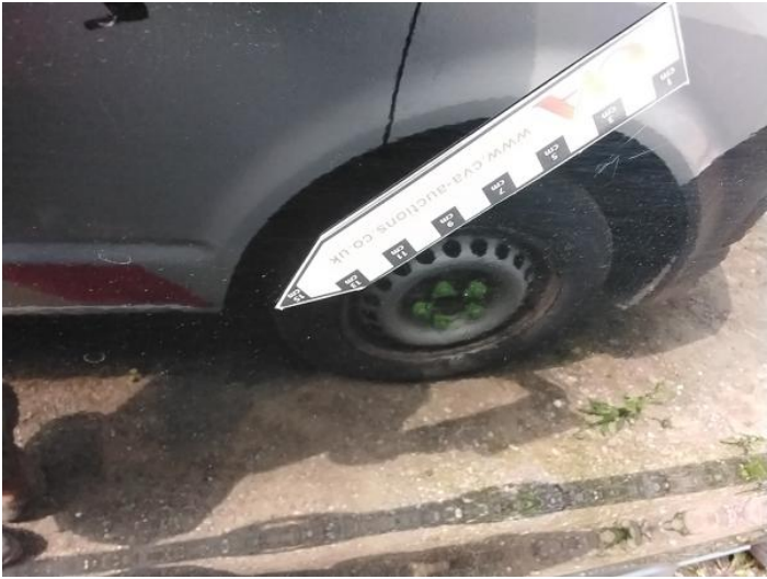
9: Door osf Scratched Over 25mm Thru Paint