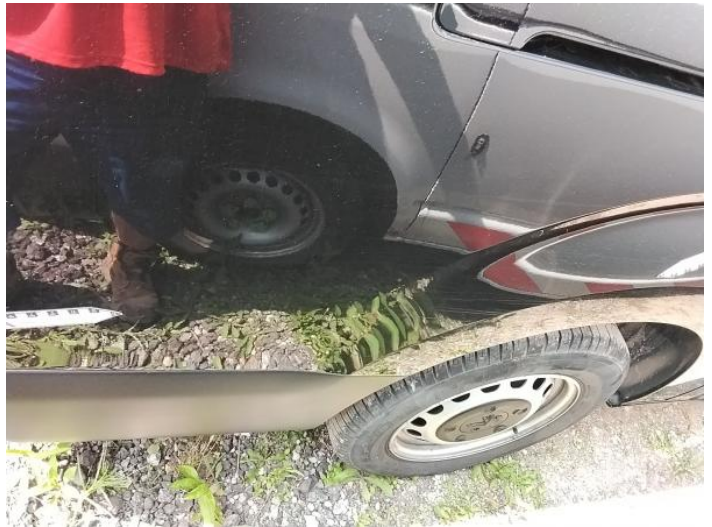
6: Qtr Panel osr Scratched Over 25mm Not Thru Paint