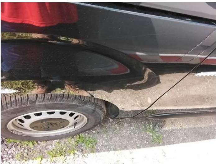
7: Qtr Panel osr Scratched Over 25mm Not Thru Paint