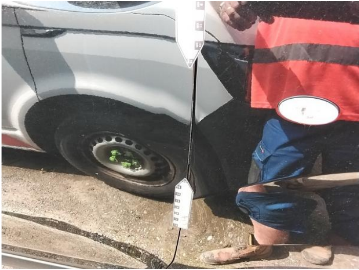
10: Door osf Dented With Paint Damage