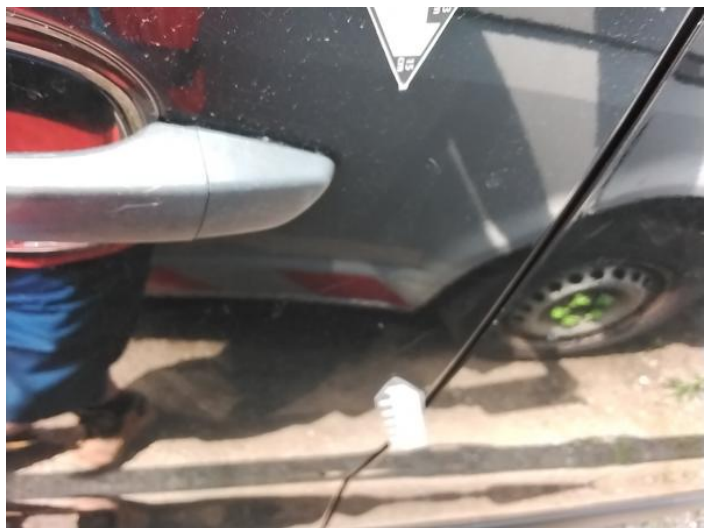
8: Qtr Panel osr Scratched Over 25mm Thru Paint