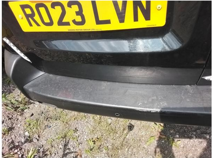
4: Door nsr Scratched Over 25mm Thru Paint