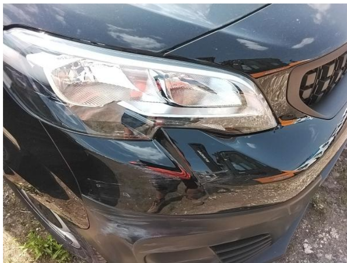
2: Panel Front Scratched Over 25mm Thru Paint