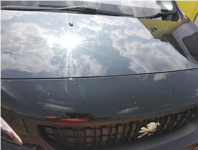
3: Bonnet Chipped Multiple Chips