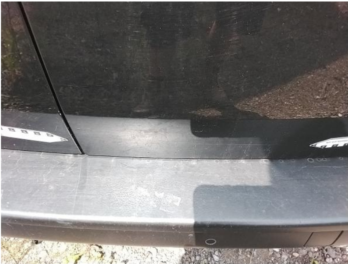
5: Door osr Scratched Over 25mm Thru Paint