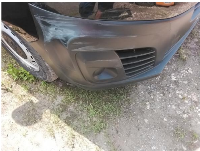
1: Bumper Front Scratched Over 100mm Thru Paint