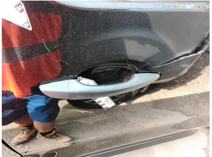
4: Qtr Panel nsr Scratched Over 25mm Thru Paint