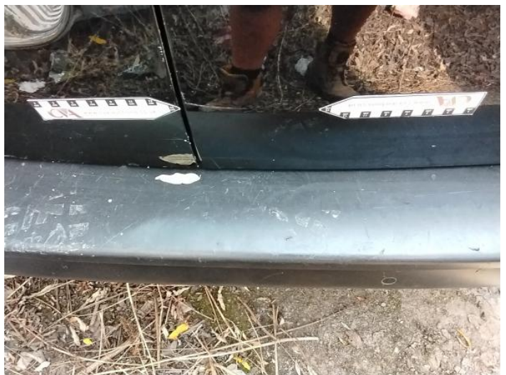
8: Door osr Scratched Over 25mm Thru Paint