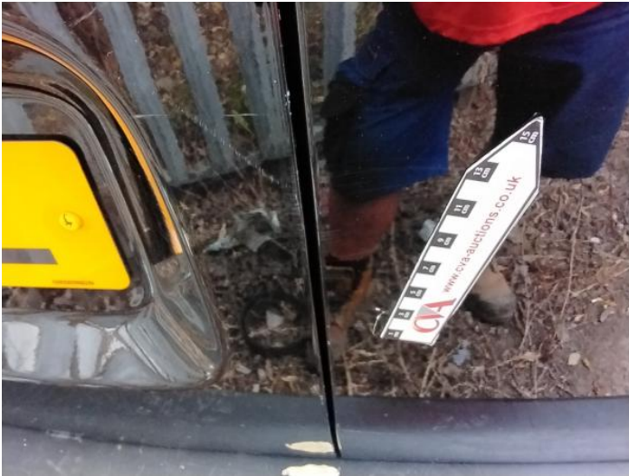
9: Door osr Scratched Over 25mm Thru Paint