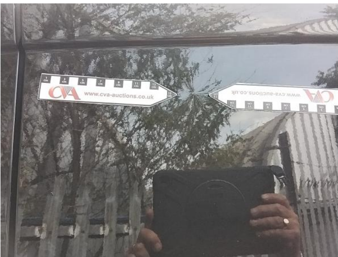
7: Door osr Dented Between 10mm + 30mm