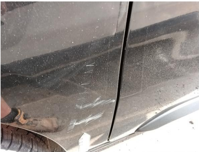
11: Qtr Panel osr Scratched Over 25mm Thru Paint