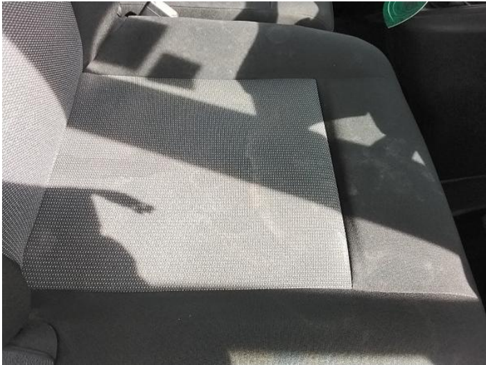
16: Seat Base Cover osf Soiled Heavy