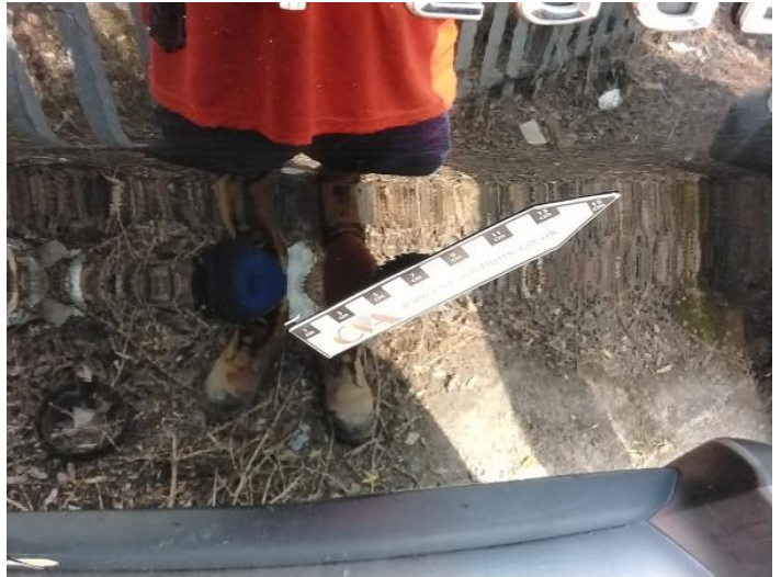
10: Door osr Scratched UpTo 25mm Thru Paint