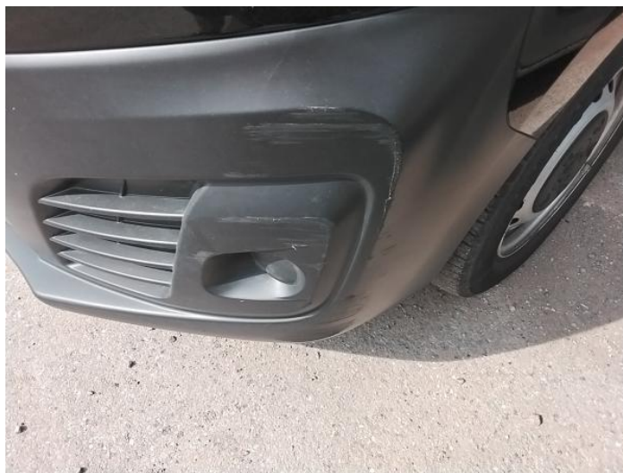
2: Bumper Front Scratched Over 100mm Thru Paint