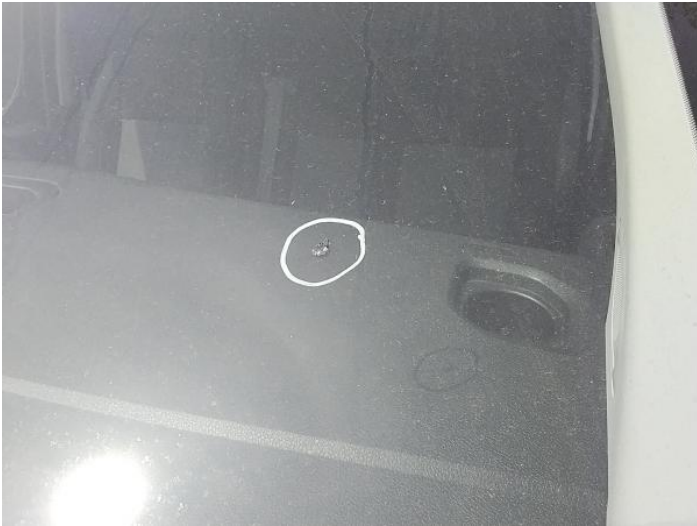
15: Screen Front Chipped Over 10mm