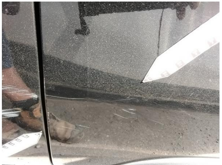
12: Qtr Panel osr Scratched Over 25mm Thru Paint