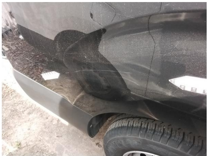
14: Qtr Panel osr Scratched Over 25mm Thru Paint