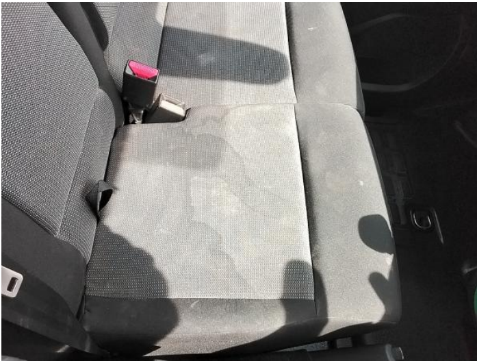
17: Seat Base Cover nsf Soiled Heavy