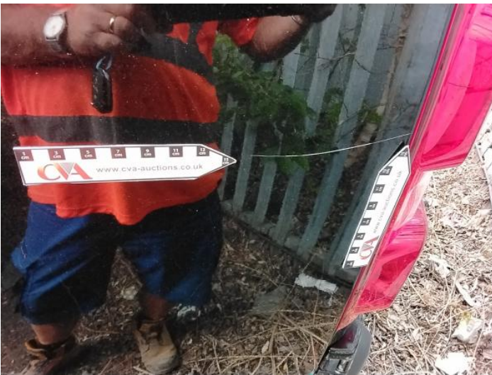
5: Qtr Panel nsr Scratched Over 25mm Thru Paint