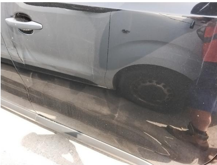
13: Door osf Chipped Multiple Chips