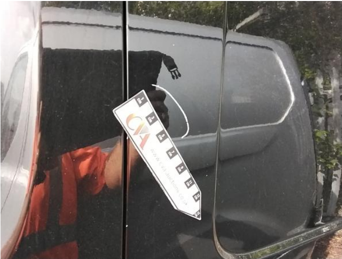
3: Qtr Panel nsr Scratched Over 25mm Thru Paint