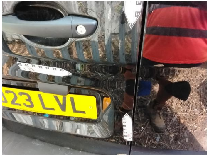
6: Door nsr Scratched Over 25mm Thru Paint