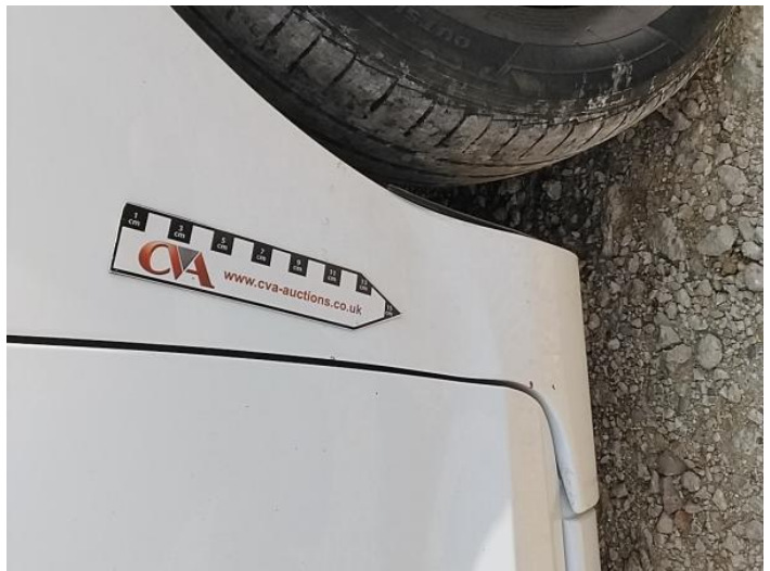
2: Wing nsf Dented Over 2 UpTo 10mm