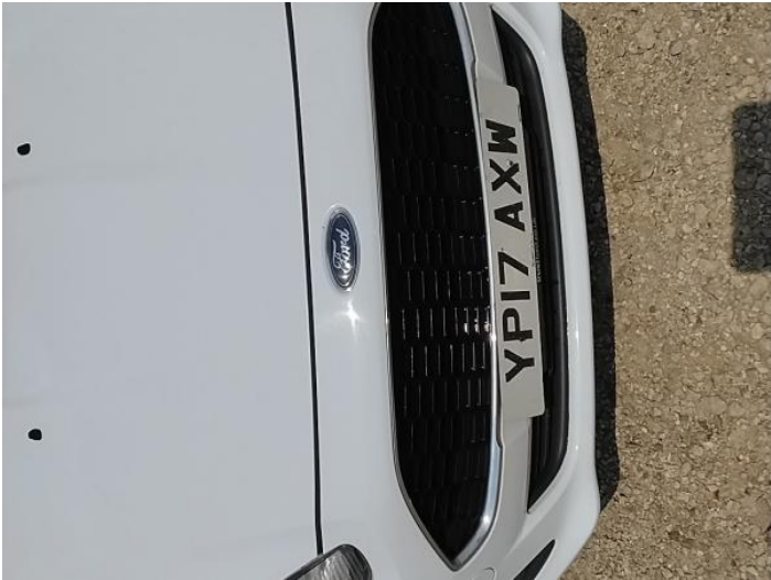
3: Bumper Front Chipped Multiple Chips