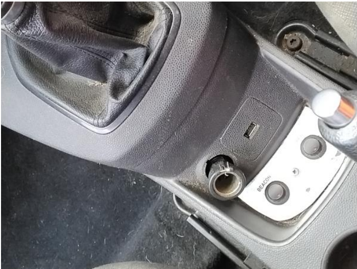
5: Other N/A N/A