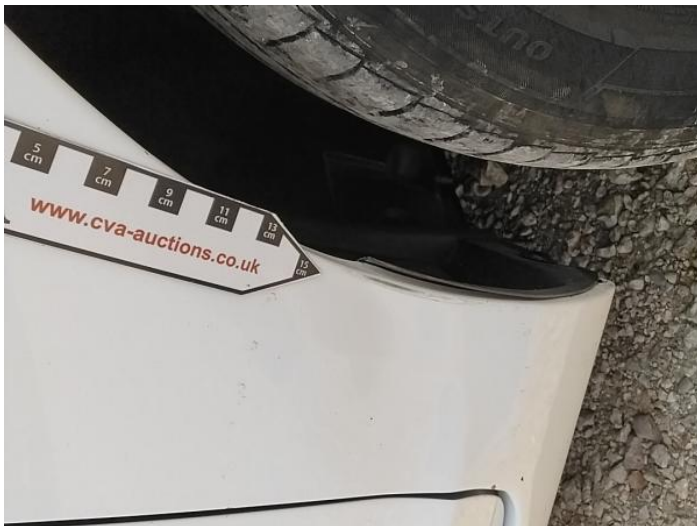
1: Wing osf Scratched Over 25mm Thru Paint