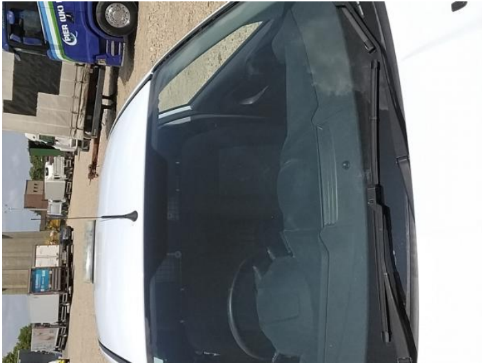
4: Screen Front Chipped UpTo 10mm