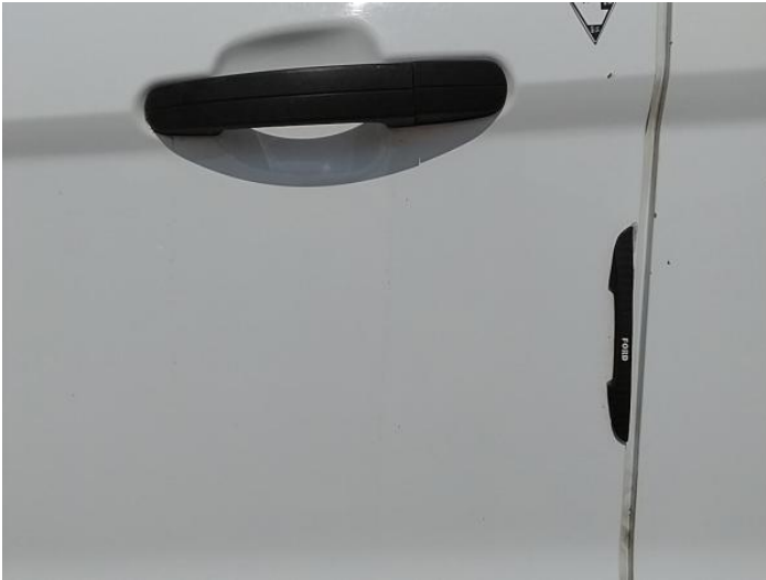
9: Door nsf Chipped 1 To 5