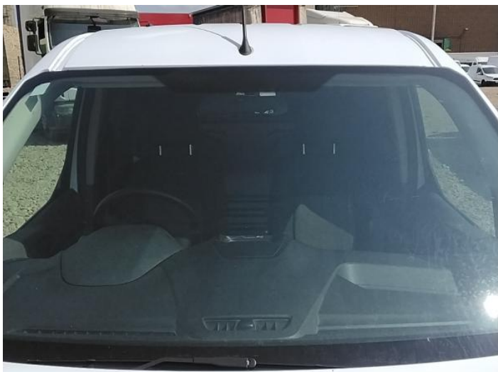
3: Screen Front Chipped UpTo 10mm