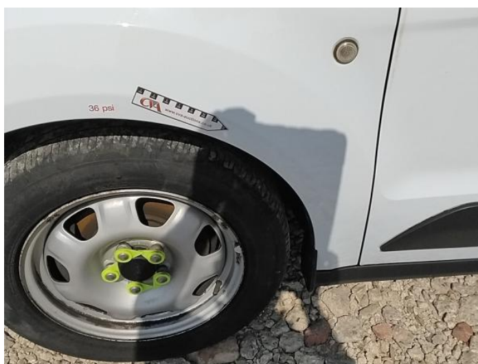
8: Wing nsf Dented Over 2 UpTo 10mm