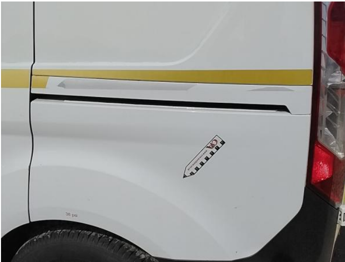
11: Qtr Panel nsr Chipped Multiple Chips