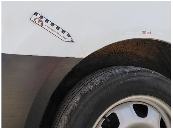
12: Qtr Panel osr Dented Over 30mm