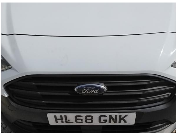
5: Panel Front Chipped Multiple Chips