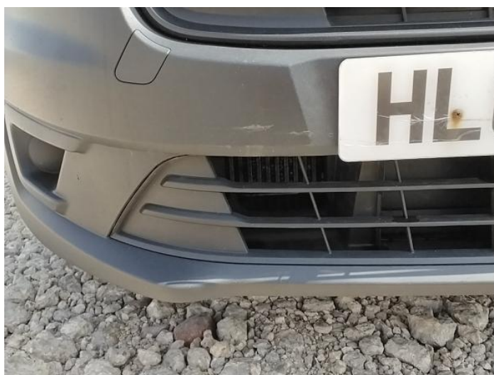
6: Bumper Front Scratched Over 25mm Not Thru Paint