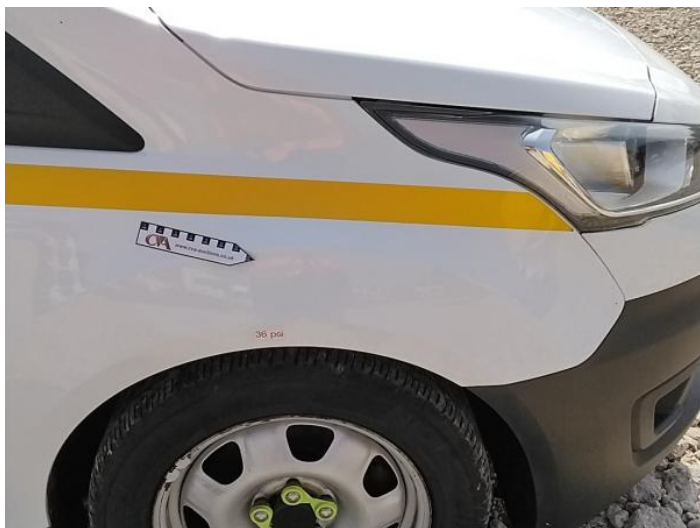
1: Wing of Chipped Multiple Chips