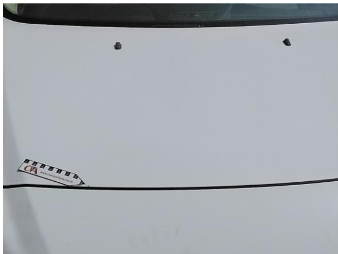
4: Bonnet Chipped Multiple Chips