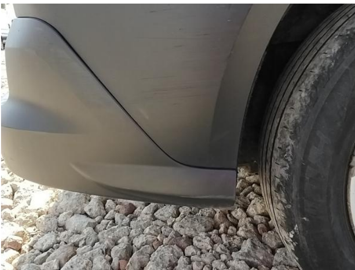
13: Qtr Panel Trim os Scuffed Over 25mm