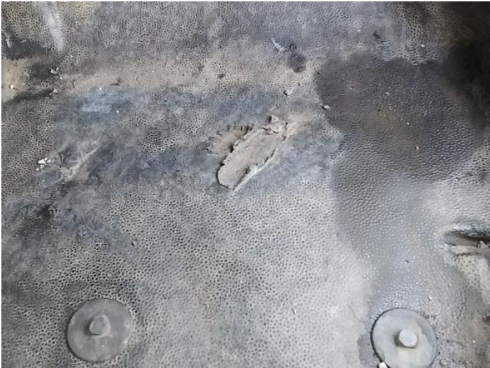
15: Carpets Front Holed Over 3mm