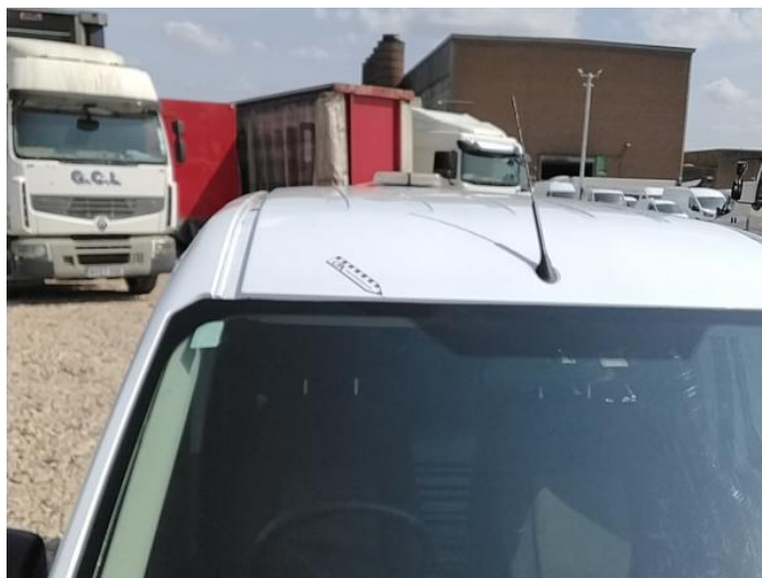
2: General Exterior Soiled Light