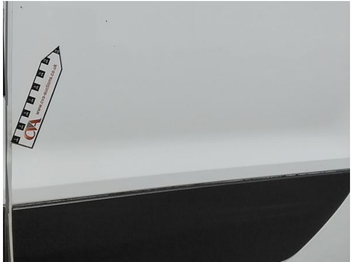
10: Door nsr Chipped Multiple Chips