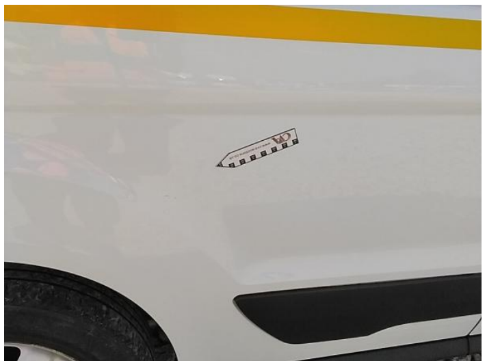
14: Qtr Panel osr Chipped Multiple Chips