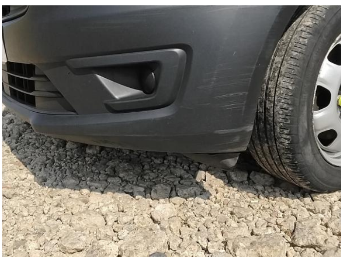
7: Bumper Front Scratched Over 25mm Not Thru Paint