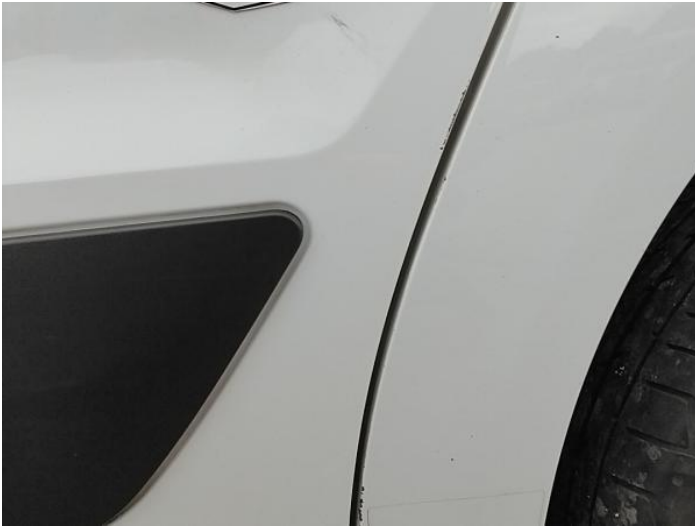
9: Door nsr Scratched Over 25mm Not Thru Paint