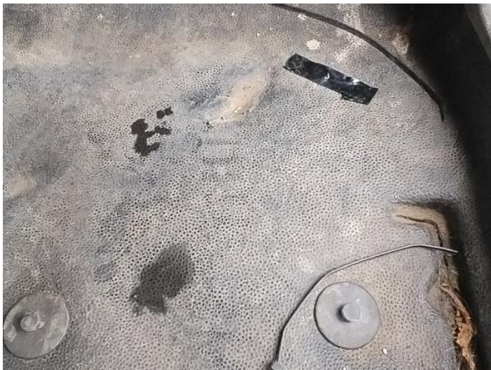
15: Carpets Front Holed Over 3mm