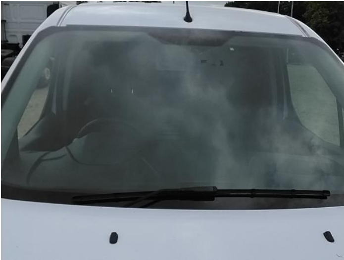
3: Screen Front Chipped UpTo 10mm