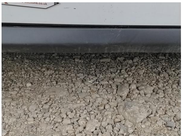
14: Door osf Scratched Over 25mm Thru Paint