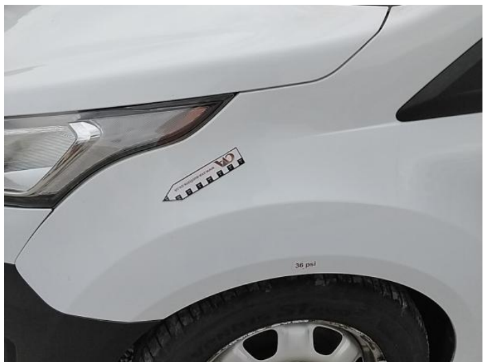
8: Wing nsf Chipped Multiple Chips