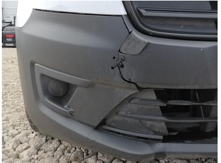
4: Bumper Front Cracked Over 25mm