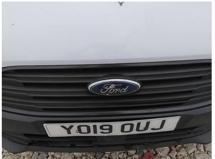
6: Panel Front Chipped Multiple Chips