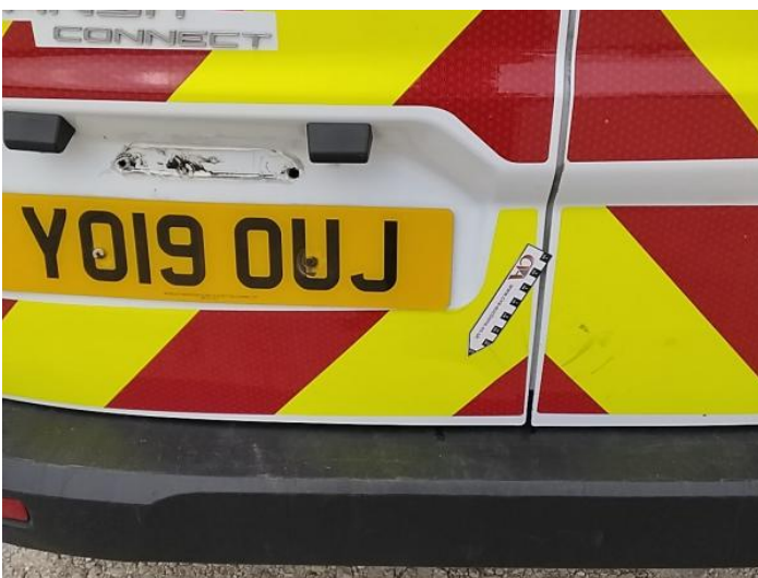
13: Door nsr Dented Over 30mm