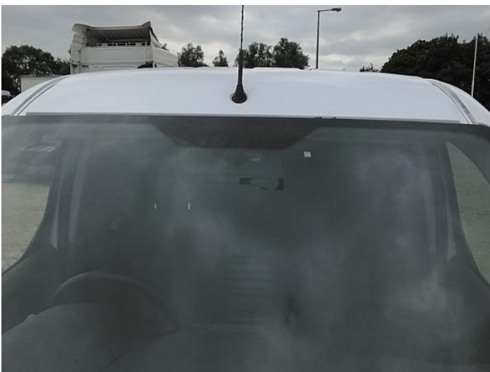
7: General Exterior Soiled Light