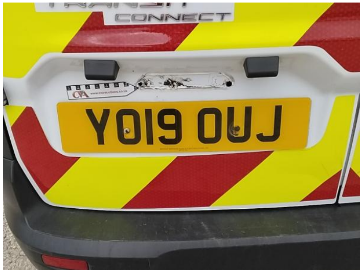
12: General Exterior Soiled Light