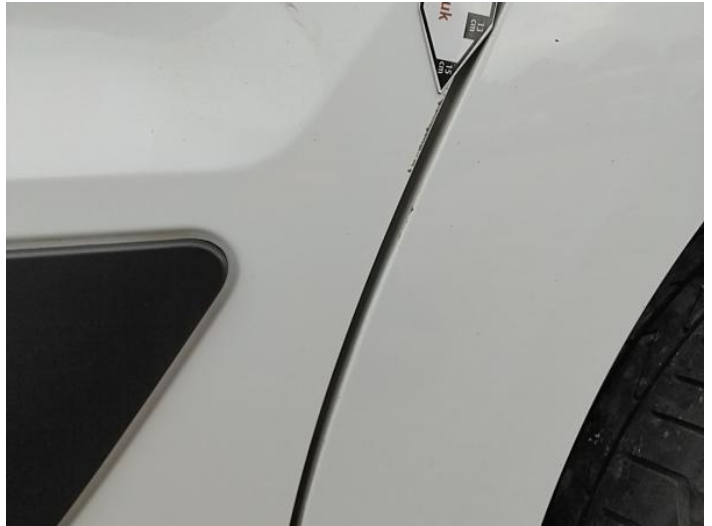
10: Door nsr Scratched Over 25mm Thru Paint