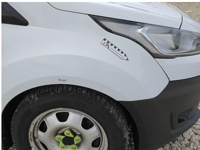
1: Wing of Chipped Multiple Chips