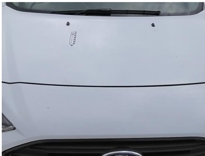
2: Bonnet Chipped Multiple Chips