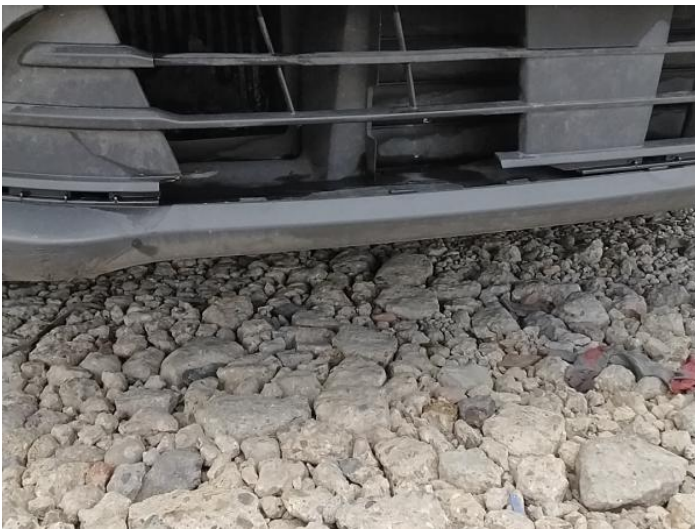
5: Grille Front Broken Replace