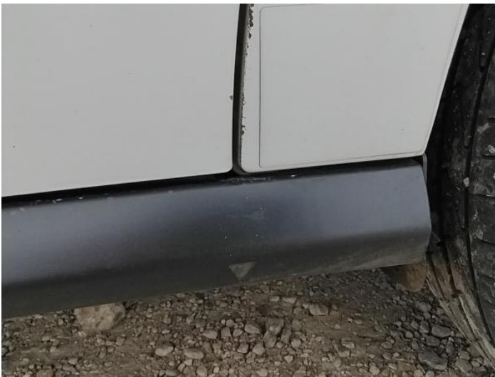
11: Qtr Panel nsr Scratched Over 25mm Thru Paint