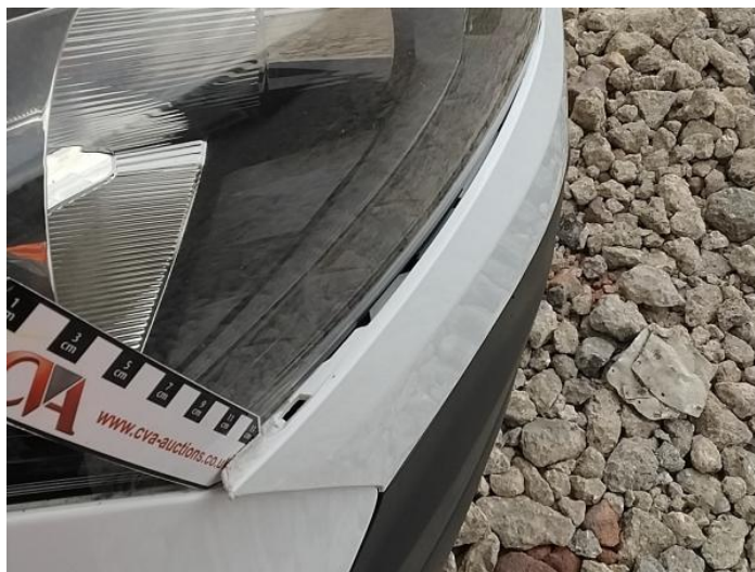
2: Grille Front Broken Replace