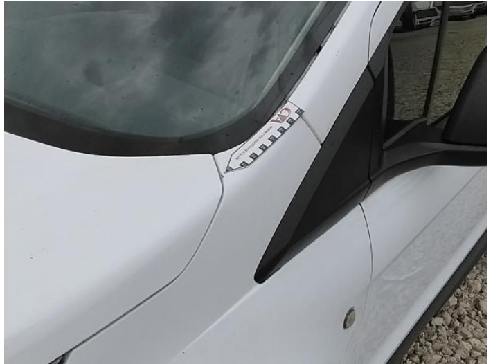
4: Wing nsf Chipped Over 5mm