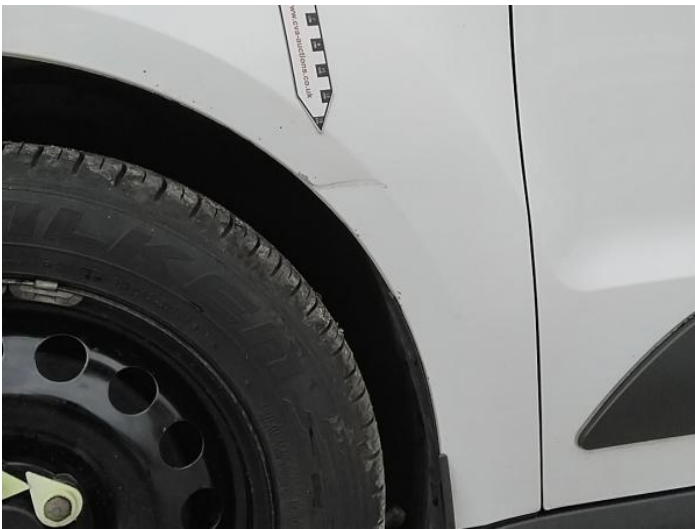
5: Wing nsf Dented With Paint Damage