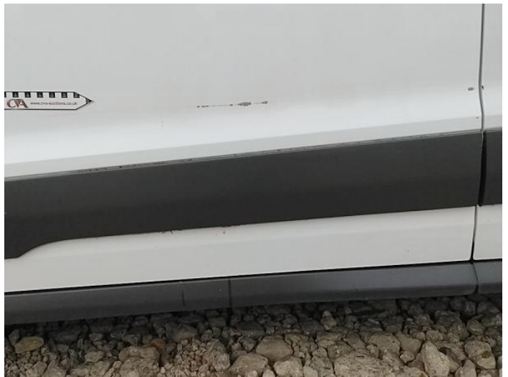
6: Door nsf Scratched Over 25mm Thru Paint