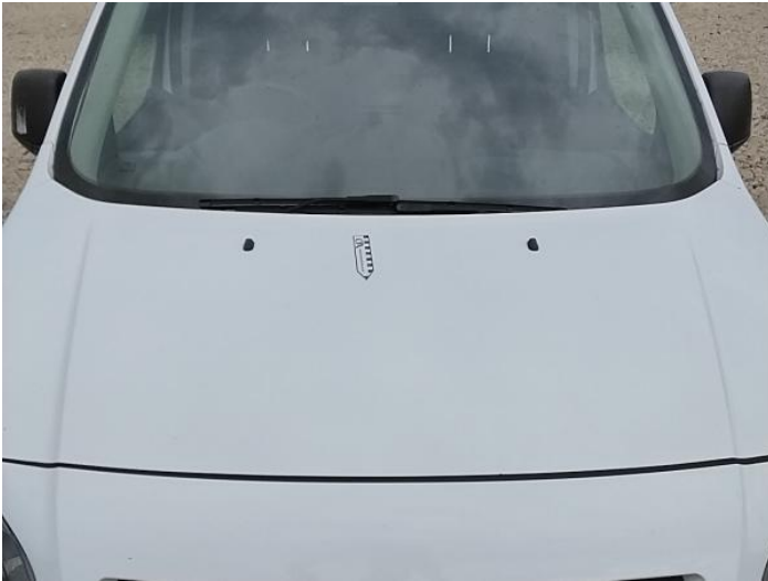
3: Bonnet Chipped Multiple Chips