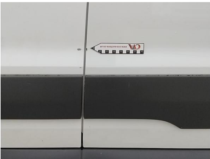
7: Door nsr Chipped Over 5mm