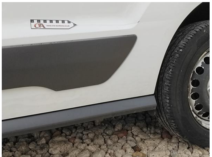
8: Door nsr Dented With Paint Damage