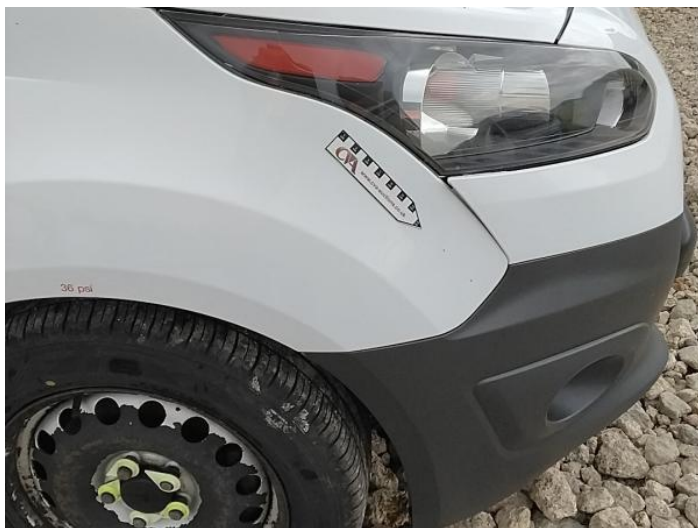
1: Wing osf Chipped 1 To 5