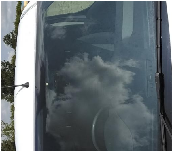
1: Screen Front Chipped UpTo 10mm