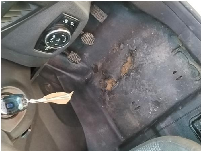
4: Carpets Front Holed Over 3mm