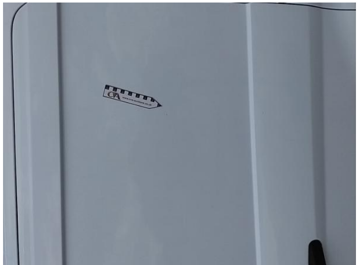
2: General Exterior Soiled Light