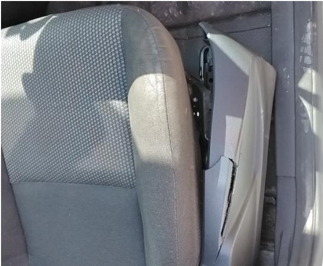
3: Other N/A N/A