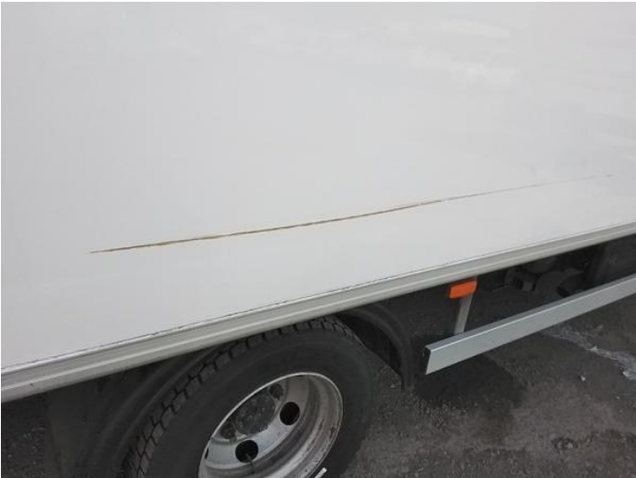
4: Qtr Panel osr Scratched Over 25mm Thru Paint