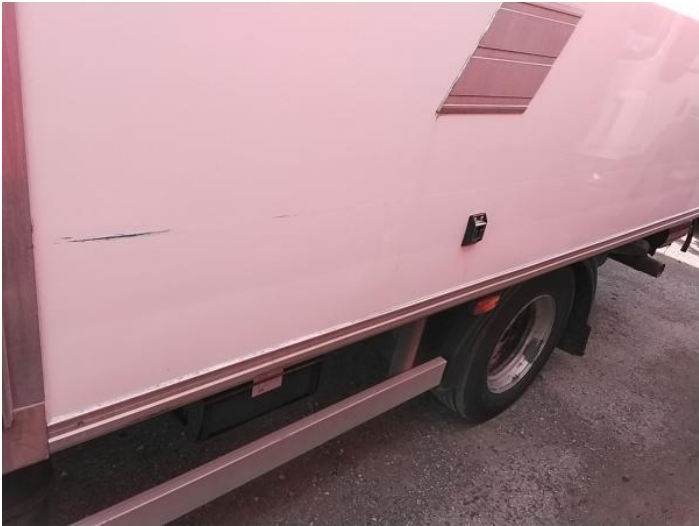
3: Qtr Panel nsr Scratched Over 25mm Thru Paint