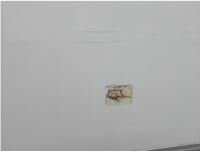
5: Qtr Panel osr Cracked Replace