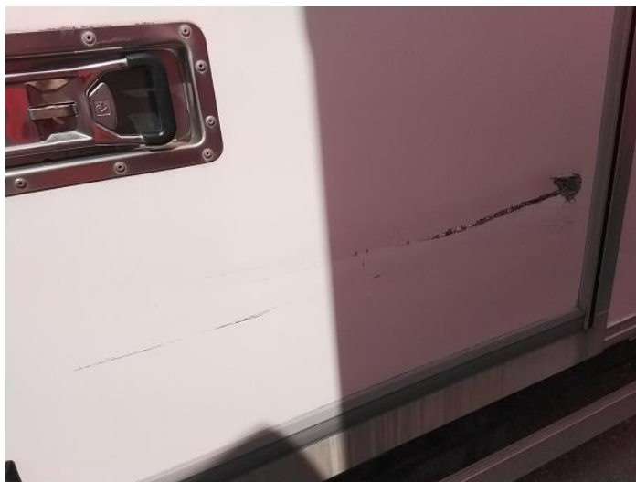
2: Qtr Panel nsr Cracked Replace