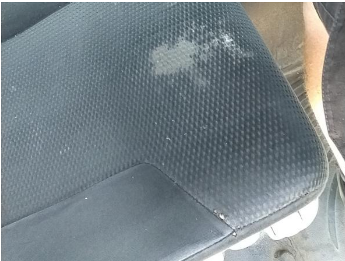
13: Seat Base Cover osf Holed Over 3mm