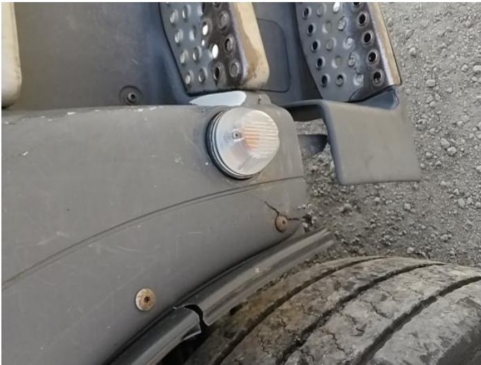
11: General Exterior Soiled Light