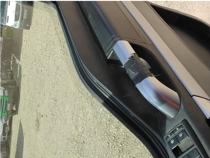
12: Handle Inner osf Damaged Replace