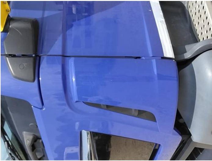
5: Wing nsf Scratched Over 25mm Thru Paint