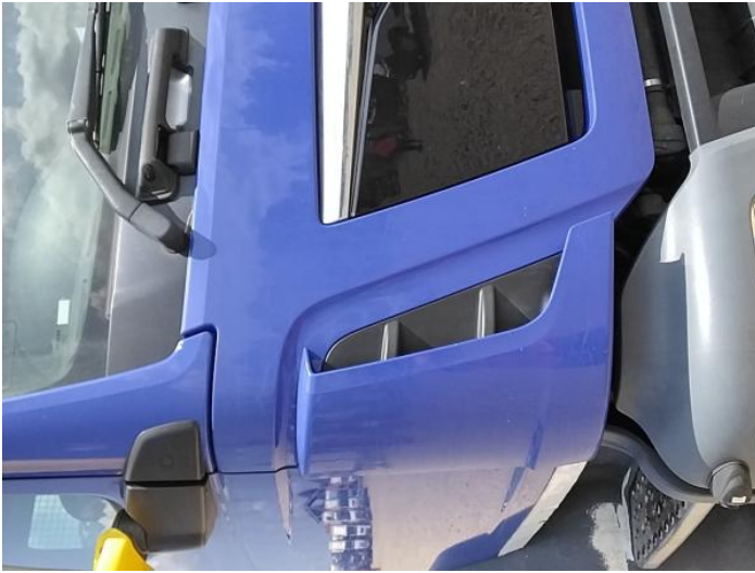
3: Wing osf Chipped Multiple Chips