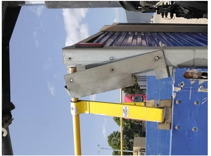
6: General Exterior Soiled Light