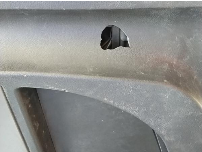
14: Other N/A N/A