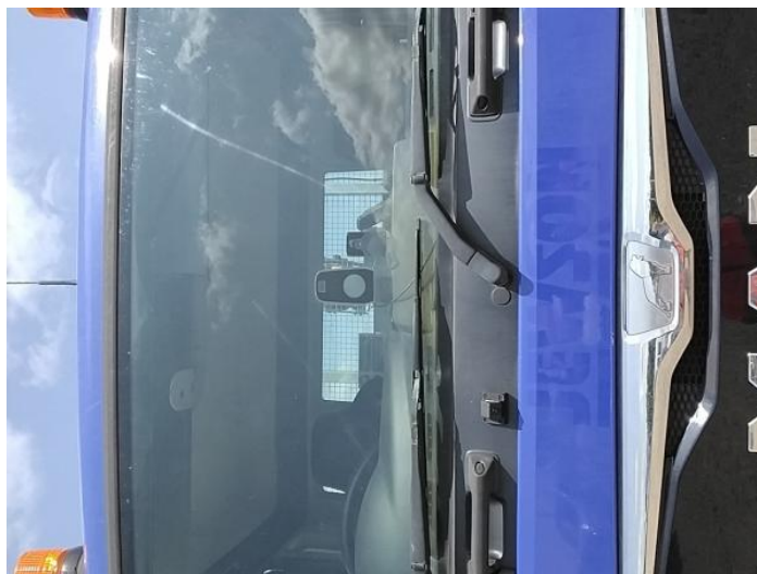
2: Screen Front Chipped Over 10mm