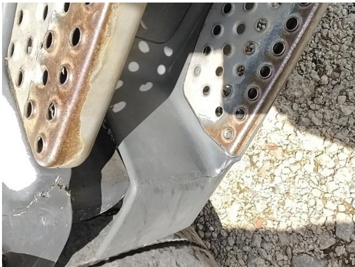
15: General Exterior Soiled Light