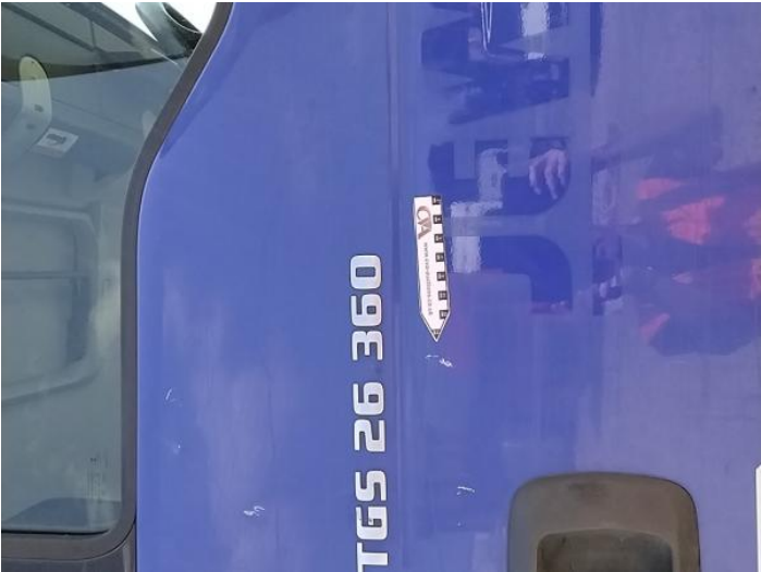
10: Door osf Scratched Over 25mm Thru Paint