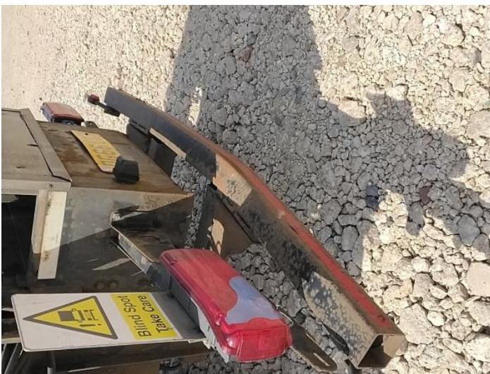
7: Bumper Rear Rusted Over 5mm