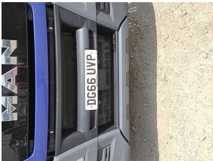
1: Bumper Front Scratched Over 100mm Thru Paint