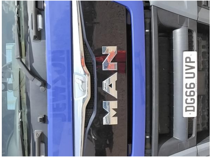
4: Bonnet Chipped Multiple Chips