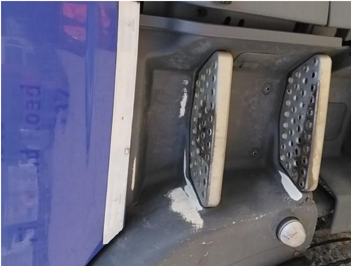
9: General Exterior Soiled Light