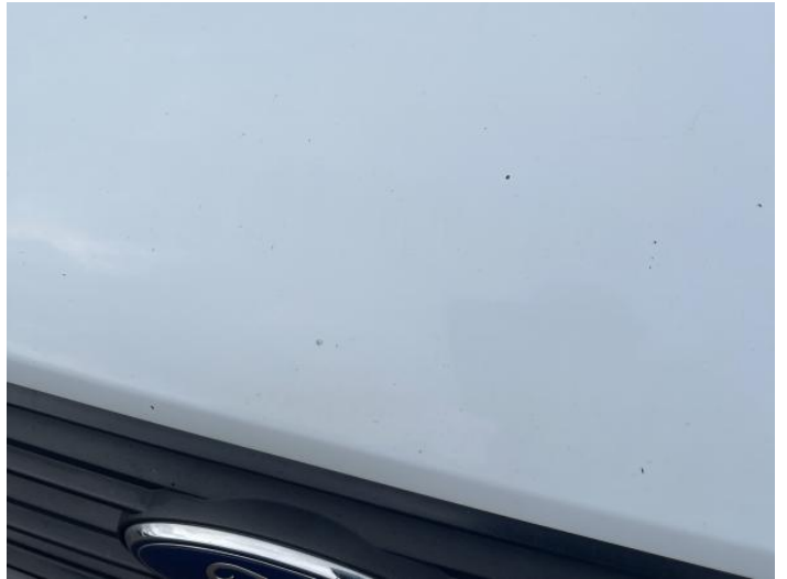
4: Bumper Front Chipped Multiple Chips