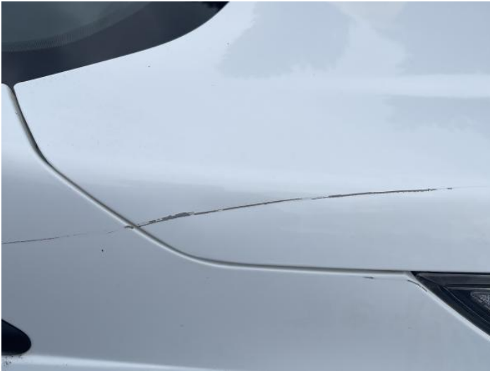
3: Bonnet Dented With Paint Damage