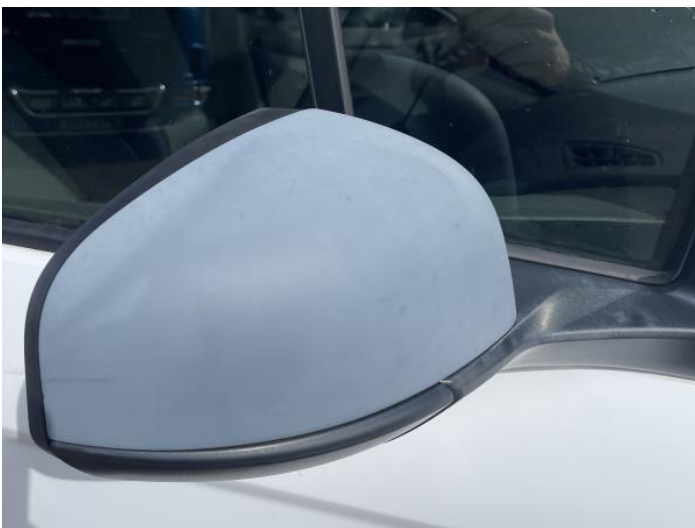
13: Door Mirror Assy osf Scuffed (Unpainted) Over 100mm