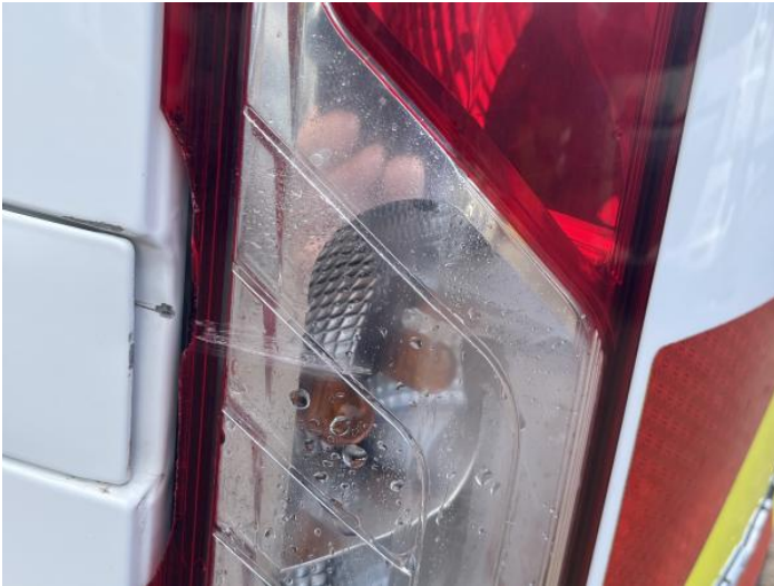
9: Fog Lamp nsr Broken Replace