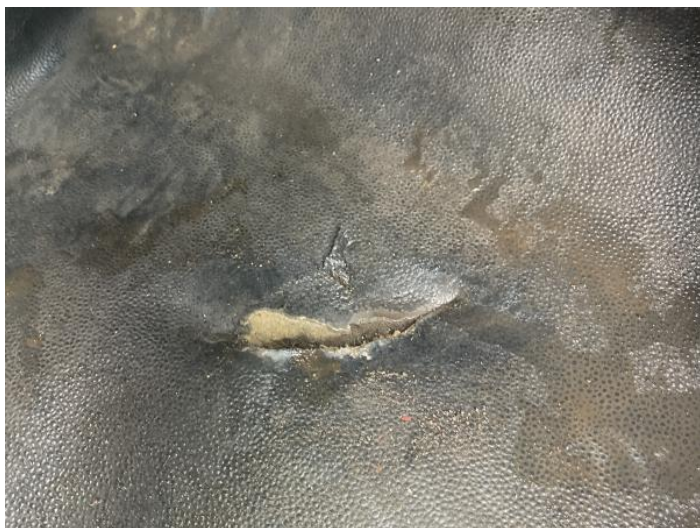
1: Carpets Front Torn Over 10mm