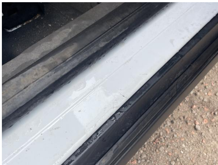
2: Sill os Scratched Over 25mm Not Thru Paint