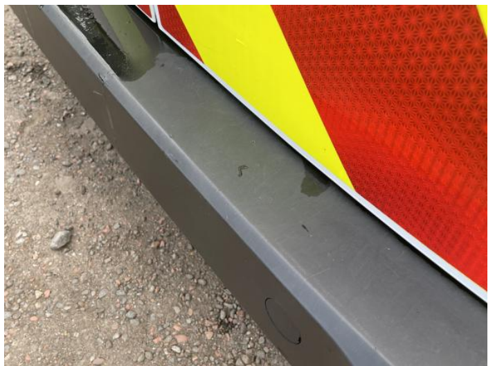
8: Bumper Rear Moulding Scuffed (Unpainted) Up To 100mm