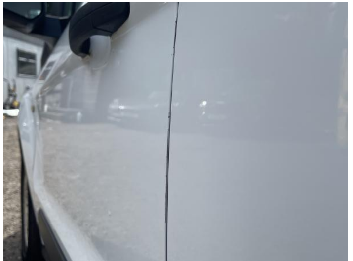
12: Door nsf Chipped Edge Chip