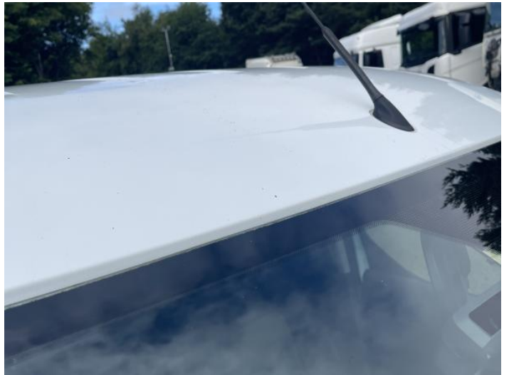
6: Roof Rusted Over 5mm