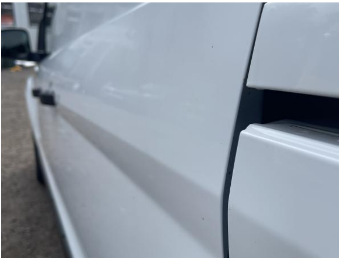
11: Door nsr Dented 2 Or Less UpTo 10mm