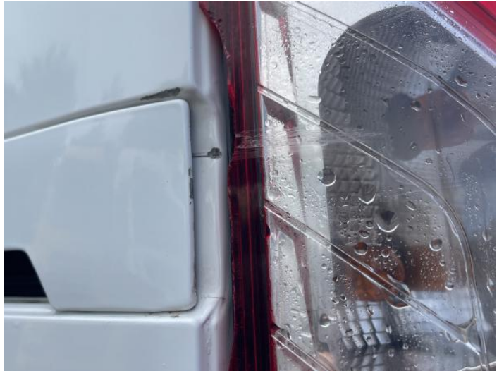
10: Qtr Panel nsr Dented With Paint Damage