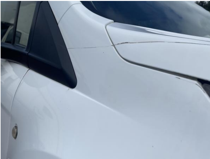
5: Wing of Dented With Paint Damage