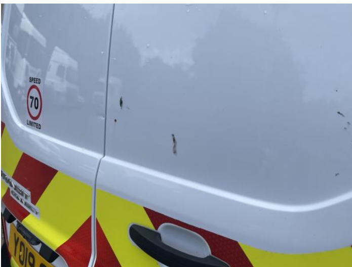
7: Tailgate Dented With Paint Damage