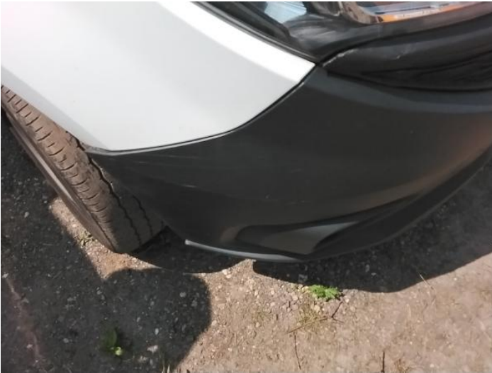
3: Bumper Front Scratched Over 100mm Thru Paint