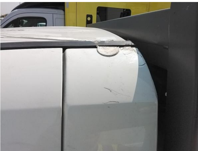
7: B Post ns Poor Previous Repair Rippled UpTo 30%