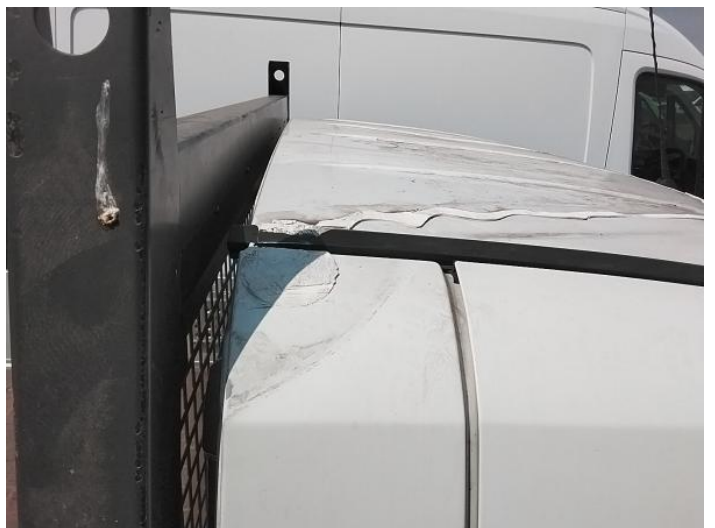
8: B Post os Poor Previous Repair Rippled UpTo 30%