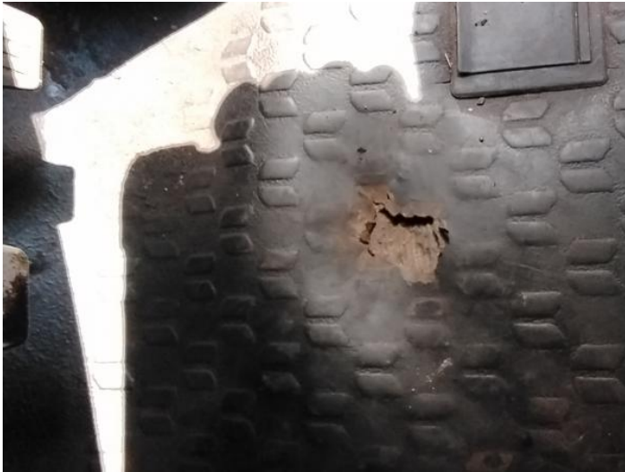
10: Carpets Front Holed Over 3mm