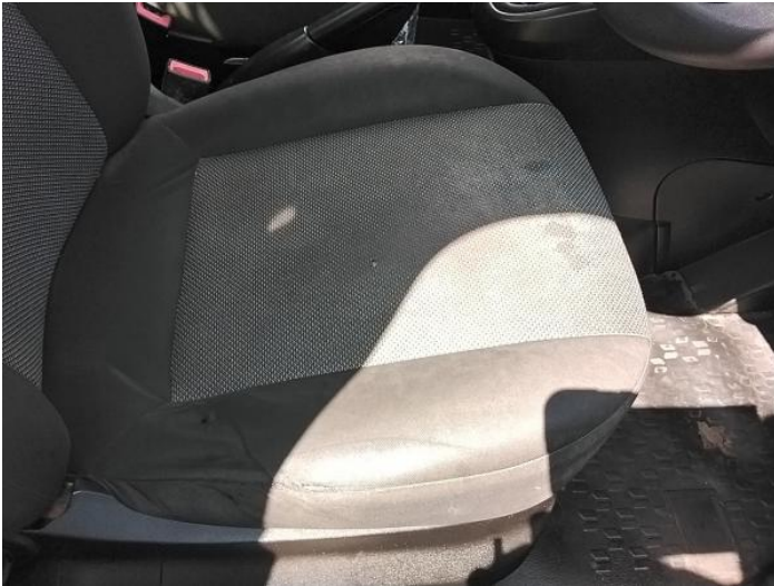
9: Seat Base Cover osf Soiled Heavy