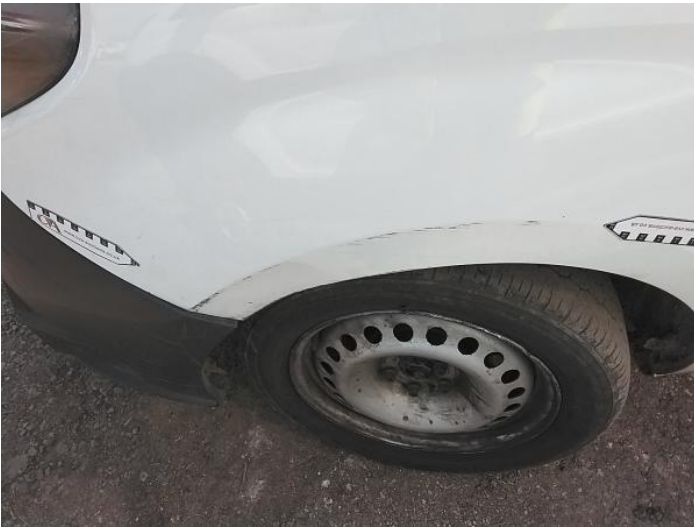
5: Wing nsf Scratched Over 25mm Thru Paint