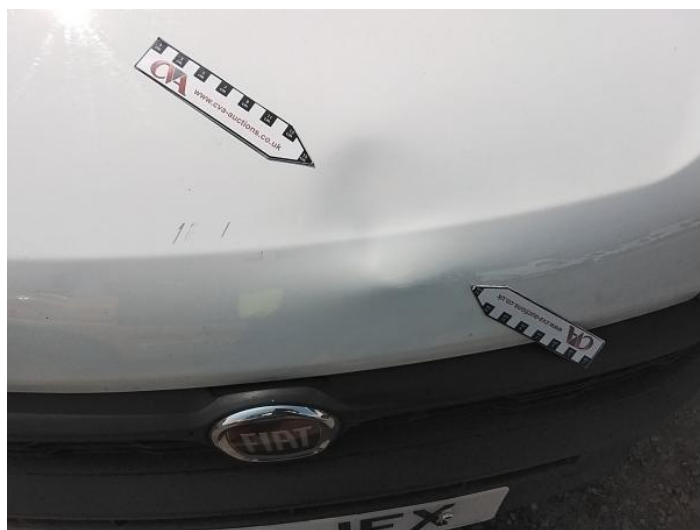
1: Bonnet Dented Over 30mm