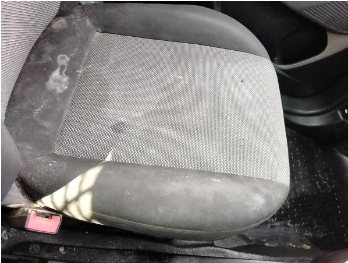
11: Seat Base Cover nsf Soiled Heavy