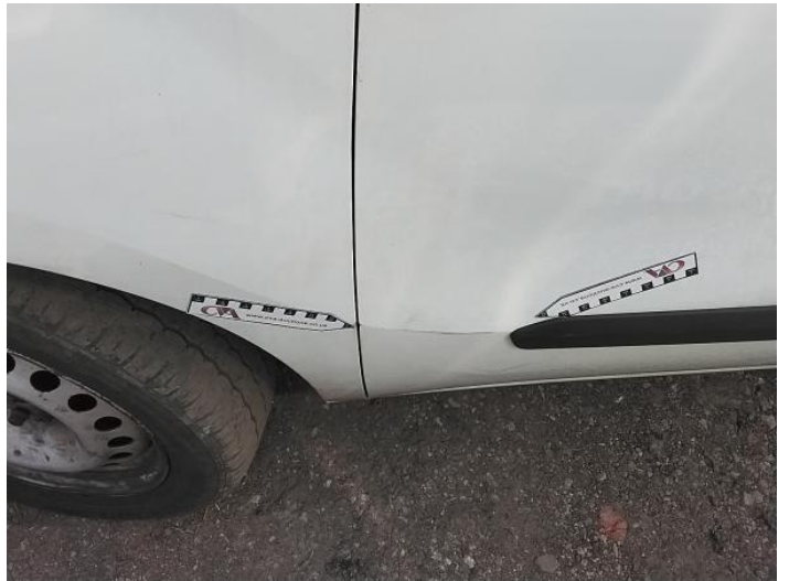
6: Door nsf Scratched Over 25mm Thru Paint