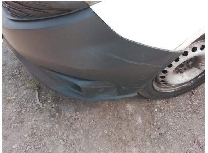
4: Bumper Front Scratched Over 100mm Thru Paint