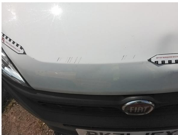
2: Bonnet Scratched Over 25mm Thru Paint