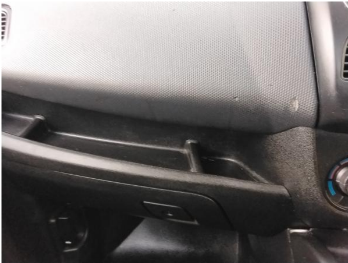
12: Fascia Panel Holed Over 3mm