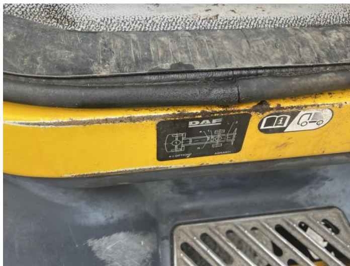
2: Sill os Rusted Over 5mm