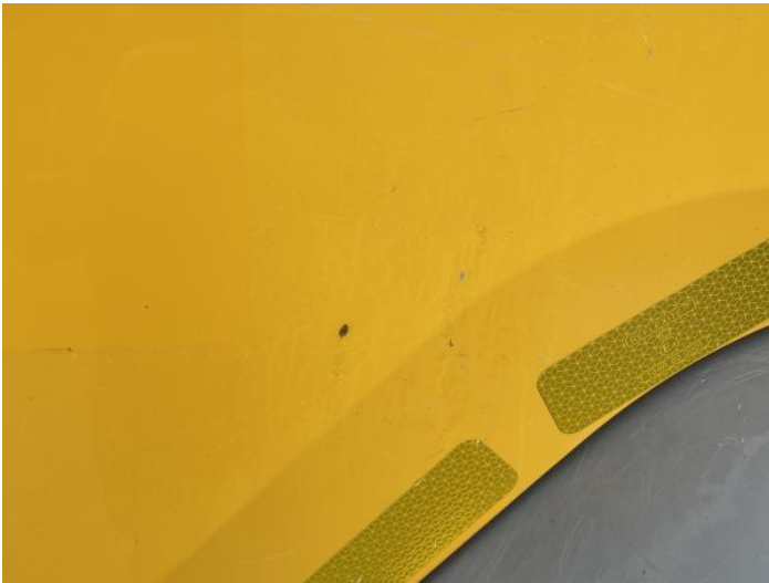
11: Door nsf Rusted Over 5mm