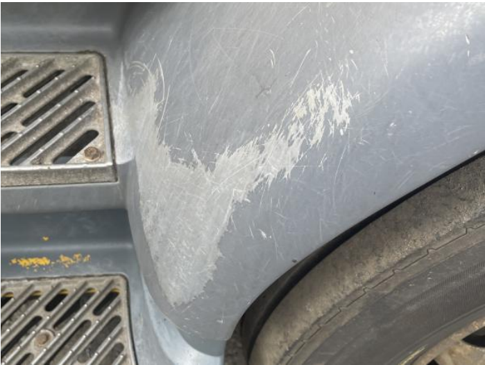
12: Door Moulding nsf Scuffed (Unpainted) Over 100mm