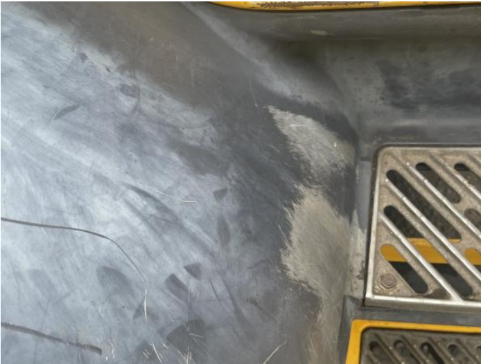
3: Door Moulding osf Scuffed (Unpainted) Over 100mm