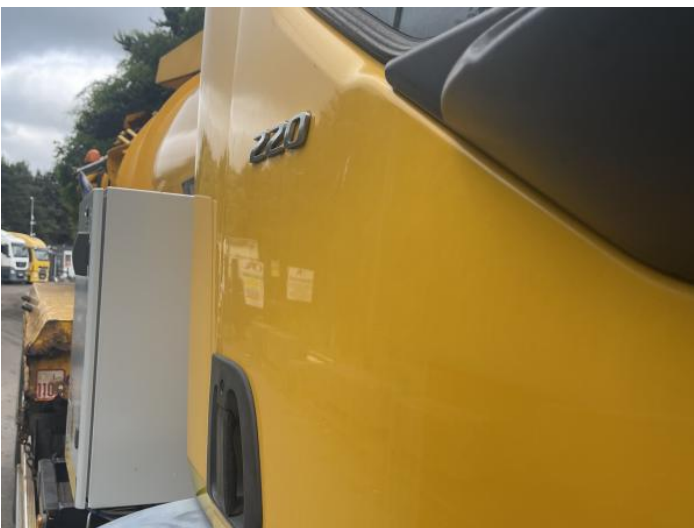
7: Door osf Dented Between 10mm + 30mm