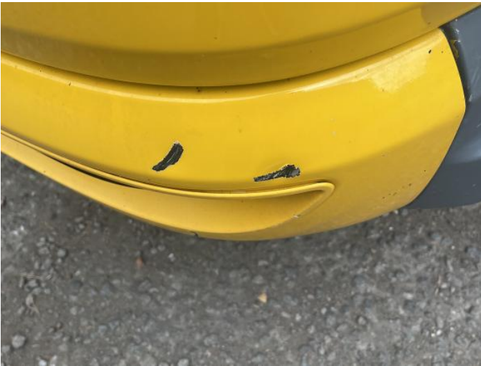
5: Bumper Front Dented With Paint Damage