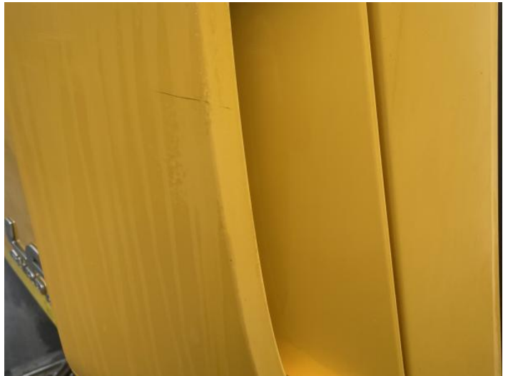
6: Wing osf Scratched Over 25mm Thru Paint