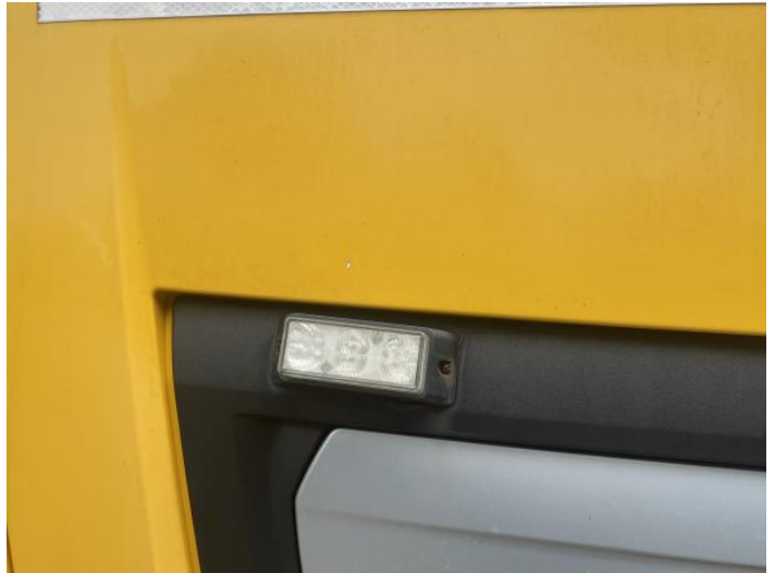
4: Bonnet Chipped 1 To 5