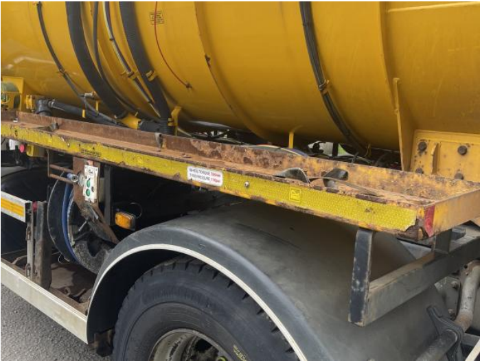
10: Qtr Panel nsf Rusted Over 5mm