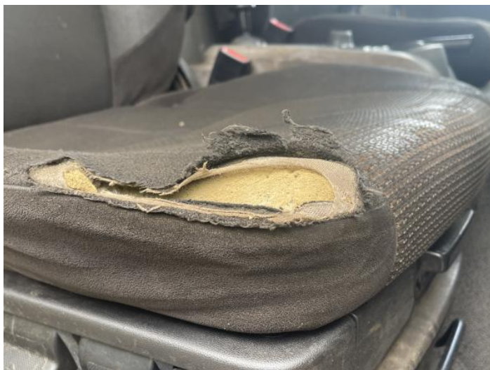
1: Seat Base Cover osf Torn Over 3mm