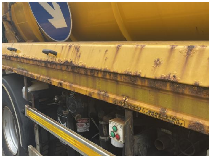
8: Qtr Panel osr Rusted Over 5mm