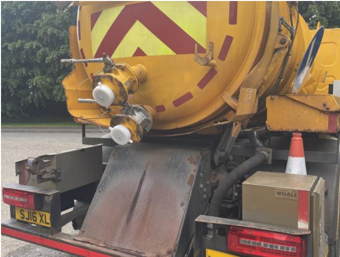
9: Tailgate Rusted Over 5mm