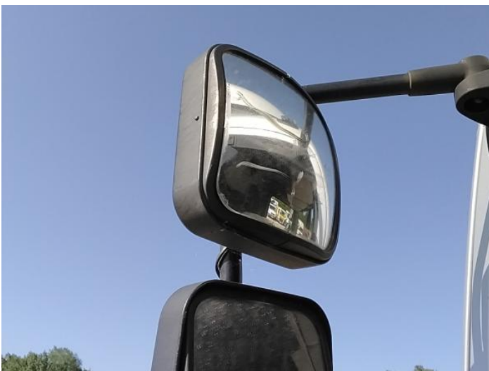
7: Door Mirror Glass ns Broken Replace