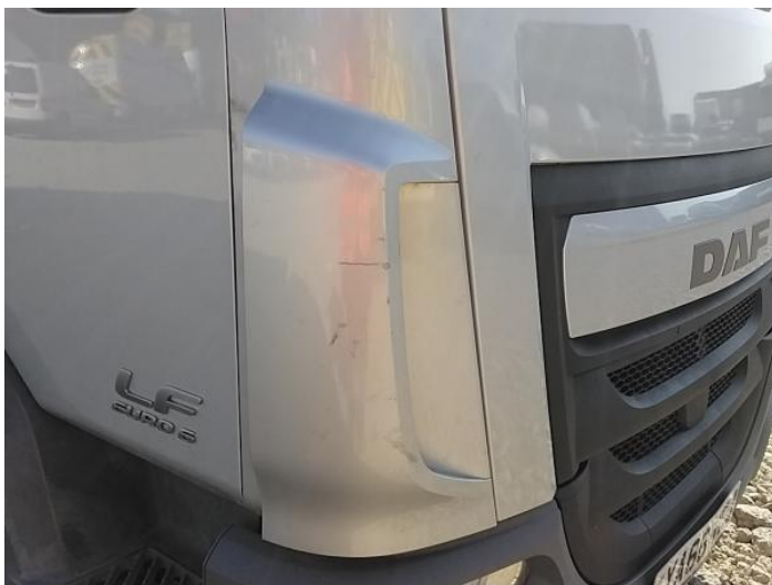
1: Moulding on Wing Scratched (Painted) Over 25mm Thru Paint