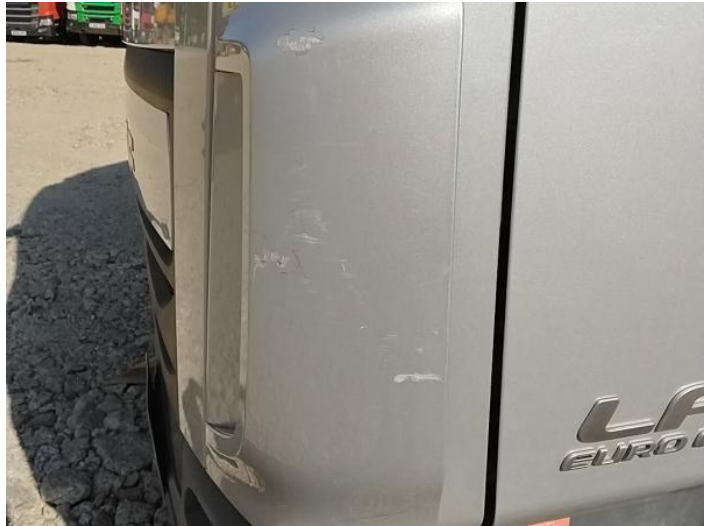
4: Moulding nsf Wing Scratched (Painted) Over 25mm Thru Paint