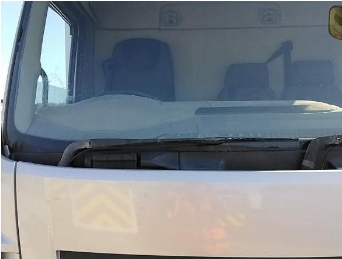
3: Screen Front Chipped Over 10mm