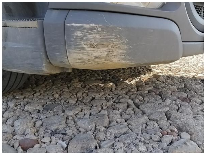
2: Bumper Front Dented Over 30mm