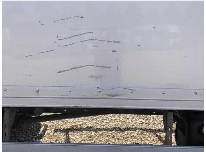
10: General Exterior Soiled Light