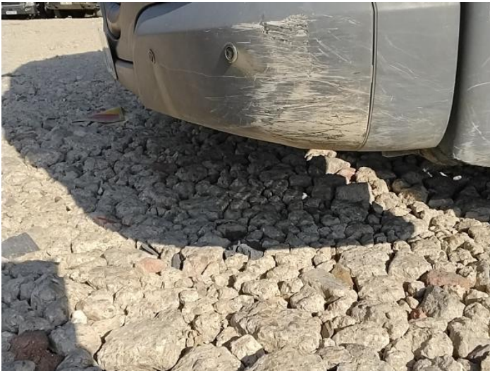
5: Bumper Front Scratched Over 25mm Not Thru Paint