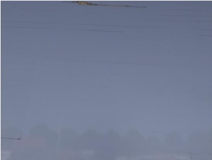
9: Qtr Panel osr Scratched Over 25mm Thru Paint