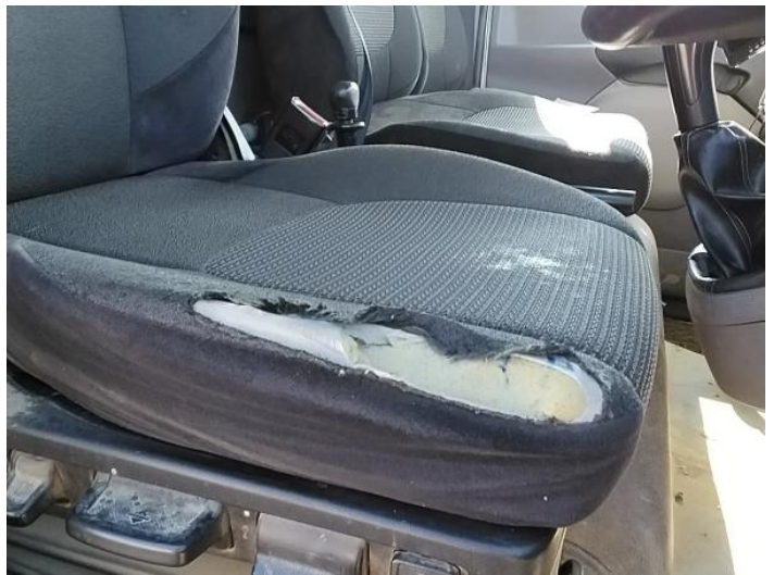
12: Seat Base Cover osf Torn Over 3mm