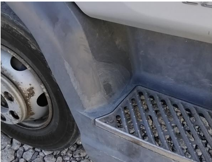
11: General Exterior Soiled Light