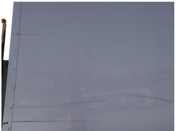
8: Qtr Panel osr Scratched Over 25mm Thru Paint