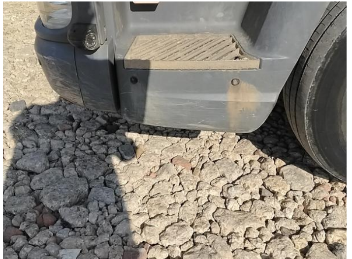
6: General Exterior Soiled Light