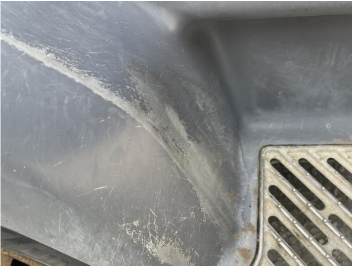
3: Door Moulding osf Scuffed (Unpainted) Over 100mm