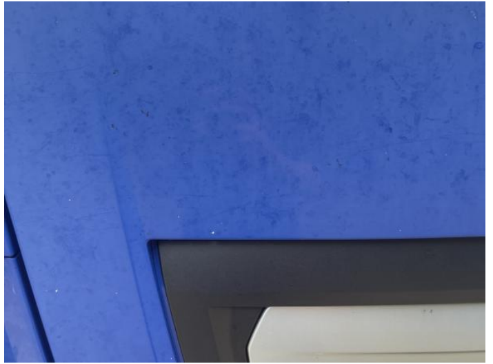
4: Bonnet Chipped Multiple Chips