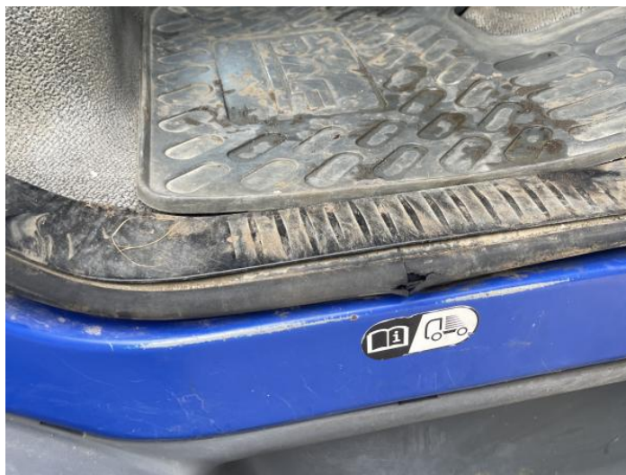
2: Sill os Scratched Over 25mm Thru Paint