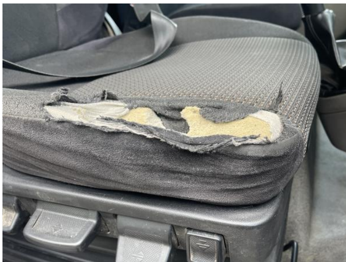
1: Seat Base Cover osf Torn Over 3mm