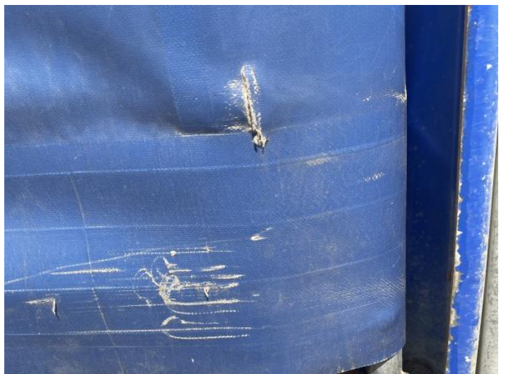
8: Qtr Panel nsr Hole UpTo 10mm