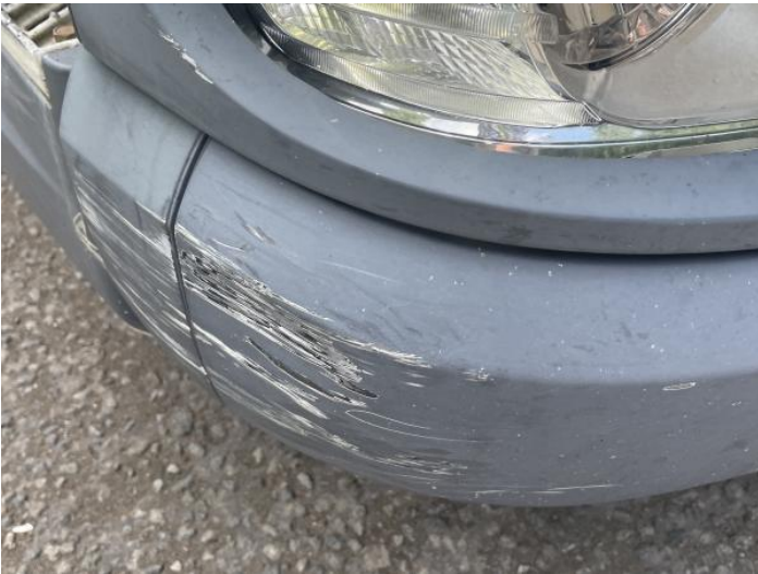
5: Bumper Front Dented With Paint Damage