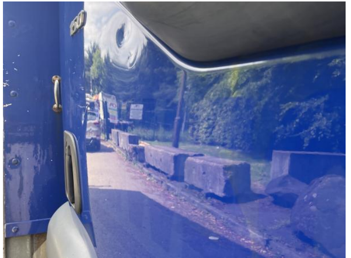
6: Door osf Dented With Paint Damage