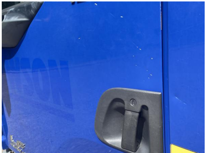
9: Qtr Panel nsr Rusted Over 5mm