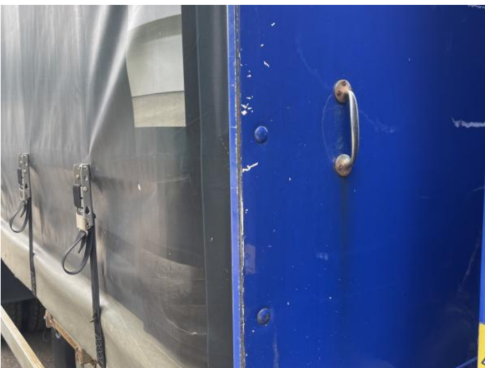
7: Qtr Panel osr Scratched Over 25mm Thru Paint