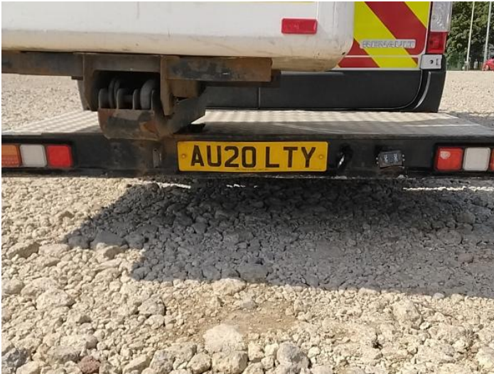
9: Bumper Rear Dented With Paint Damage