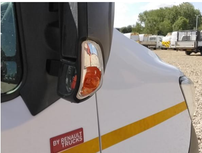
13: Door Mirror Assy osf Broken Replace