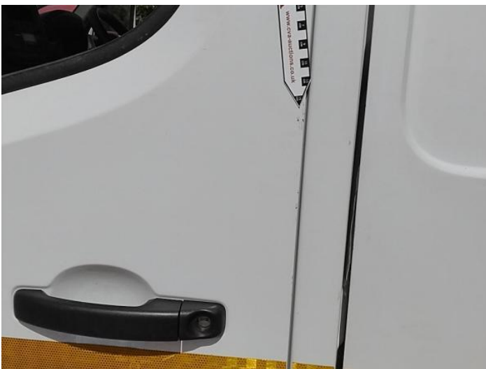
7: Door nsf Chipped Edge Chip