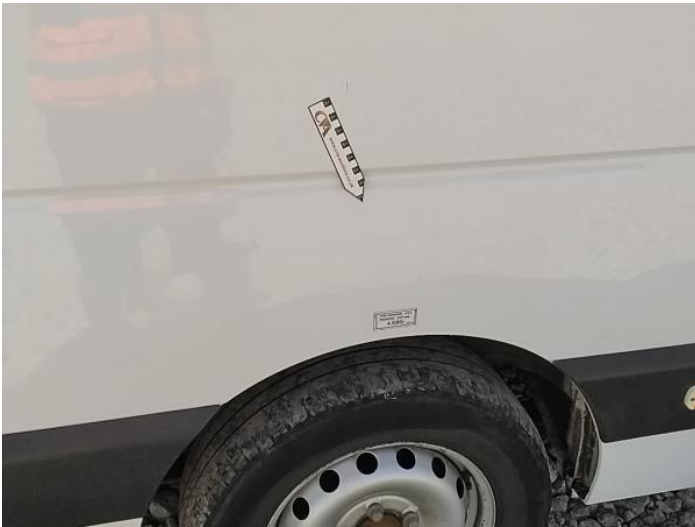
11: Qtr Panel osr Dented Over 30mm