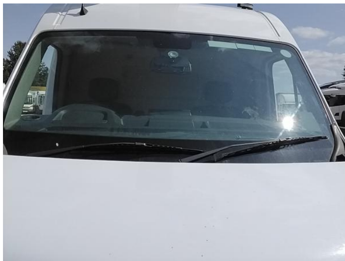
2: Screen Front Chipped UpTo 10mm