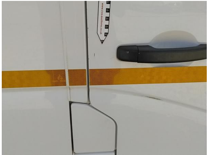
12: Door osf Dented Over 2 UpTo 10mm