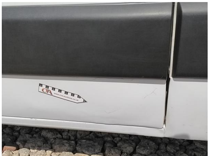
8: Door nsr Cracked Replace