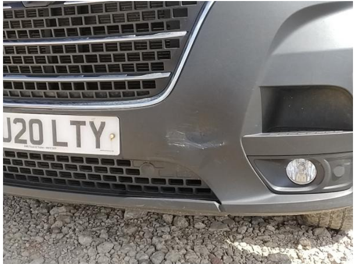
4: Bumper Front Dented Over 30mm