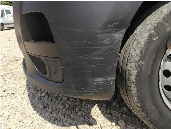
5: Bumper Front Scratched Over 25mm Not Thru Paint