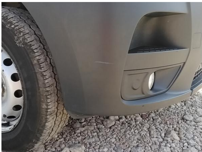
1: Bumper Front Scratched Over 25mm Not Thru Paint