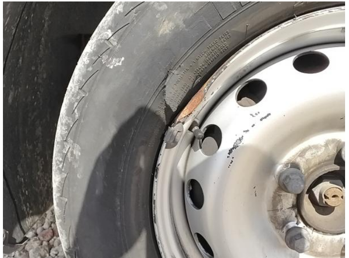
6: Wheel nsf Dented Over 30mm (Steel)