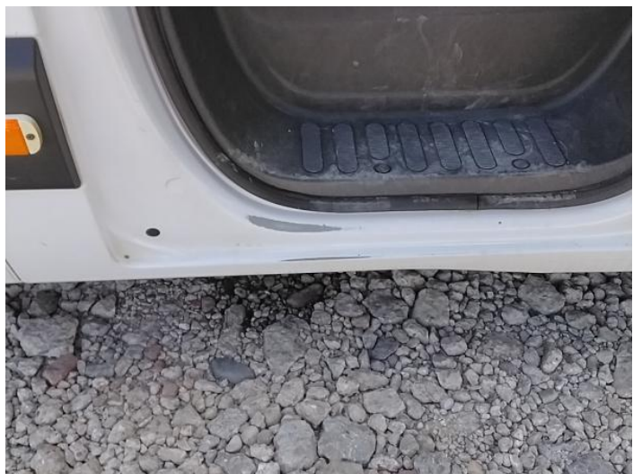
14: General Exterior Soiled Light