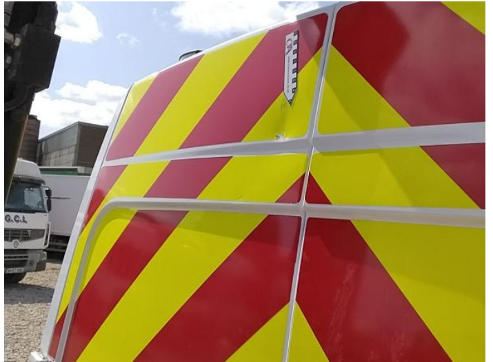
10: Door nsr Dented Over 30mm