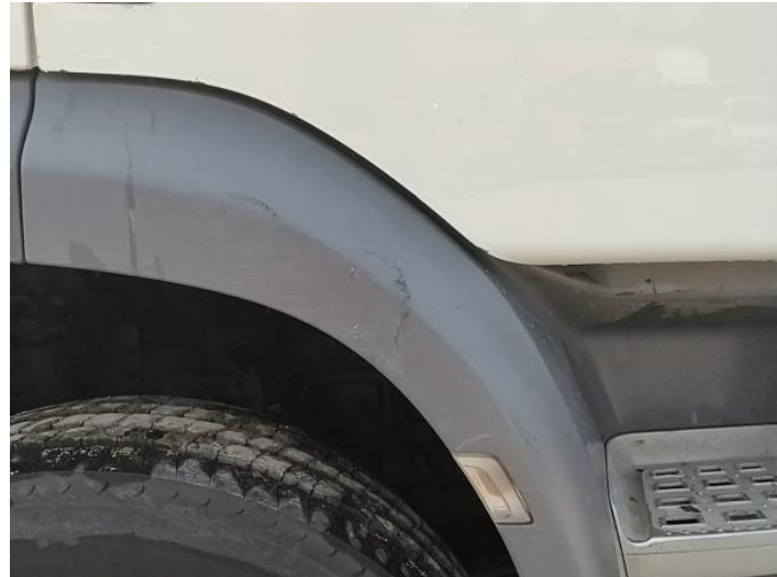
7: Wing Front Arch Extension os Scuffed (Unpainted) Over 100mm