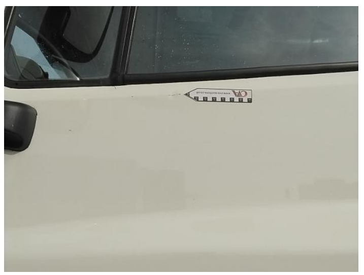
3: Door nsf Dented Over 2 UpTo 10mm