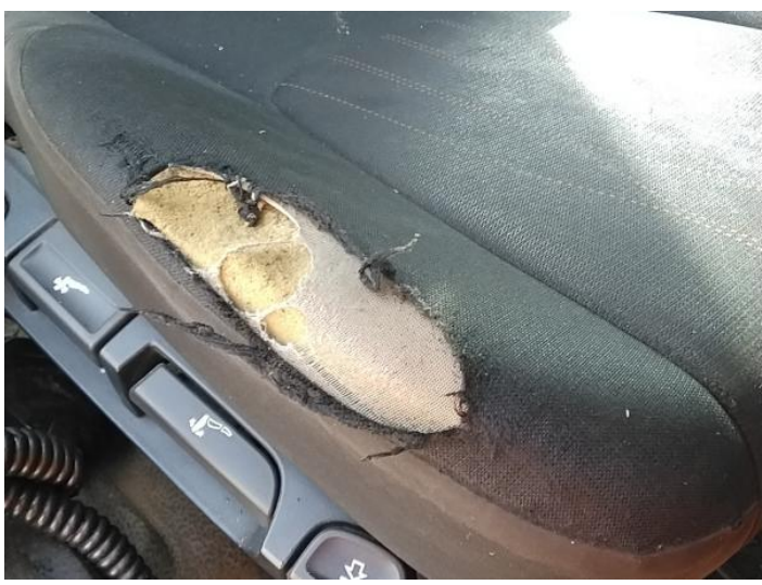
9: Seat Base Cover osf Torn Over 3mm