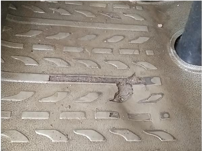
8: Carpets Front Holed Over 3mm