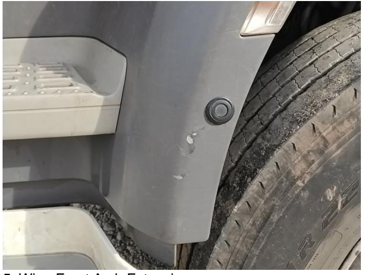
5: Wing Front Arch Extension ns Scuffed (Unpainted) Over 100mm