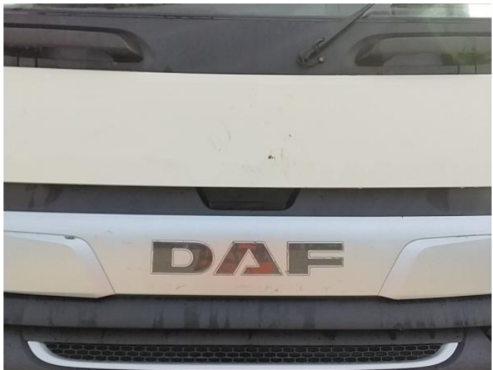
2: Bonnet Scratched Over 25mm Thru Paint