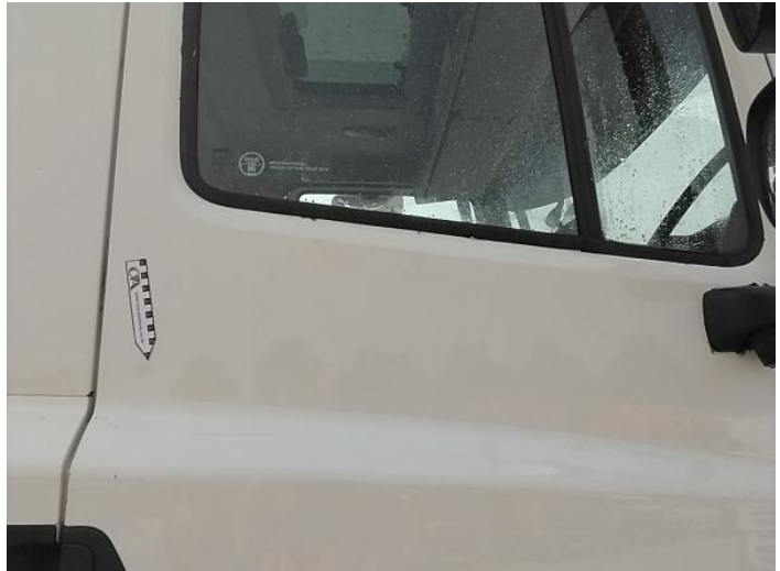
6: Door osf Dented Over 2 UpTo 10mm