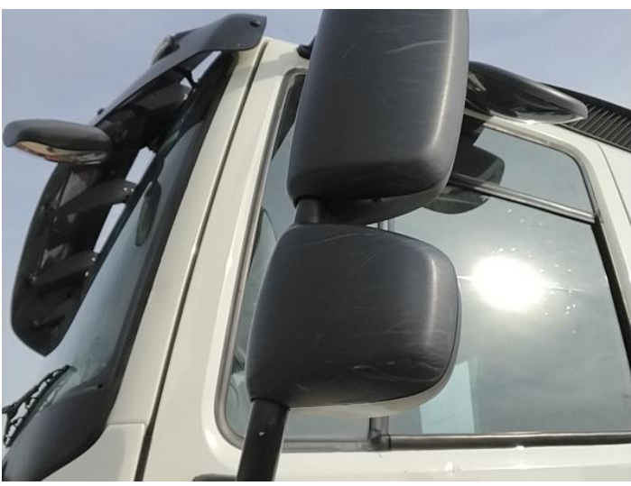
4: Door Mirror Assy nsf Scuffed (Unpainted) Over 100mm