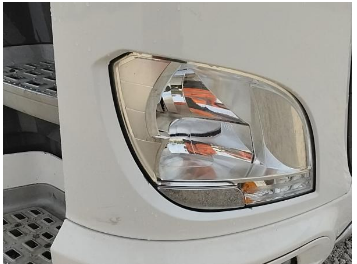
1: Fog Lamp Surround os Scratched (Painted) Over 25mm Thru Paint