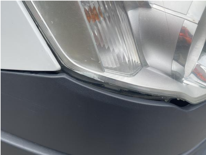
3: Bumper Front Moulding Scuffed (Unpainted) Over 100mm