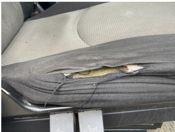
1: Seat Base Cover osf Torn Over 3mm