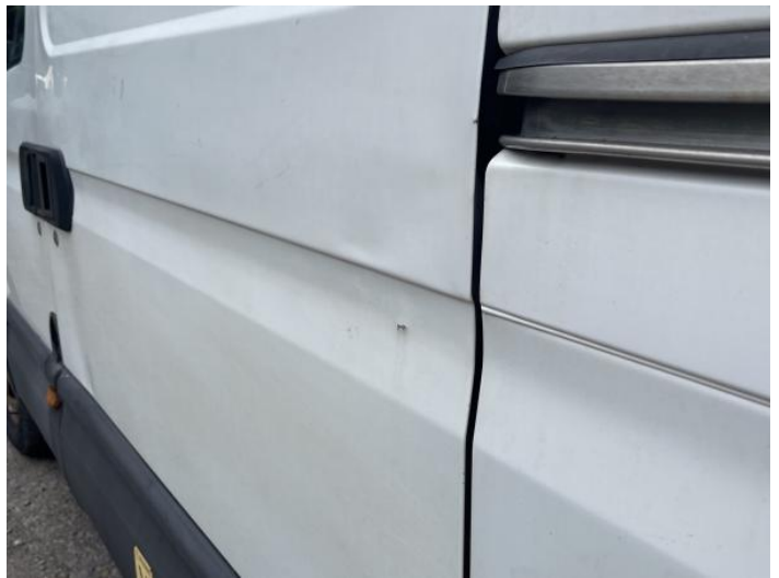
6: Door nsr Dented With Paint Damage