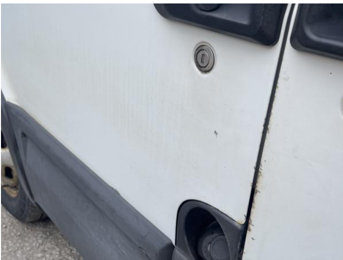
7: Door nsf Rusted Over 5mm