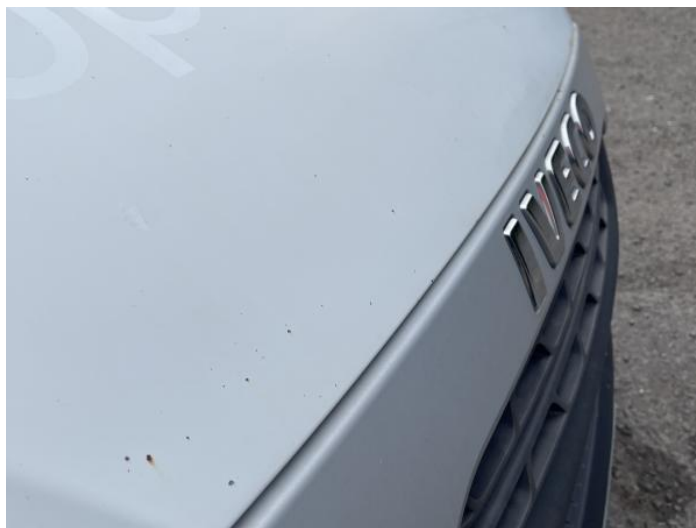
2: Bonnet Dented With Paint Damage