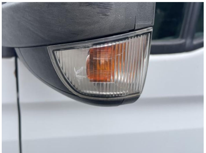
8: Flasher Side Repeater ns Broken Replace