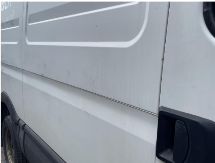
5: Qtr Panel osr Rusted Over 5mm