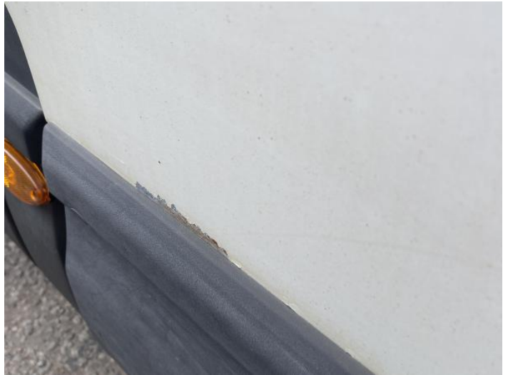
4: Door osf Rusted Over 5mm