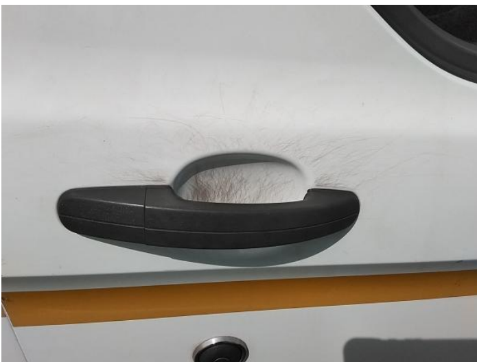
7: Door osf Scratched Over 25mm Thru Paint