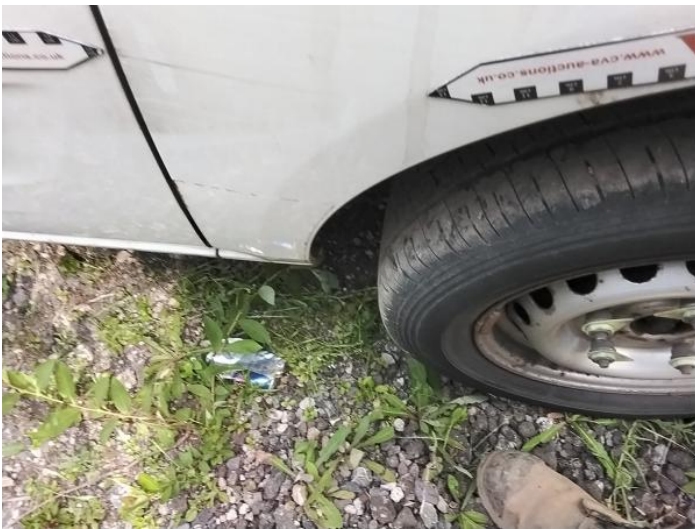
5: Qtr Panel nsr Scratched Over 25mm Not Thru Paint