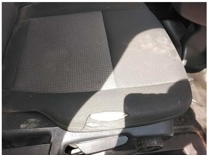
8: Seat Base Cover osf Holed Over 3mm