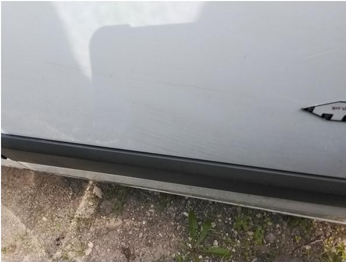
3: Qtr Panel nsr Scratched Over 25mm Thru Paint