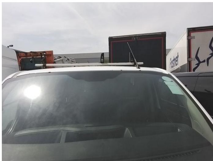
2: Roof Chipped Multiple Chips