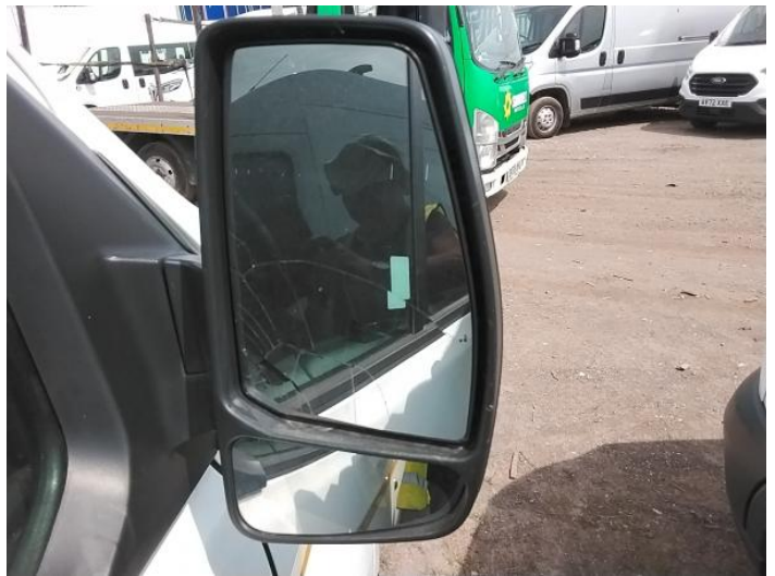
6: Door Mirror Glass os Broken Replace