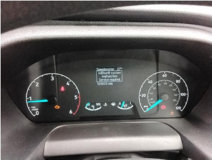
9: Dash Warning Lights Displayed No Action