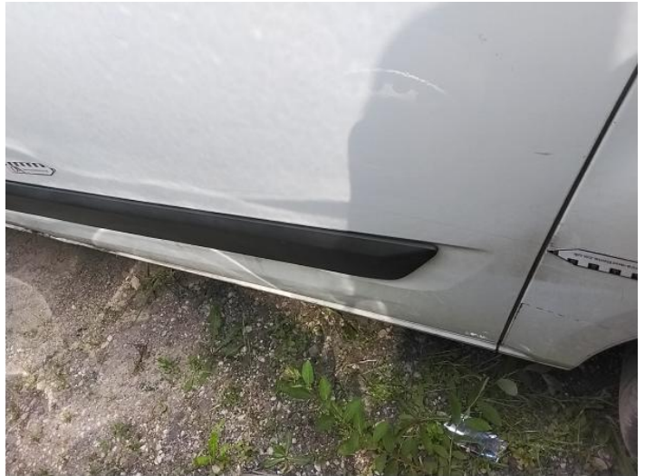
4: Qtr Panel nsr Scratched Over 25mm Not Thru Paint